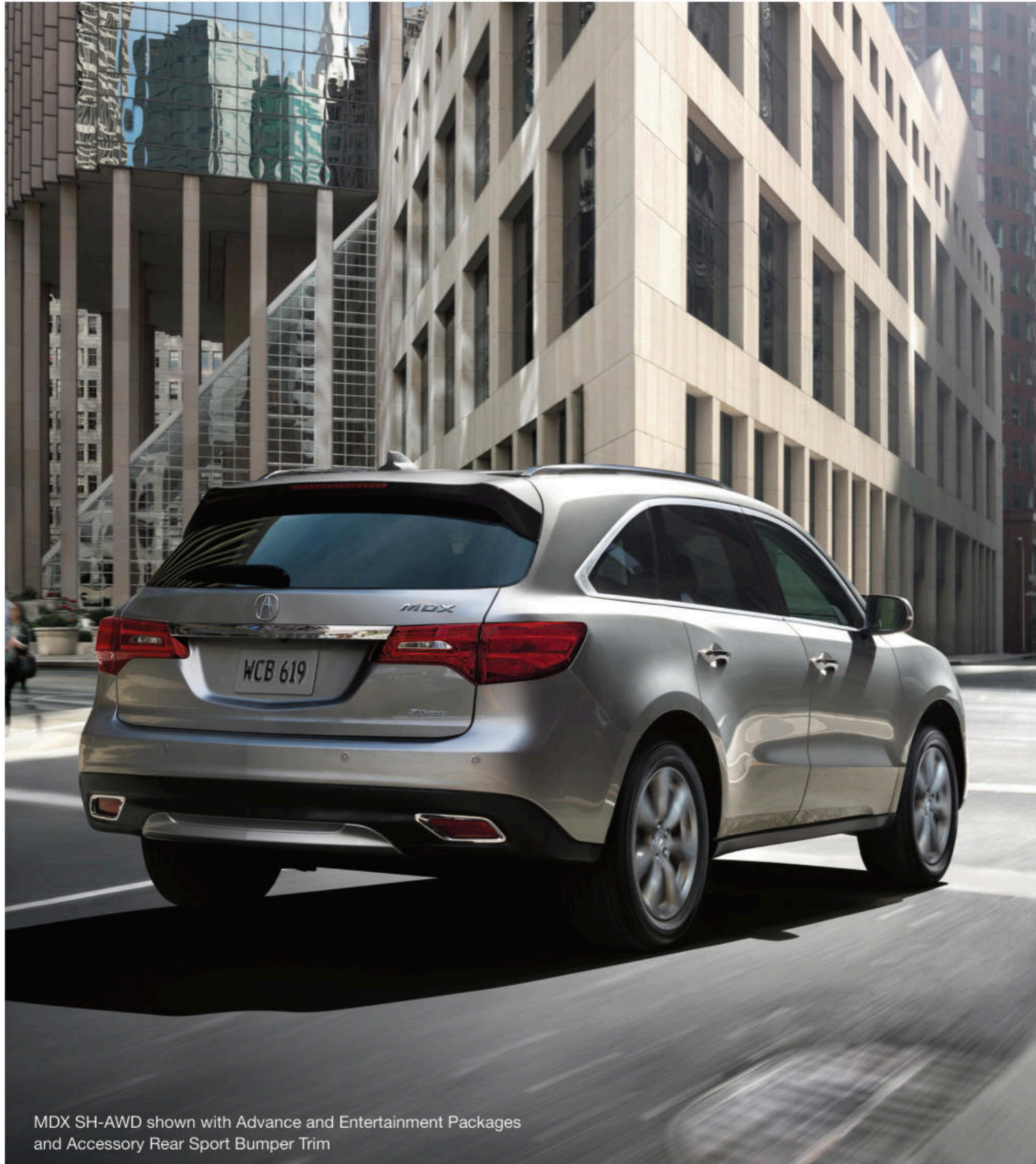
MDX SH-AWD shown with Advance and Entertainment Packages and Accessory Rear Sport Bumper Trim