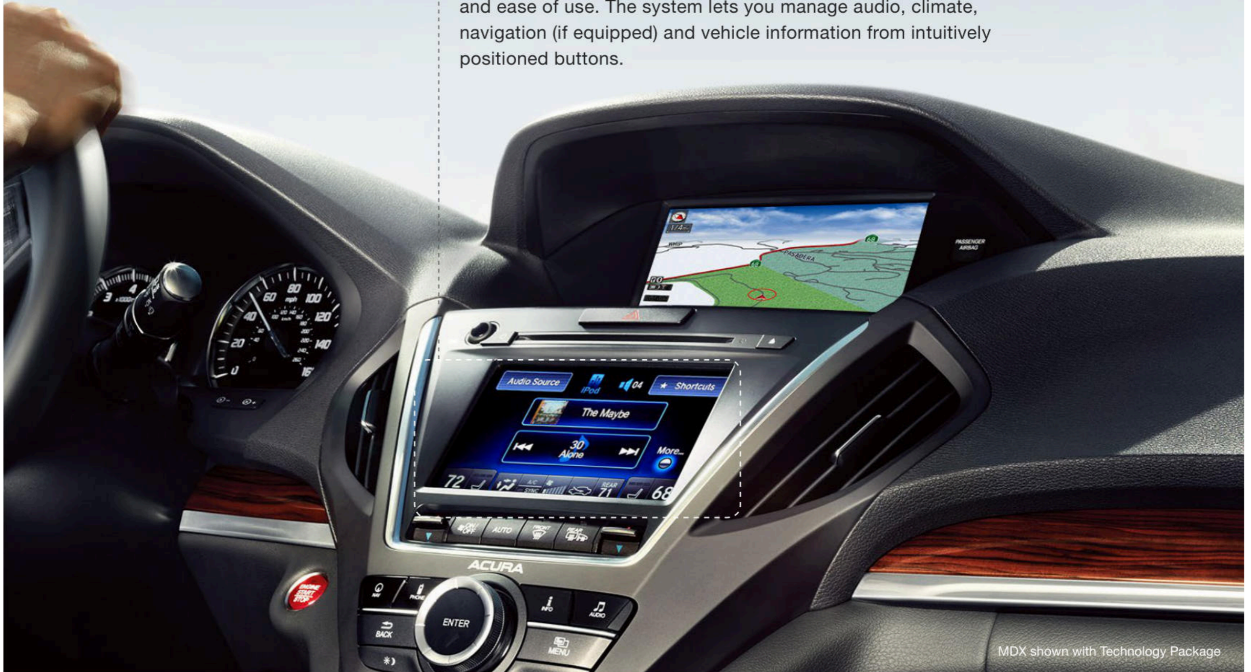
MDX shown with Technology Package

The Acura On Demand Multi-Use Display™ (ODMD™) is the definitive touch-screen interface. Featuring a hand-level screen that is separate from the eye-level display-only screen, the ODMD™ has been designed for even greater functionality and ease of use. The system lets you manage audio, climate, navigation (if equipped) and vehicle information from intuitively positioned buttons.