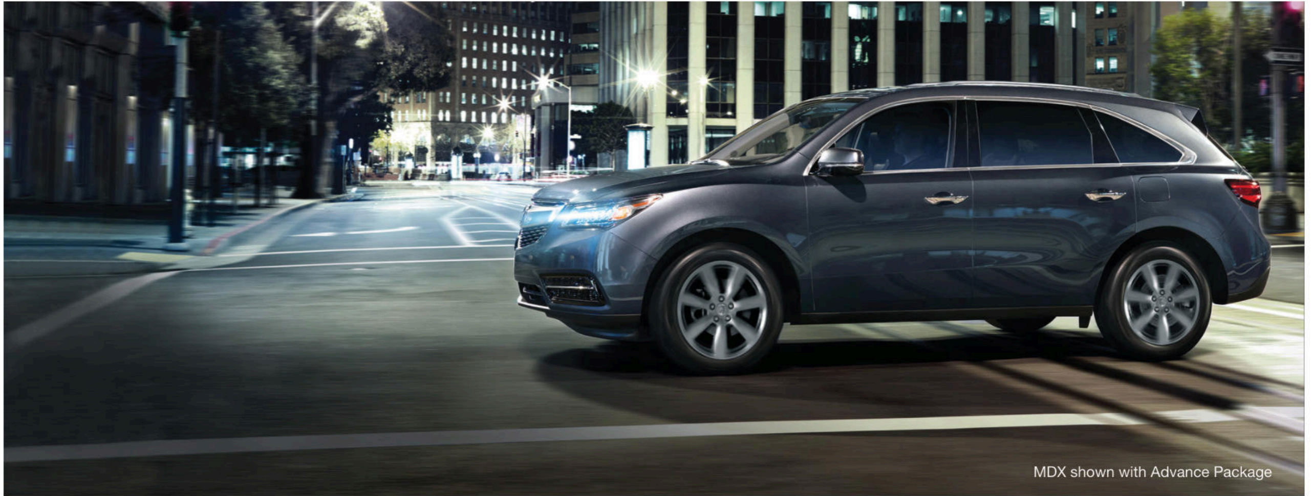
MDX shown with Advance Package