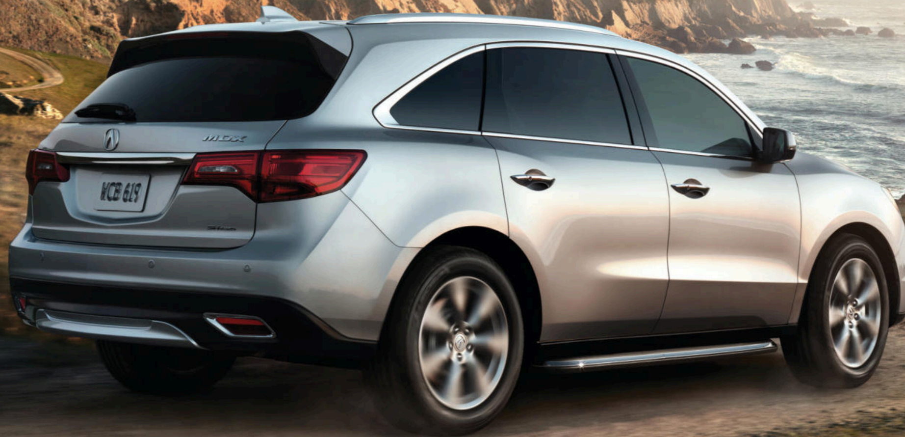
MDX SH-AWD shown with Advance and Entertainment Packages, Accessory Rear Sport Bumper Trim and Advance Running Boards