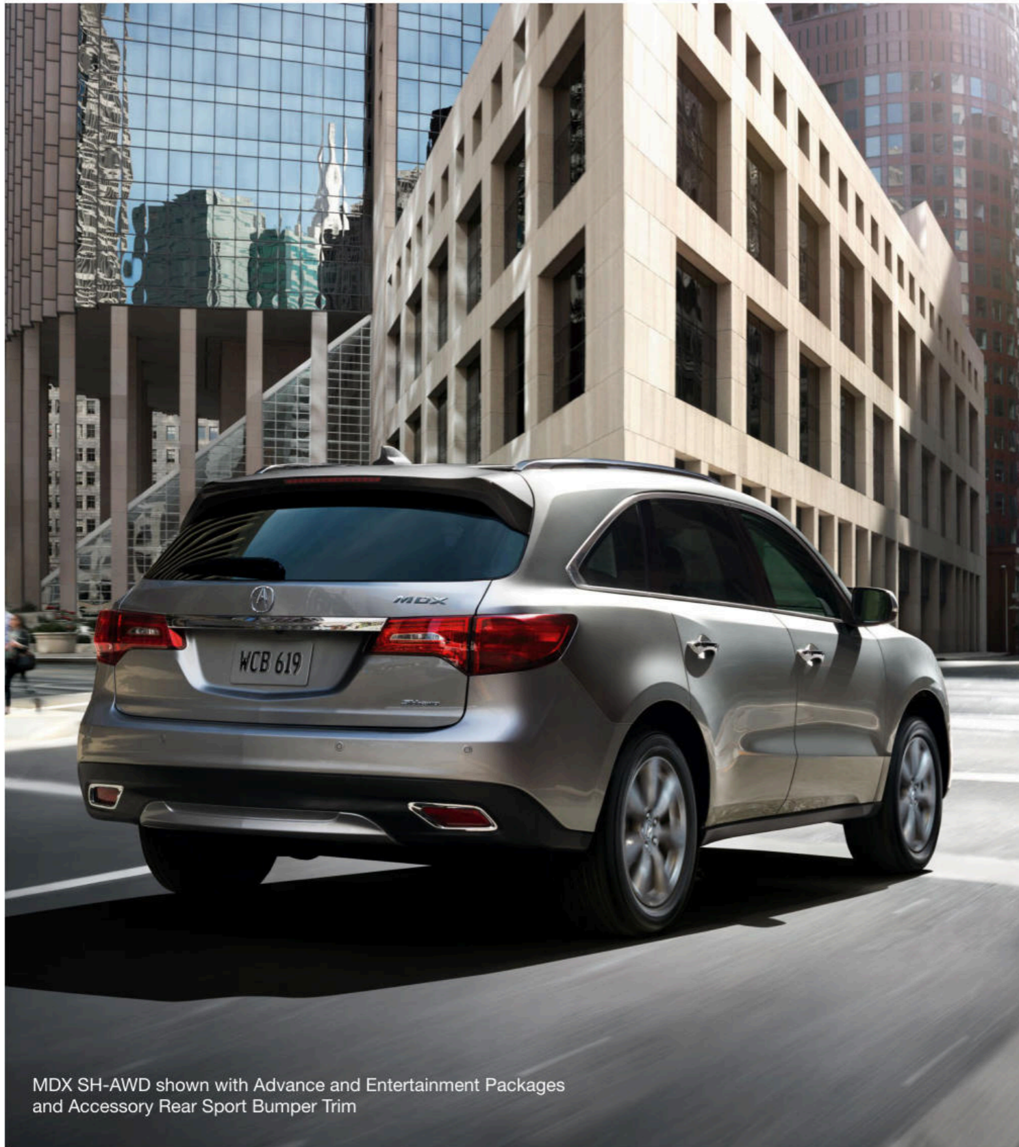
MDX SH-AWD shown with Advance and Entertainment Packages and Accessory Rear Sport Bumper Trim