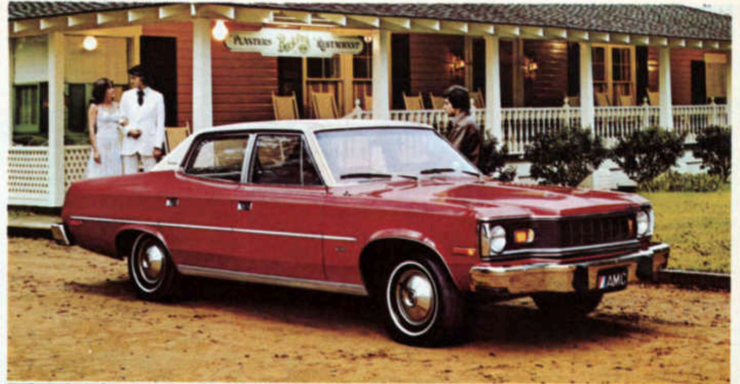
Matador Brougham Sedan