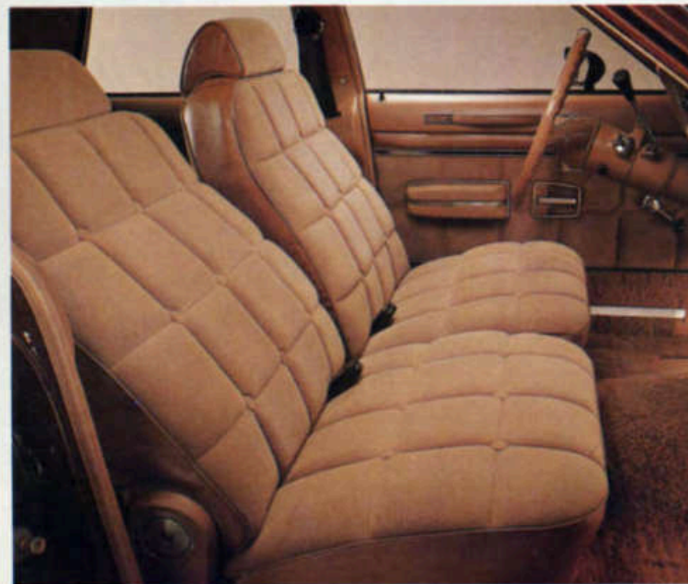
Hornet D/L 2-Door and 4-Door Sedan interior; individual reclining seats in tan Kasmir Knit fabric. This option is available in this color only.