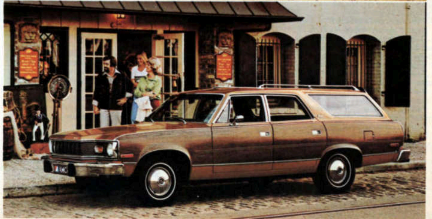
Matador Brougham Wagon