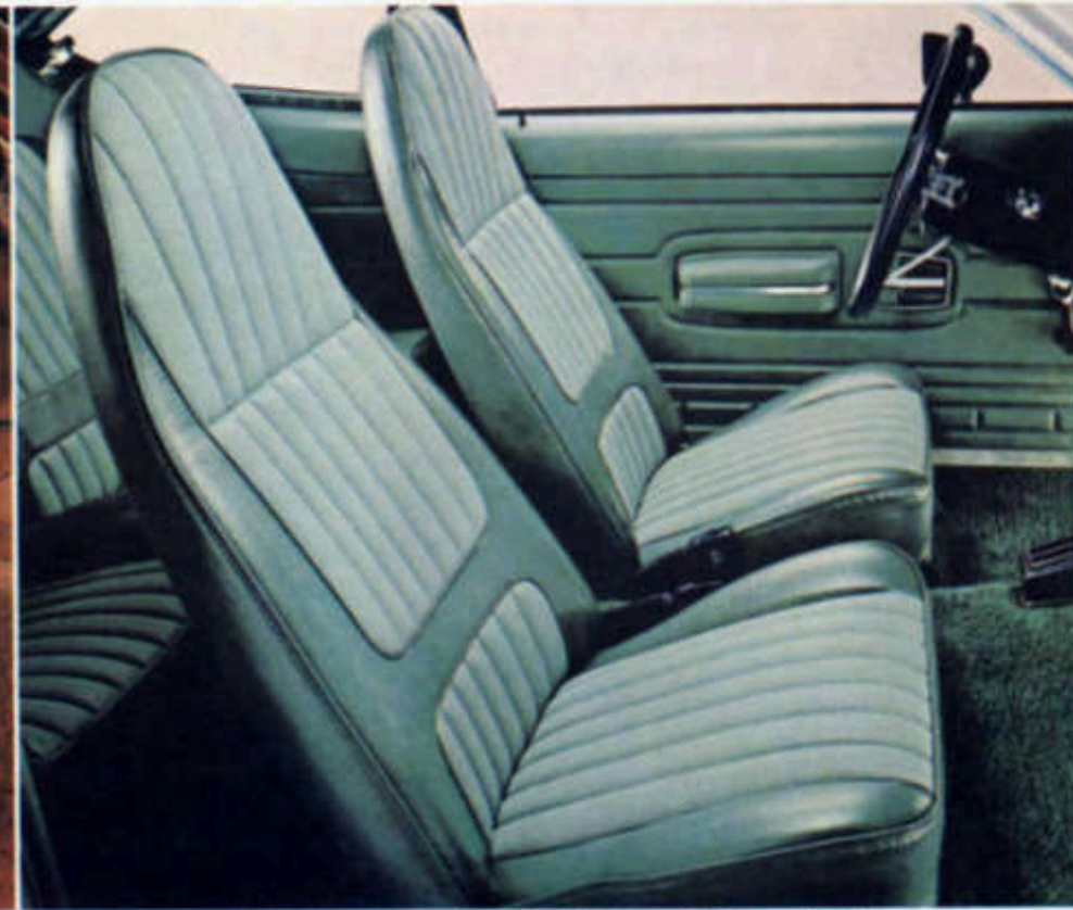
Hornet Hatchback X high-back bucket seats in green Fairway vinyl. This option also comes in black, white, blue and tan.