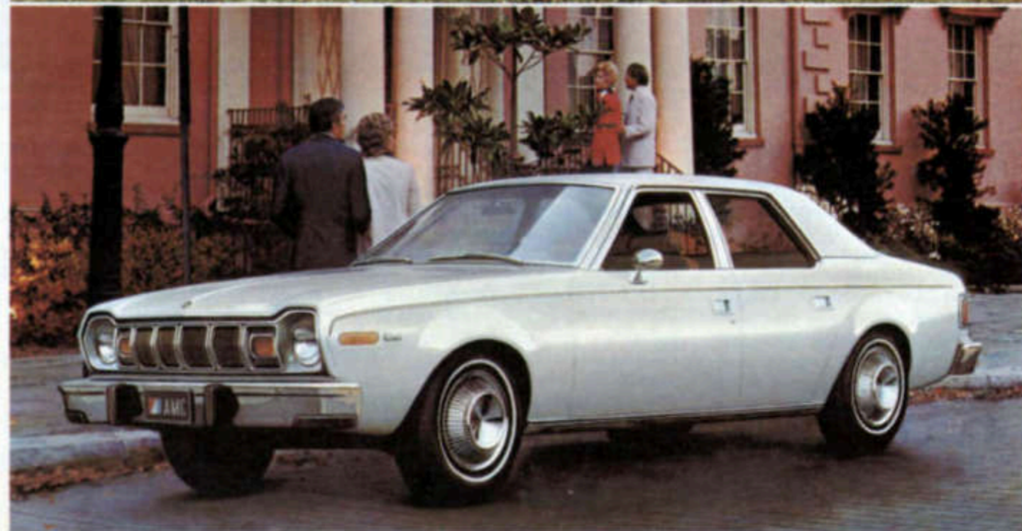
Hornet 4-Door Sedan (2-Door Sedan also available)