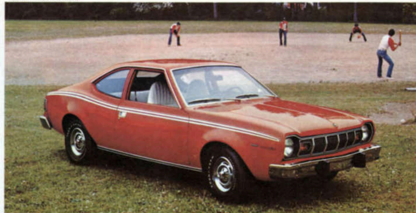
Hornet Hatchback X