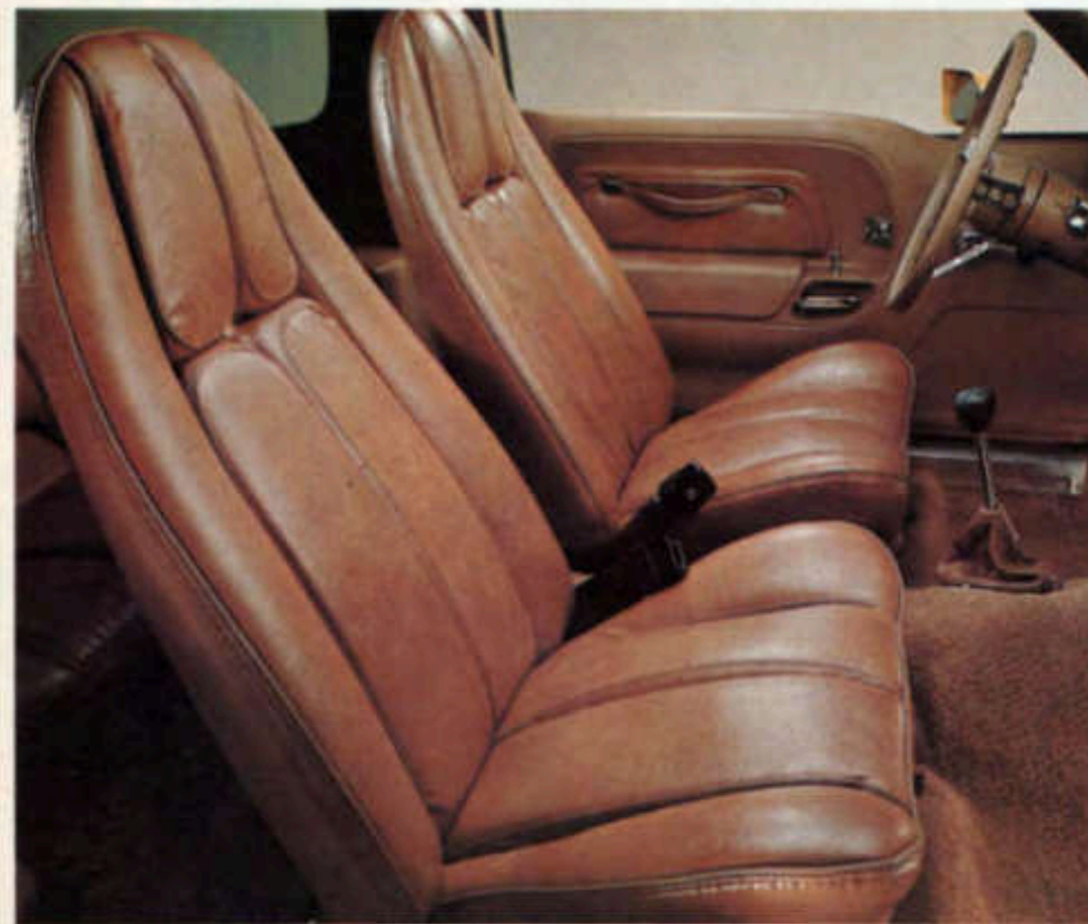
Pacer high-back bucket seats in tan Sof-Touch vinyl optional on all Pacer models (standard with "X" Package). Also comes in black, white, blue and berry.