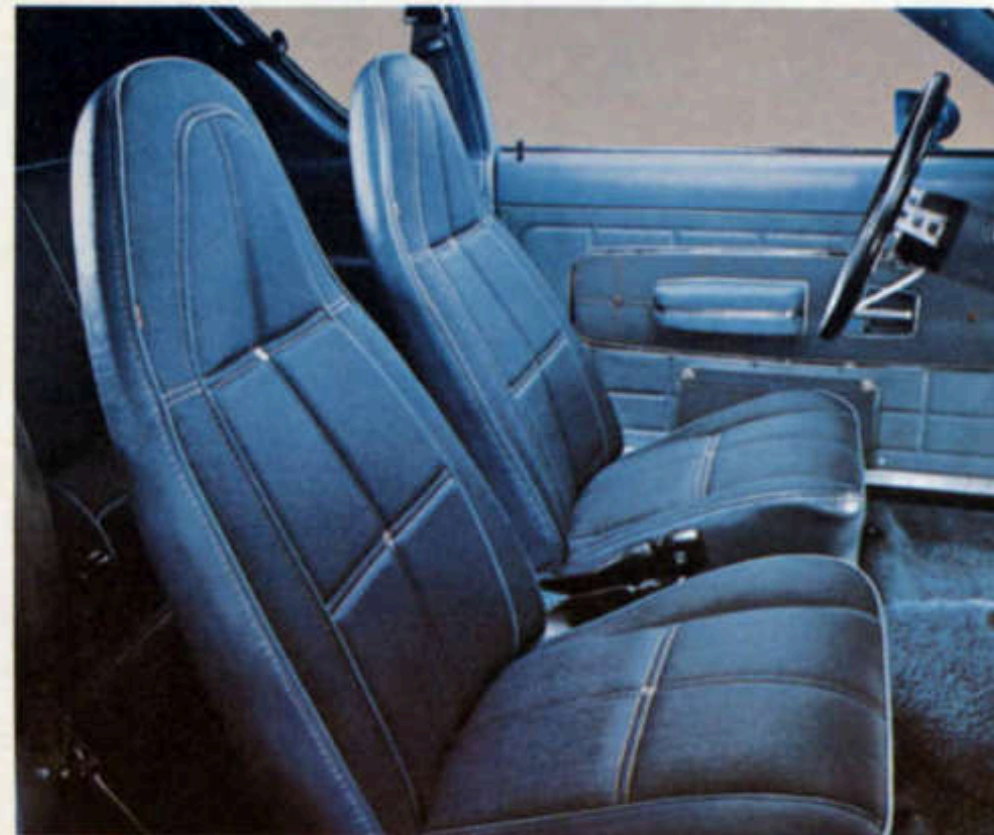
Gremlin Levi's interior. This exclusive option includes high-back bucket seats with a blue denim look and much more. Bucket seats also available with pleated vinyl.