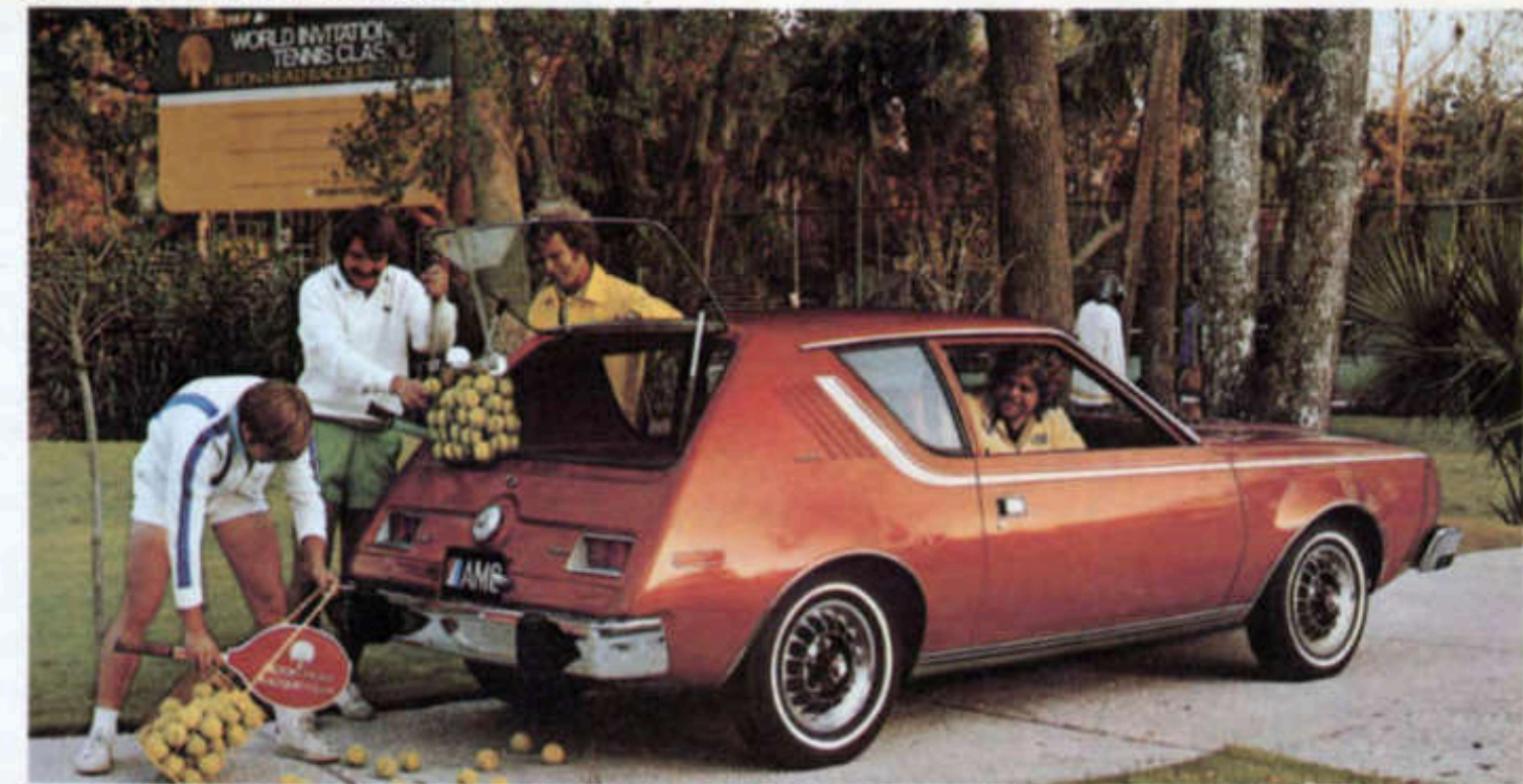
Custom Gremlin (rally stripe optional)