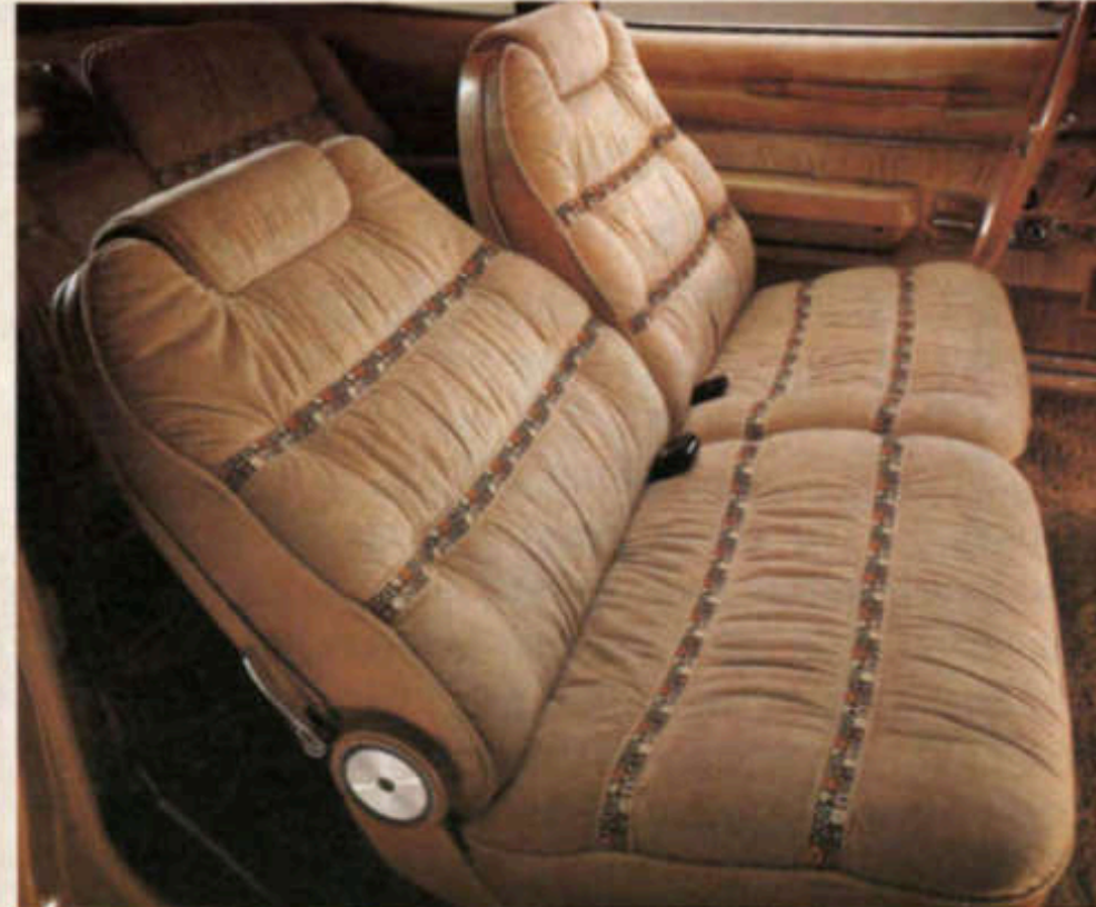
Individual reclining seats in tan Barcelona trim. This Matador Brougham Coupe option is also available in luxurious black.