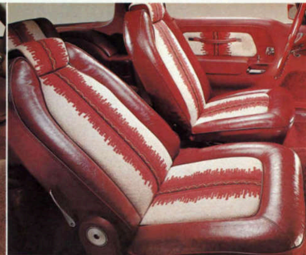
Pacer D/L optional individual reclining seats in berry "Basketry Print" fabric. Black, blue, tan also available in this option.