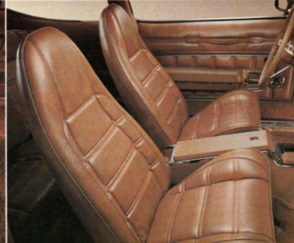
Matador Coupe high-back bucket seats in tan Sof-Touch vinyl. Black, white and blue are other choices with this option.