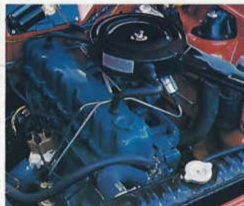
232 CID six (Pacer, Gremlin, Hornet)