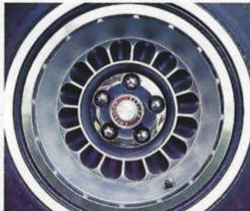
Styled road wheels (all models)