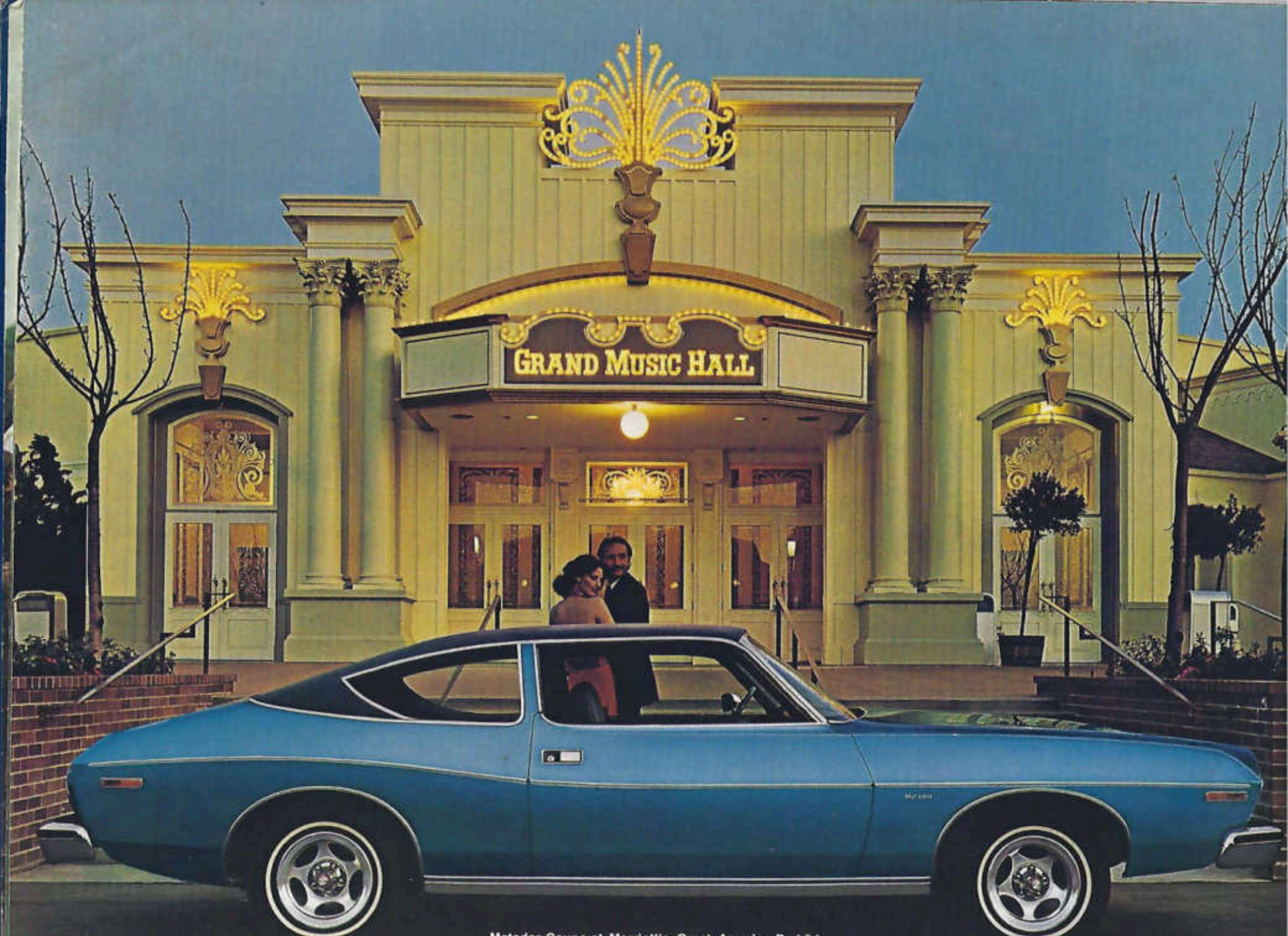
Matador Coupe at Marriott's Great America Park® in Santa Clara, California, where American Motors sponsors the "Grand Music Hall" show, and also at