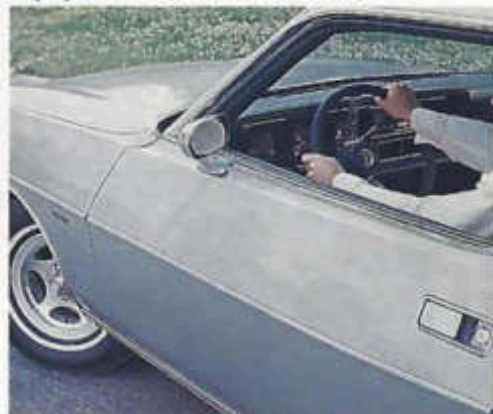
Door opening (Matador)