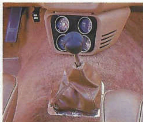
4-speed trans. (Gremlin, Pacer, Hatchback)