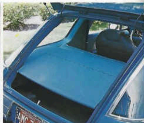
Lockable cargo cover (Pacer Sedan)