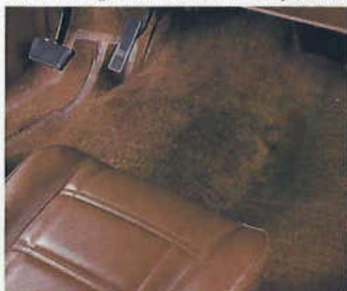
Color-keyed carpeting (all models)