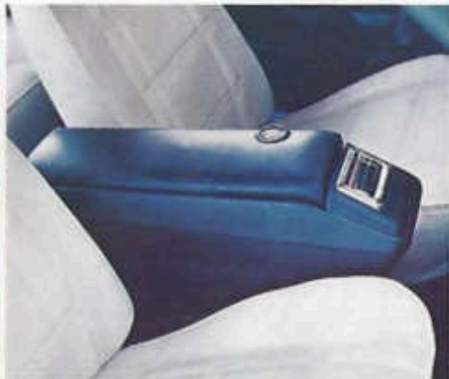
Console (Gremlin, Pacer & Hatchback)