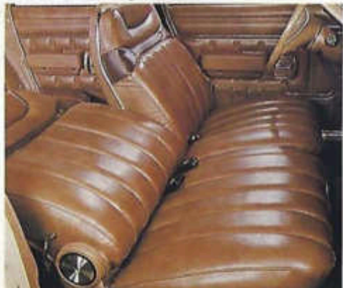
Individual reclining seats (Matador)