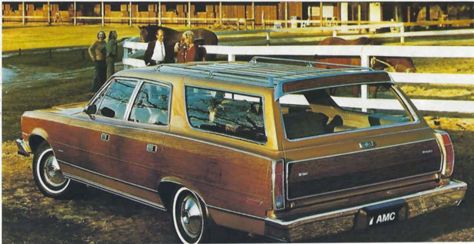
▲ Matador Sedan ▼ Matador Wagon