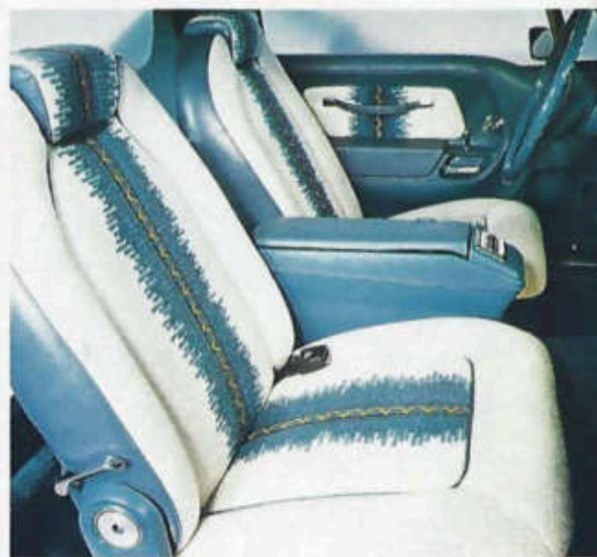
Individual reclining seat option in Basketry Print fabric (Pacer). Console optional.