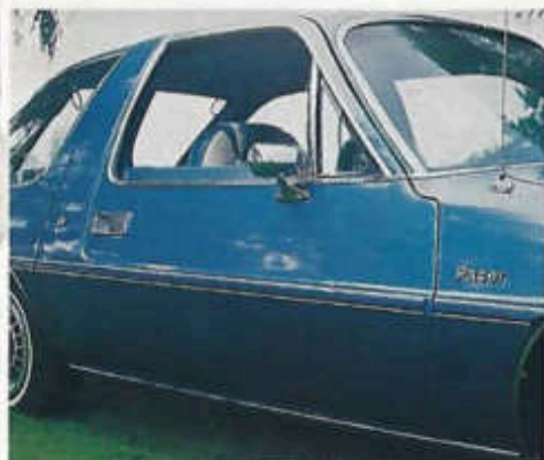
Scuff molding (Pacer & Matador)

Highlighted here are some of the standard features you'll find on the cars of the 1977 AMC line. There are many more, and your AMC dealer will be happy to point them out to you. See him soon and learn first hand . . . there's more to an AMC.