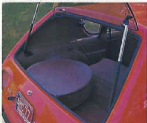
Gremlin's handy lift window