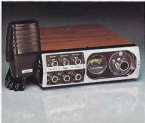
Citizen's Band radio (all models)