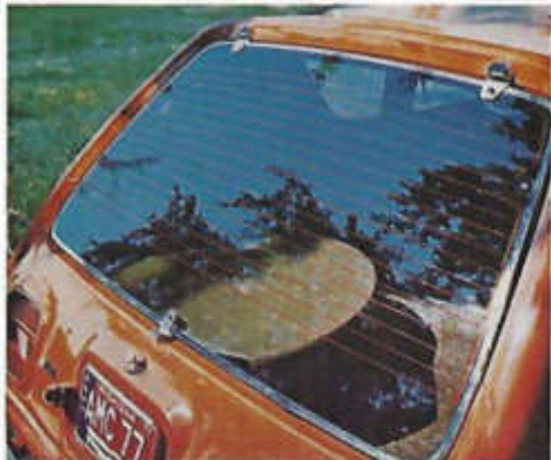
Rear window defogger (for most models)