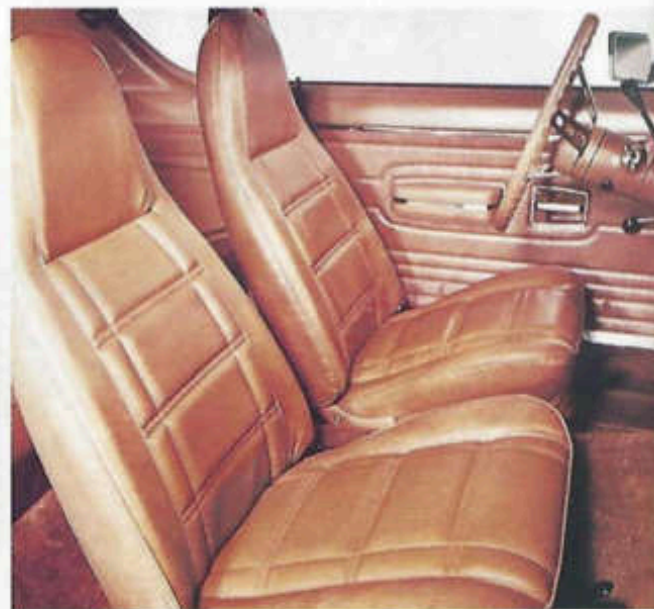
Optional bucket seats in Rallye Perforated vinyl