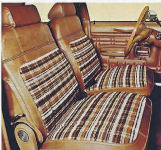
Individual reclining seat option in Veracruz fabric (Hornet D/L)