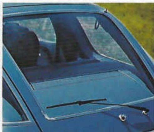
Rear window wiper/washer & defogger (Pacer)