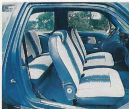
Extra-wide right door to ease rear entry (Pacer)