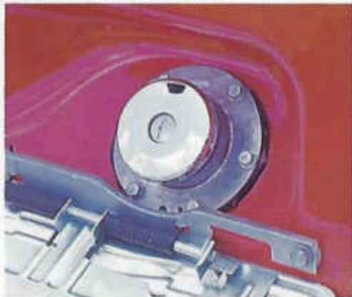
Locking gas can (all models)