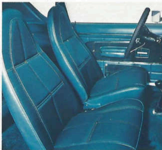
Levi's® trim option