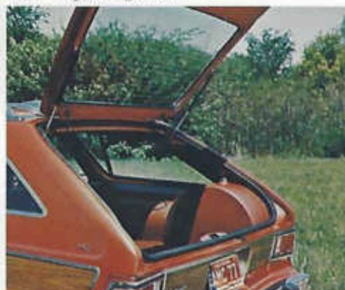
Rear lift-gate (Hornet Wagon)