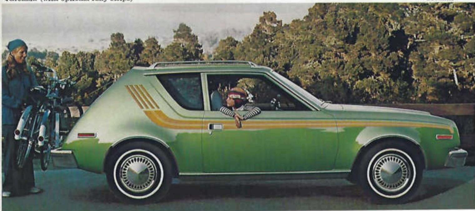
▲ Gremlin X ▼ Gremlin