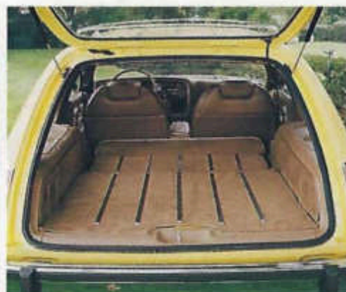
Pacer Wagon cargo area