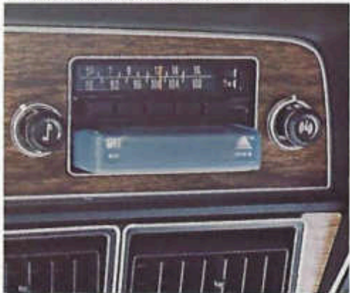
AM/FM Multiplex/Tape Stereo (Pacer, Matador)