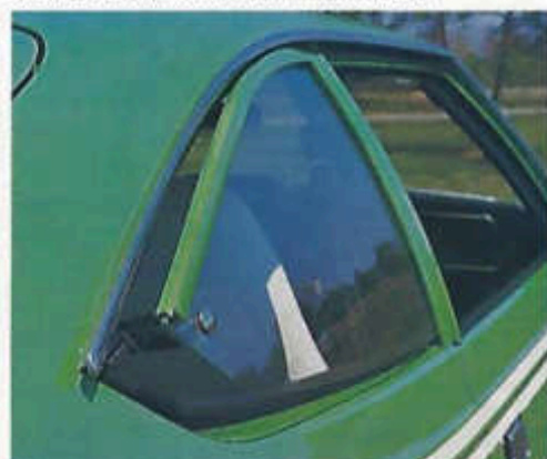
Flip-open rear window (Hatchback)