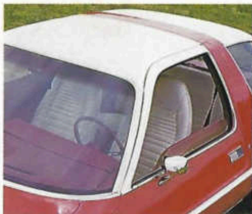
Vinyl roof (Pacer, Hornet, Matador)

You can put even more into your AMC with options and accessories Here are a few of the most popular selections Your AMC dealer can show you many others that will add greater enjoyment and value to any AMC model you choose.