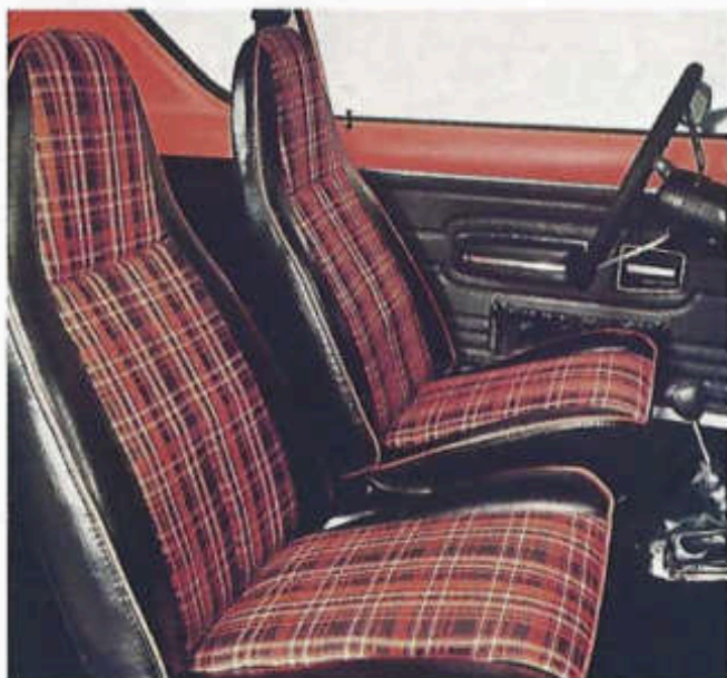
Hot-Scotch plaid fabric bucket seat option