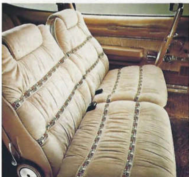
Optional Matador Barcelona Coupe interior trim in tan Nap Knit fabric. Seats adjust and recline individually

You'll be spending a lot of time in your new AMC—that's why we've made a special effort to make the interior so attractive and comfortable. Pictured here are representative interior choices of the entire '77 AMC line. Nothing, however, can compare with the real thing, which your AMC dealer is ready to show you now.