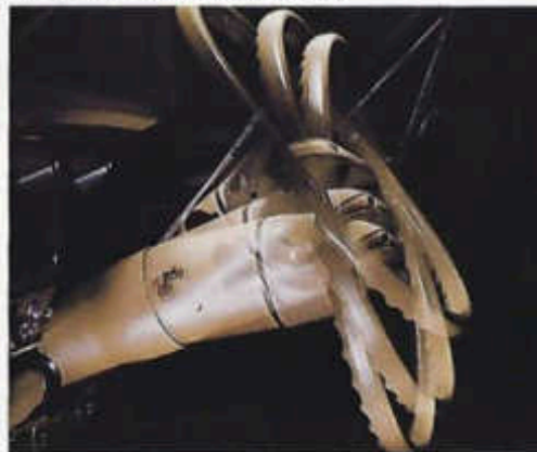
Leather driving gloves (all models)