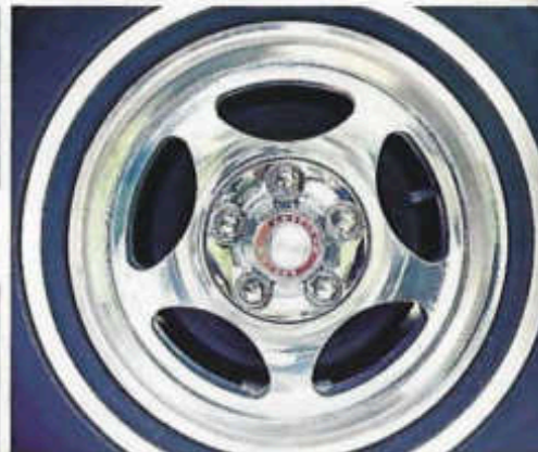
Aluminum wheels (all models)