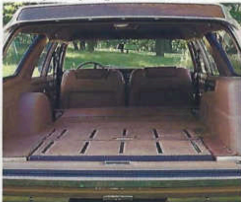
95-sq.-ft. load area (Matador Wagon)