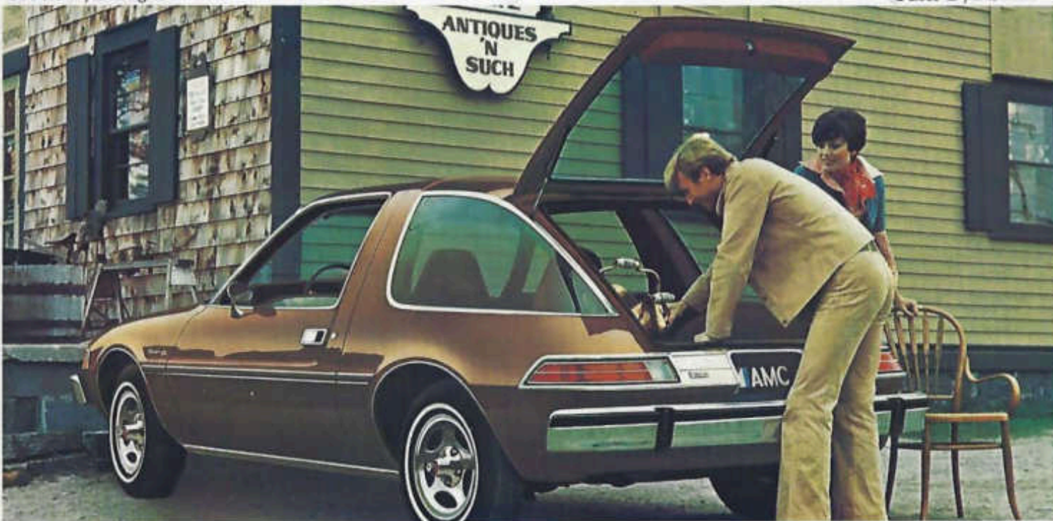
▲ Pacer X Sedan ▼ Pacer D/L Sedan