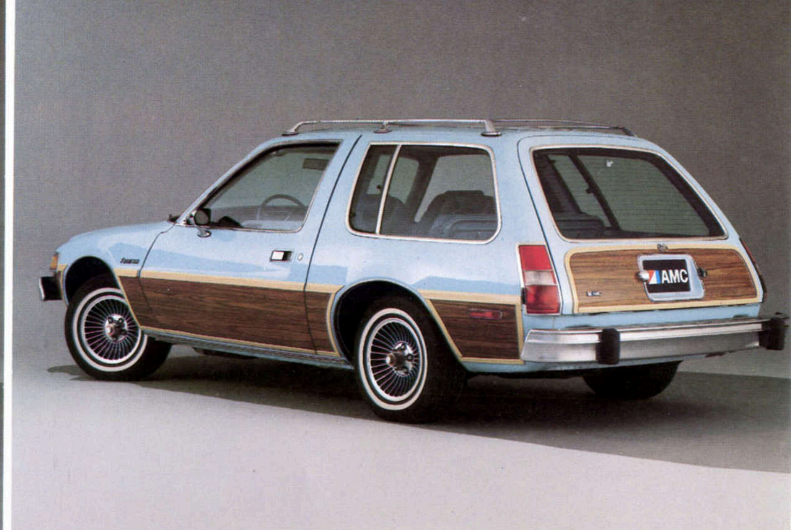
PACER DL HATCHBACK