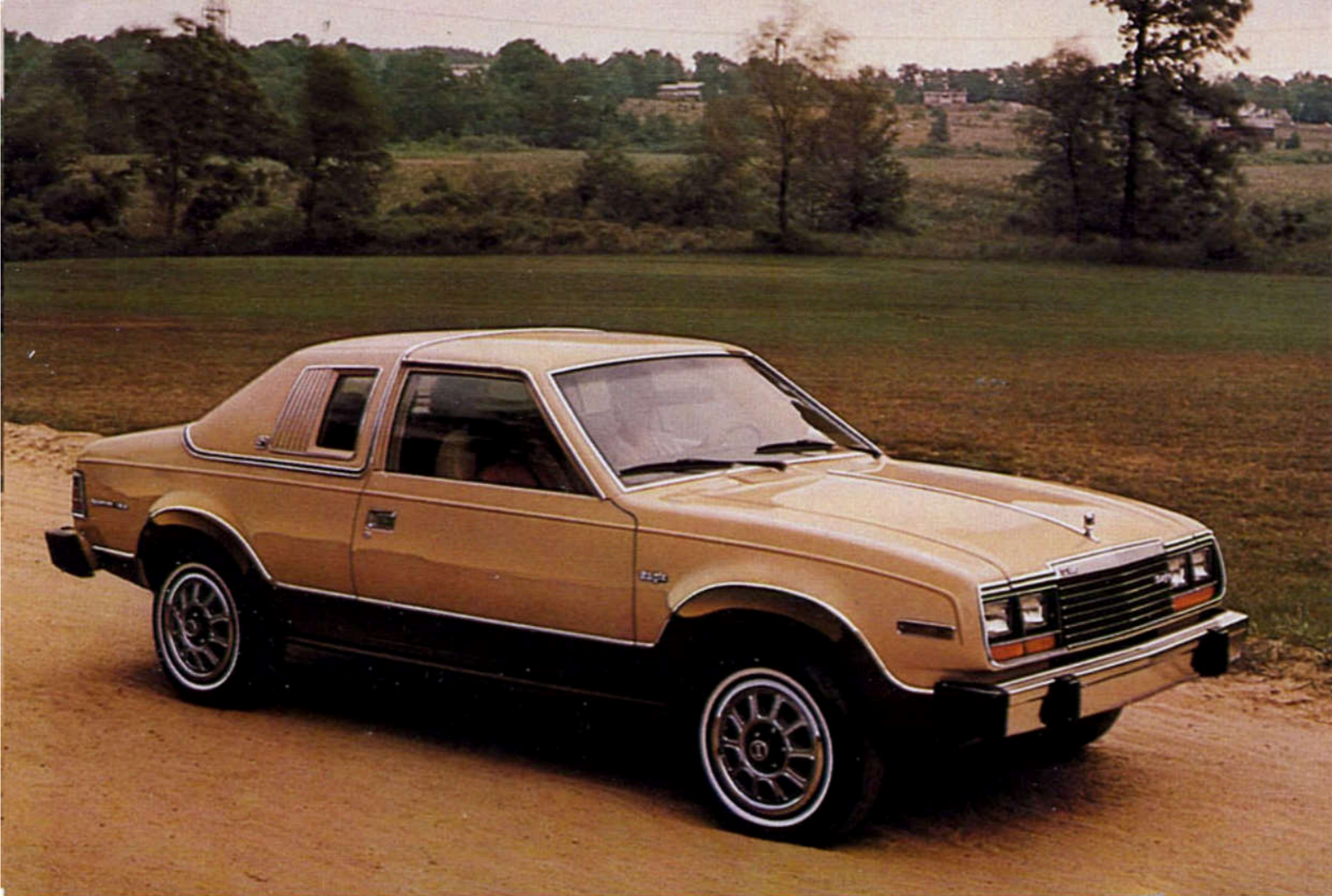
EAGLE 2-DOOR SEDAN (4-WHEEL-DRIVE AUTOMOBILE)