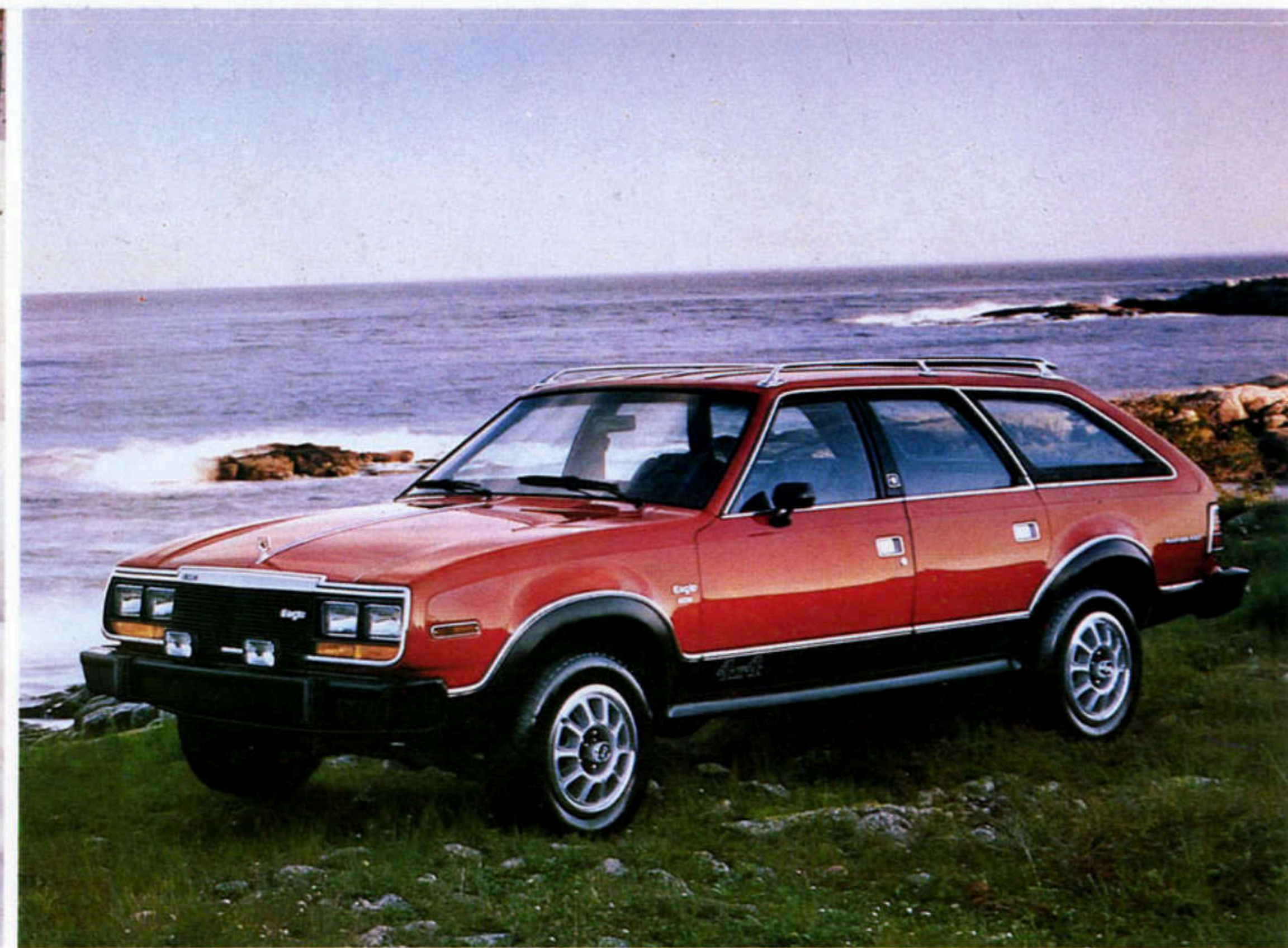
EAGLE SPORT WAGON (4-WHEEL-DRIVE AUTOMOBILE)