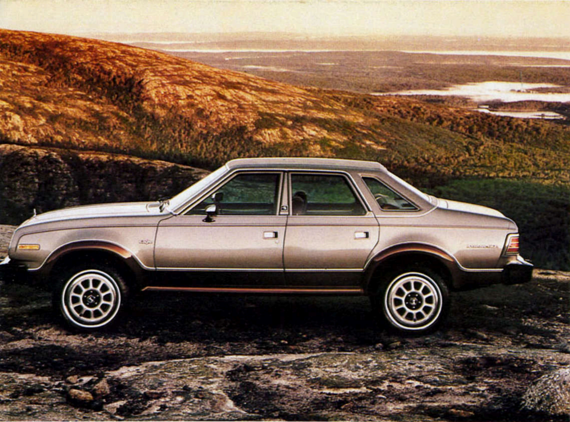
EAGLE 4-DOOR SEDAN (4-WHEEL-DRIVE AUTOMOBILE)