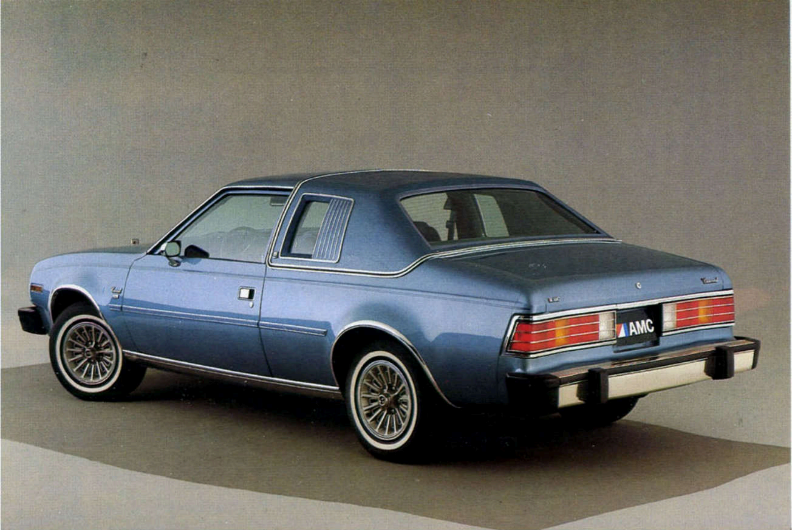
CONCORD DL 2-DOOR SEDAN