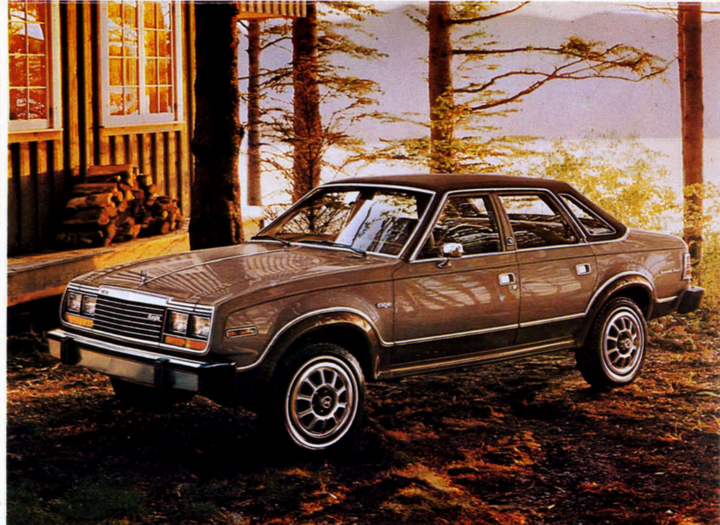
EAGLE 4-DOOR SEDAN (4-WHEEL-DRIVE AUTOMOBILE)