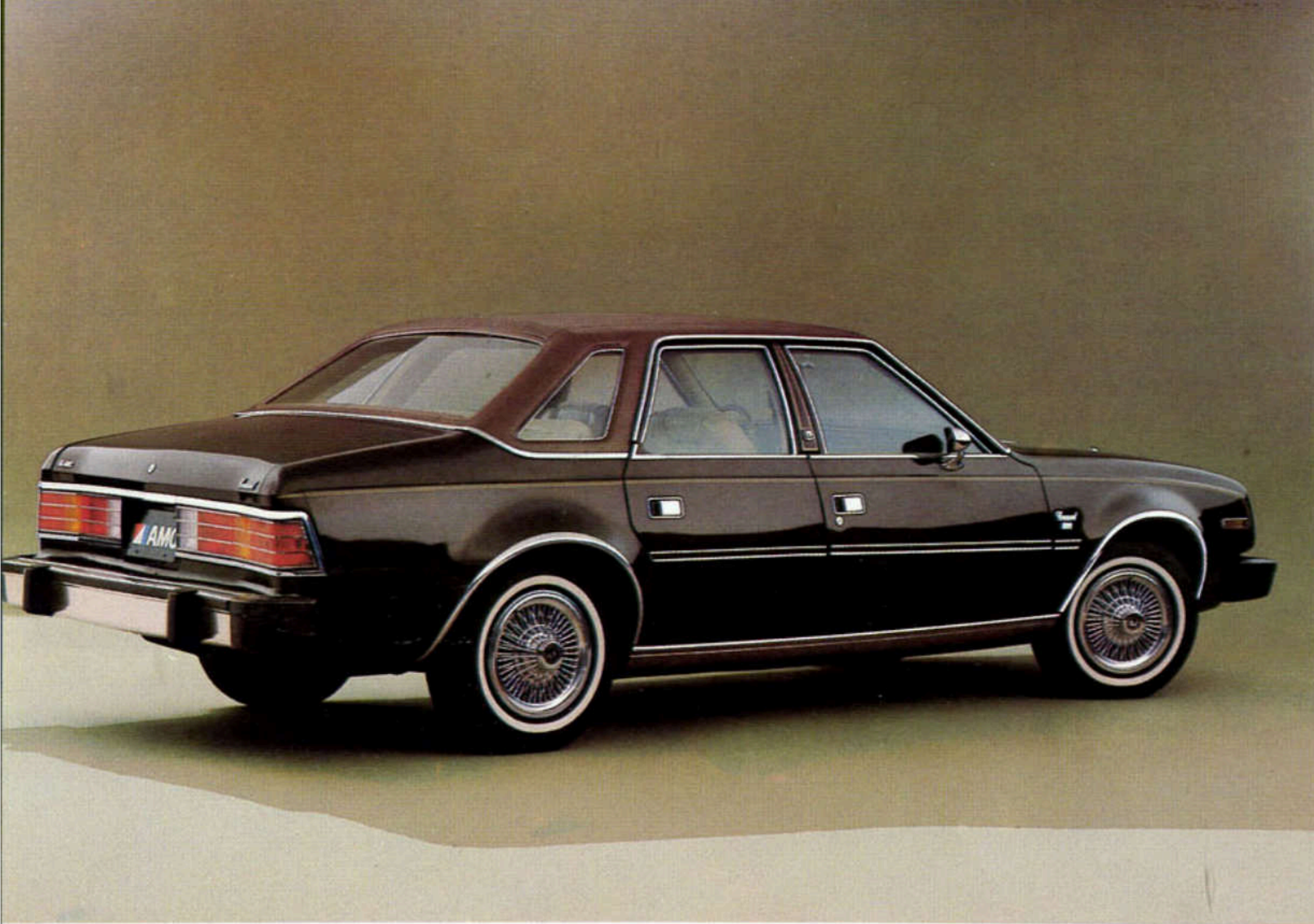
CONCORD LIMITED 4-DOOR SEDAN