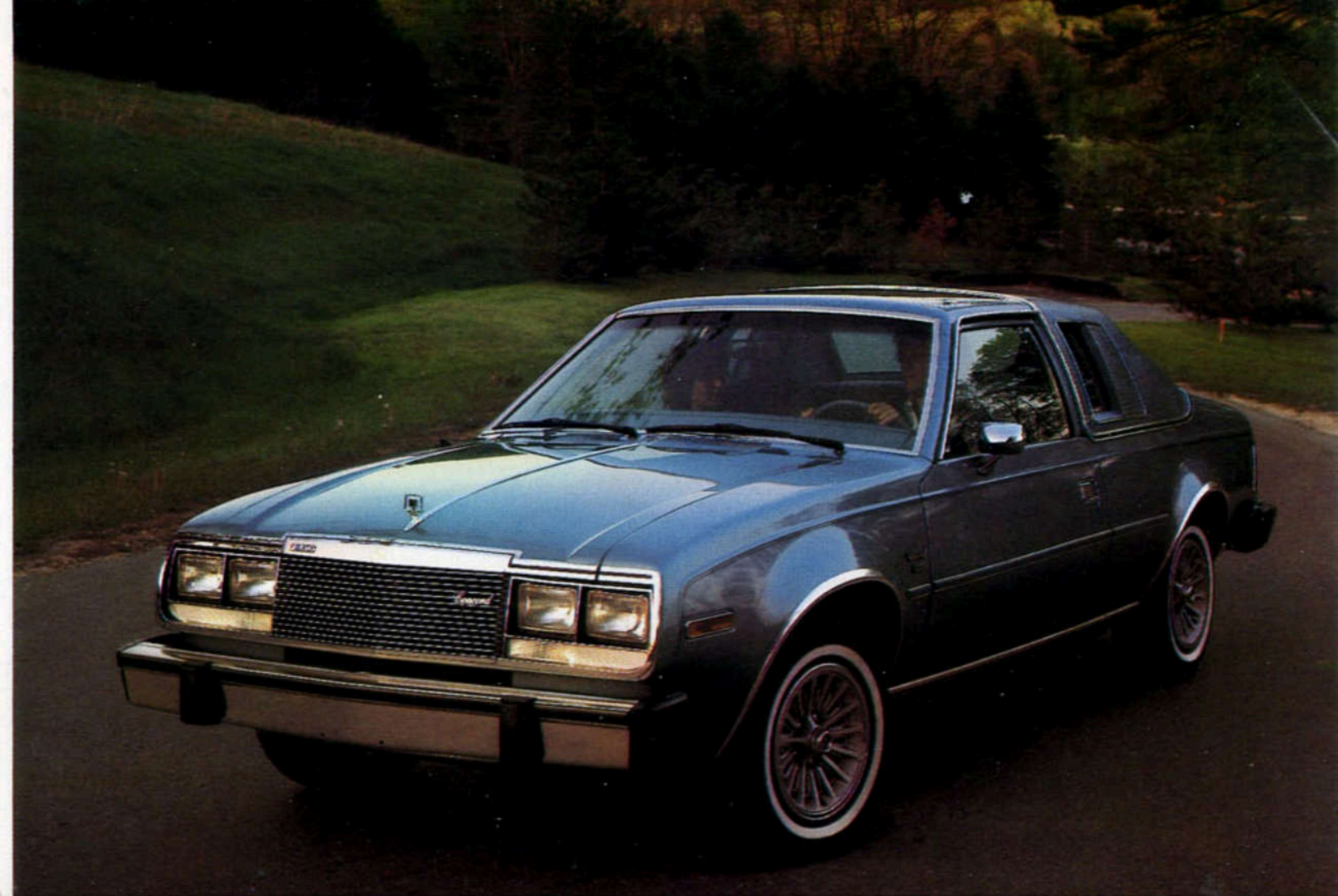
CONCORD DL 2-DOOR SEDAN