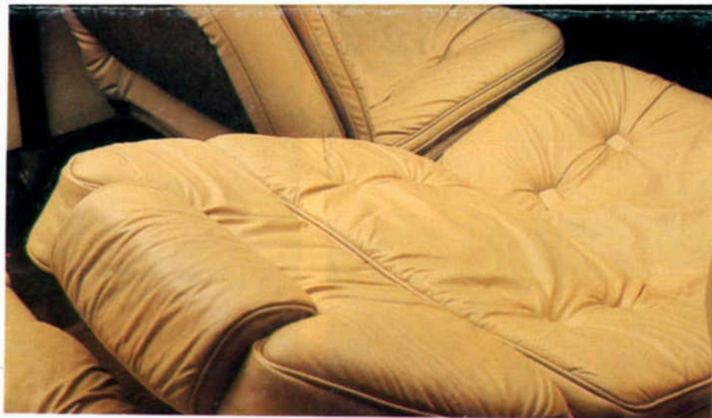
CONCORD LIMITED RECLINING SEAT — CHELSEA LEATHER