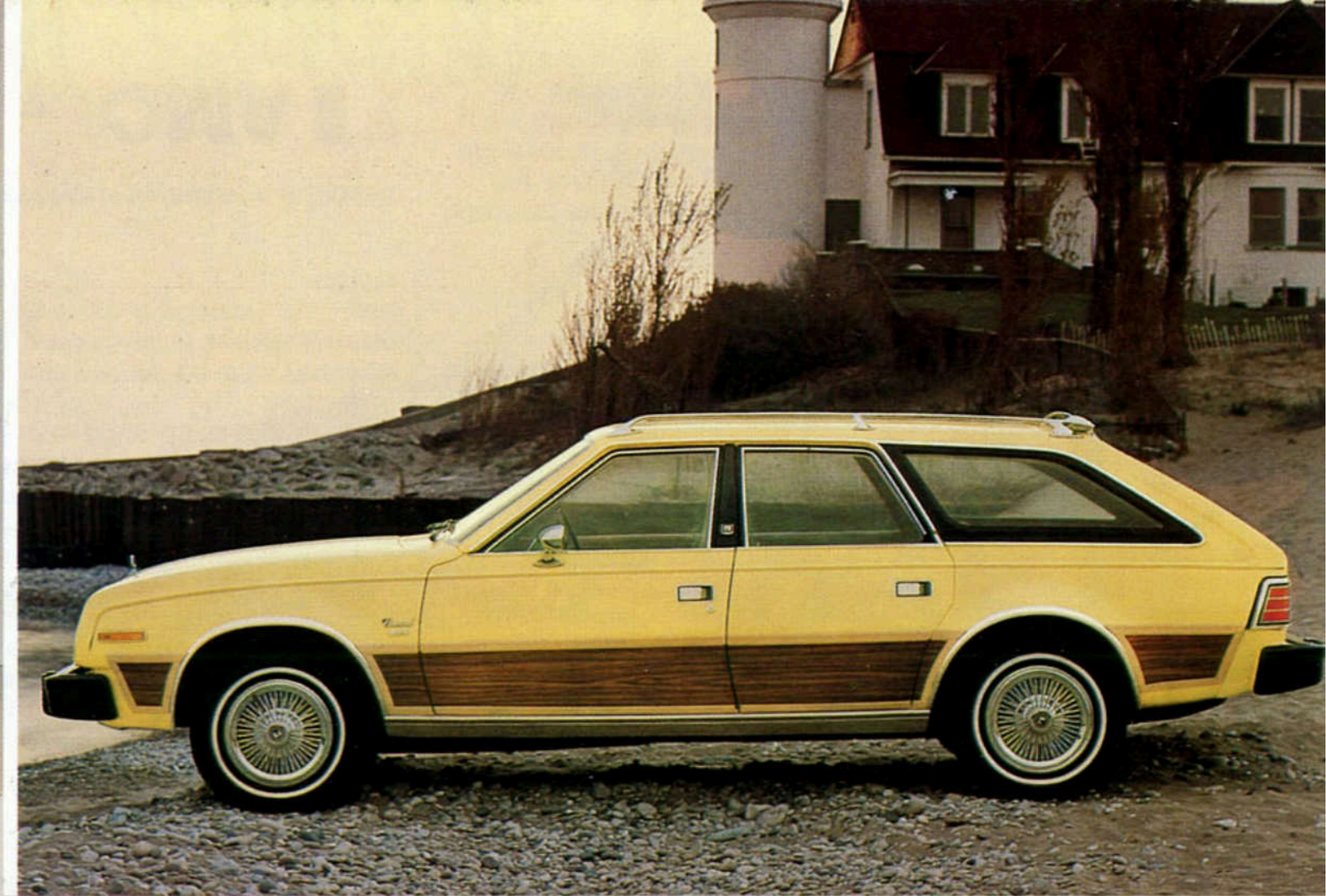
CONCORD LIMITED WAGON