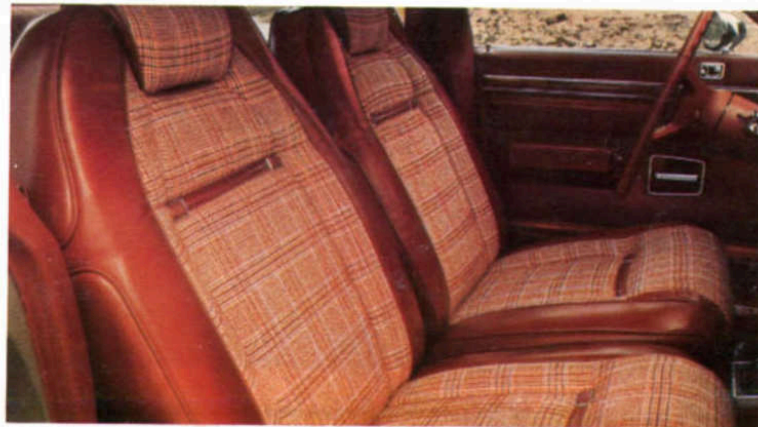
EAGLE RECLINING SEAT — DURHAM PLAID FABRIC