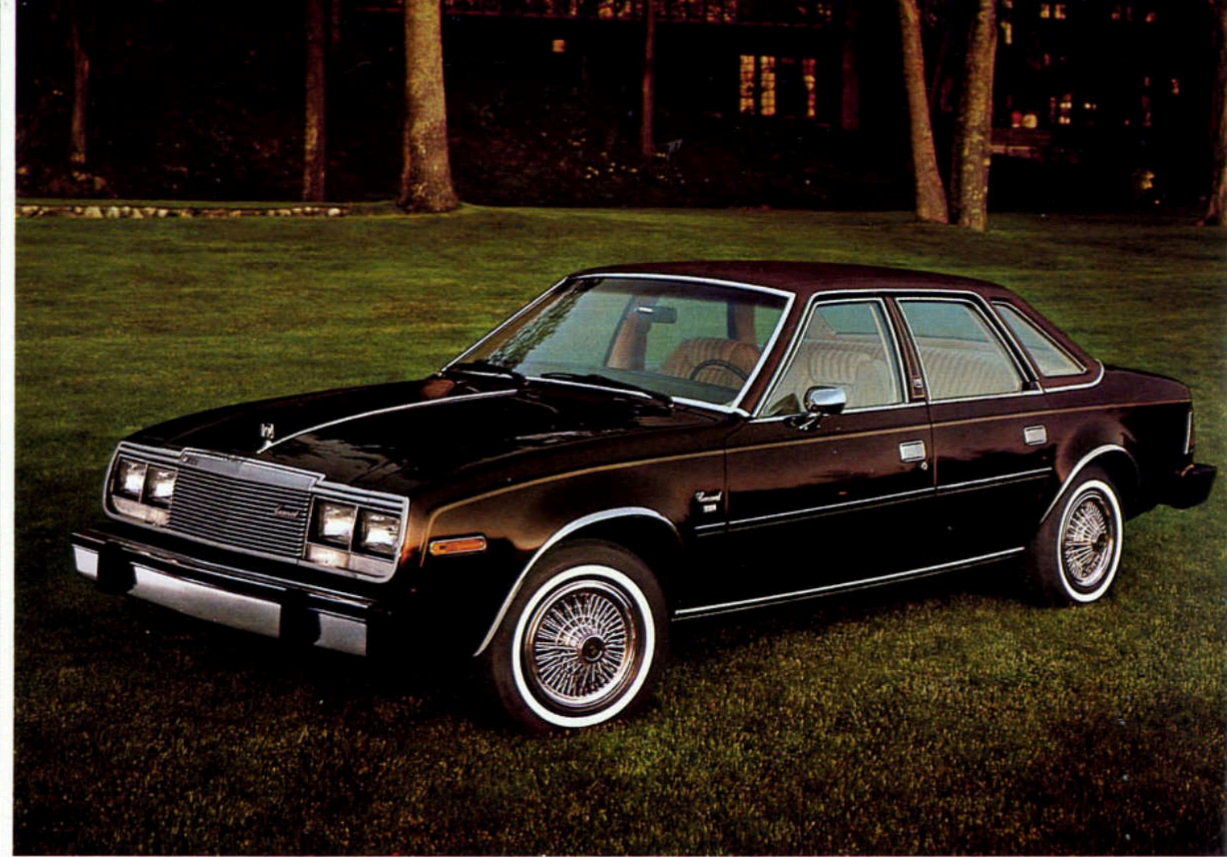
CONCORD LIMITED 4-DOOR SEDAN