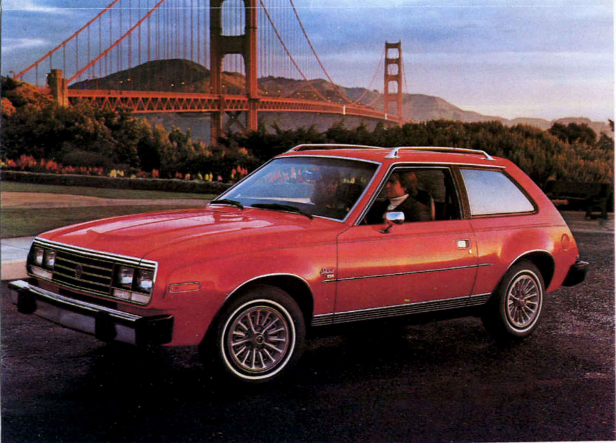
SPIRIT DL SEDAN