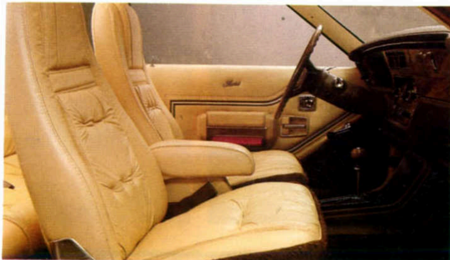
SPIRIT LIMITED HIGH-BACK BUCKET — CHELSEA LEATHER