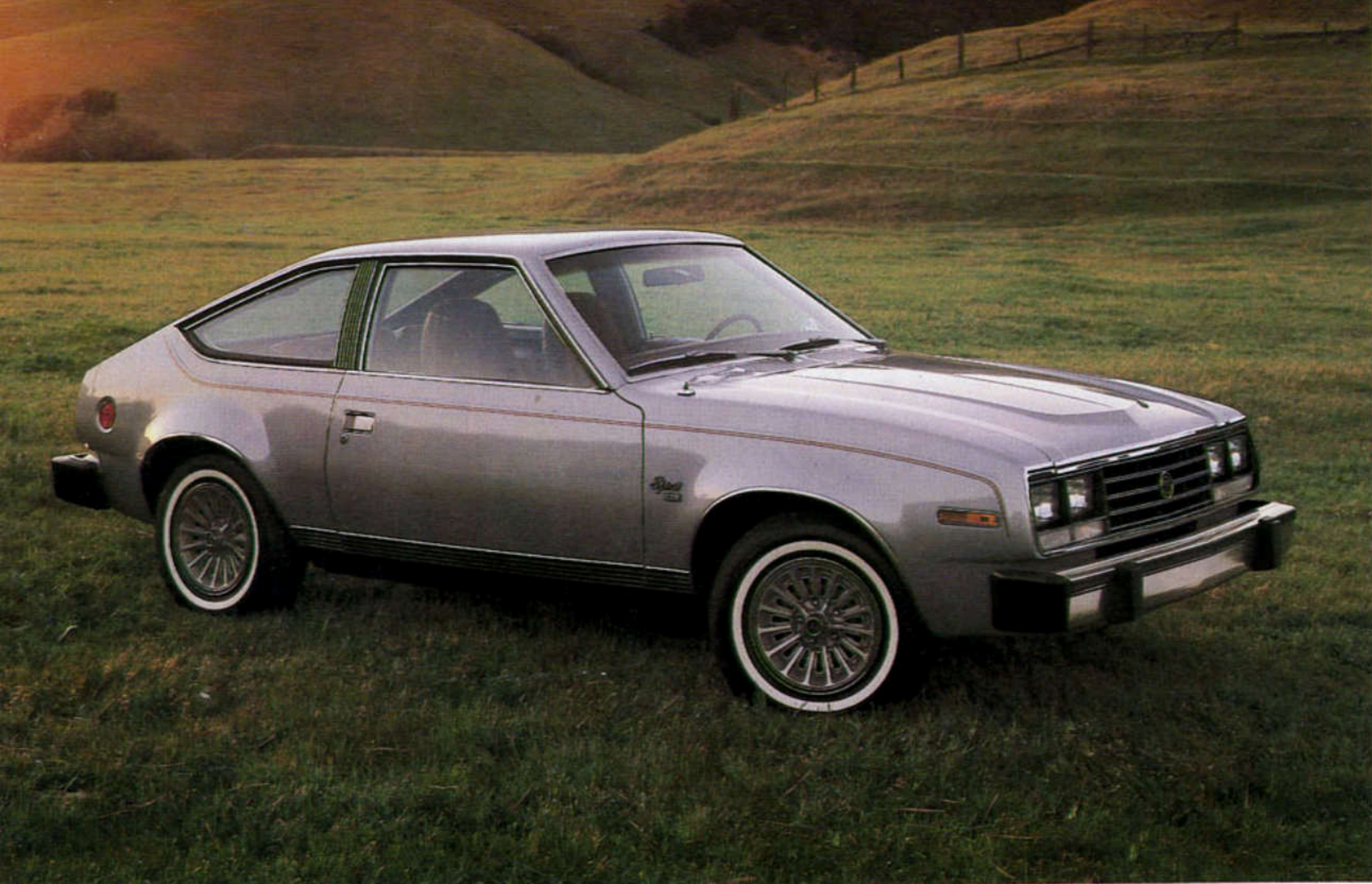
SPRIT DL LIFTBACK