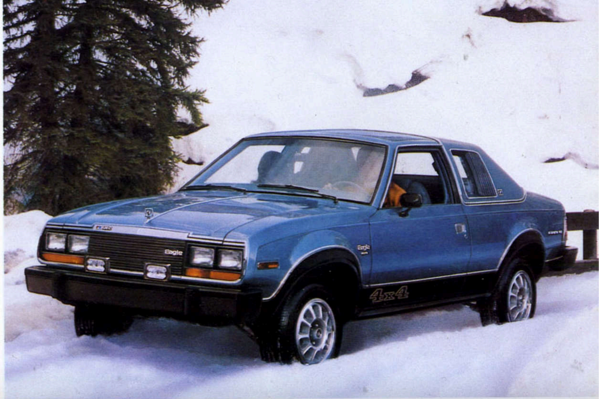
EAGLE 2-DOOR SPORT SEDAN (4-WHEEL-DRIVE AUTOMOBILE)