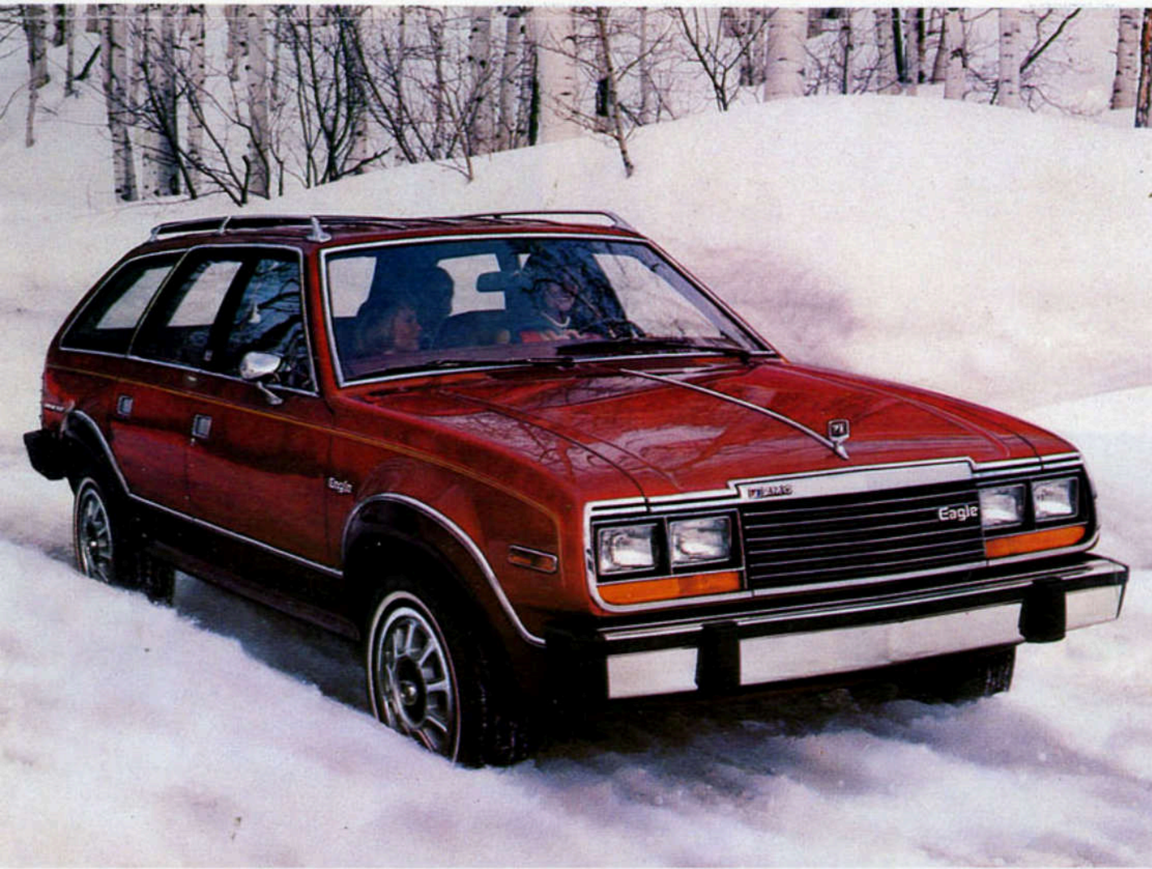
EAGLE WAGON (4-WHEEL-DRIVE AUTOMOBILE)