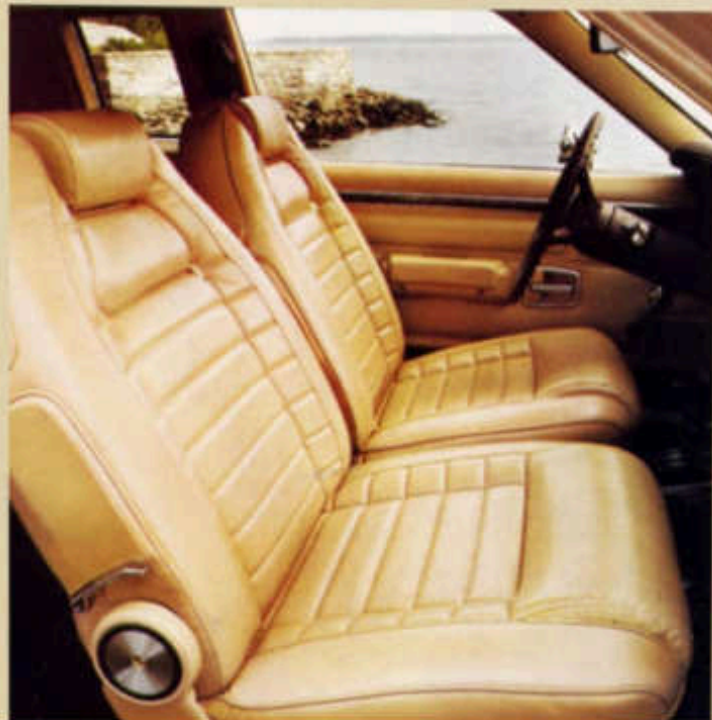
Above: Eagle 2-Door Sedan. Also shown: Standard woodgrain instrument panel (several options shown); Sport vinyl interior; optional fog lamps and AM/FM/CB stereo radio. Opposite: Eagle 2-Door Sedan with Sport Package.

The American Eagle is available in three body styles — the 4-Door Wagon, a 2-Door Sedan, and a 4-Door Sedan — in both standard and luxurious Limited models. Each has its differences, but all have at least four things in common: Handsome exterior styling. Spacious, comfortable interiors. Automatic four-wheel drive and the backing of the AMC Buyer Protection Plan.®