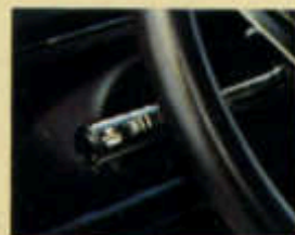
Above: Eagle 4-Door Sedan. Also shown: Optional Durham Plaid fabric seating, cruise control, power windows and power door locks. Opposite: Eagle 4-Dr. Sedan.