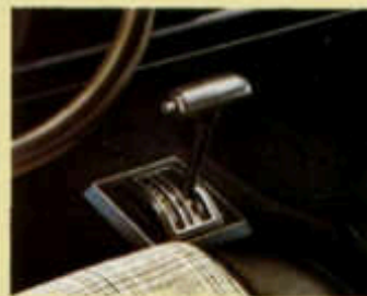
Above: Eagle Wagon. Also shown: Optional Durham Plaid fabric seats and leather- wrapped sport steering wheel; standard 3-speed automatic transmission with T-handle floor shift. Opposite: Eagle Wagon with Sport Package.