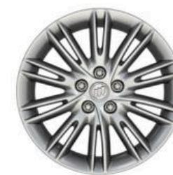
RQH 18" 10-SPOKE ALUMINUM