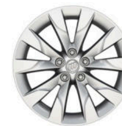
PZW 18" 10-SPOKE POLISHED ALUMINUM