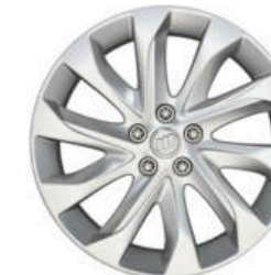
RT7 19" 10-SPOKE ALUMINUM WITH PREMIUM MANOJIAN FINISH