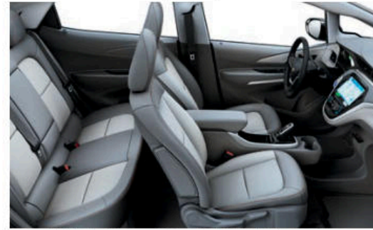
Ceramic White Leather Appointments with Light Ash Accents 5