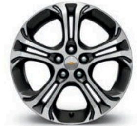
17" Ultra Bright Machined-Aluminum with Painted Pockets (Standard on Premier)