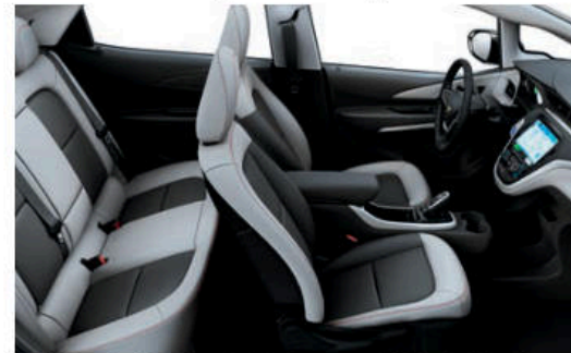
Dark Galvanized Gray Leather Appointments with Sky Cool Gray Accents 5