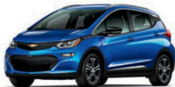
KINETIC BLUE METALLIC 3 (With Black Grille)