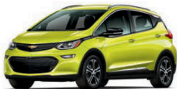
SHOCK 3 (With Black Grille)