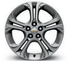
17" Painted-Aluminum (Standard on LT)