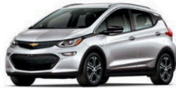
SILVER ICE METALLIC 1,2 (With Black Grille)