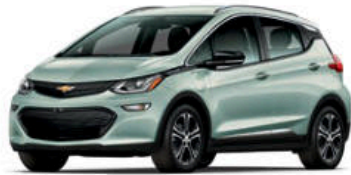
GREEN MIST METALLIC 2 (With Black Grille)