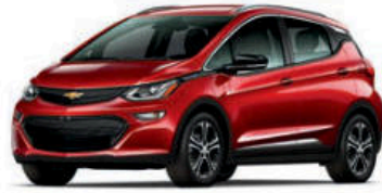
CAJUN RED TINTCOAT 3 (With Black Grille)