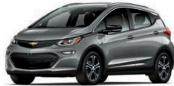
SLATE GRAY METALLIC (With Black Grille)