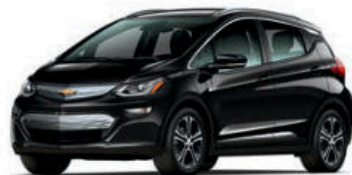
MOSAIC BLACK METALLIC (With Dark Silver Grille)