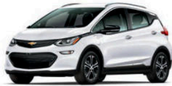
SUMMIT WHITE (With Black Grille)