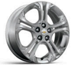
17" Painted-Aluminum Standard on LT