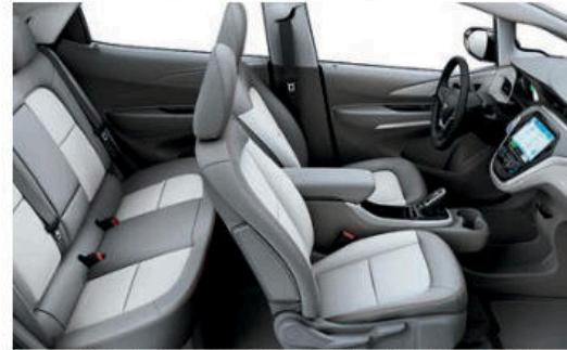
Ceramic White Perforated Leather Appointments with Light Ash Gray Accents 5