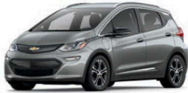
Slate Gray Metallic