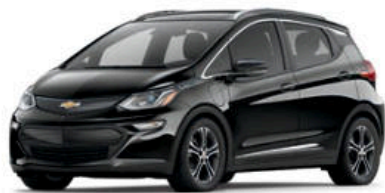
Mosaic Black Metallic