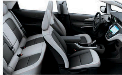
Dark Galvanized Gray Perforated Leather Appointments with Sky Cool Gray Accents 5