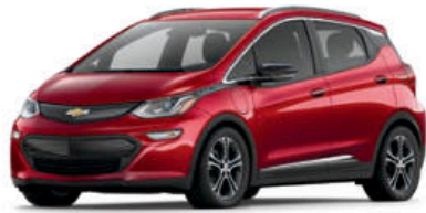
Cajun Red Tintcoat 3