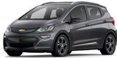
Nightfall Gray Metallic