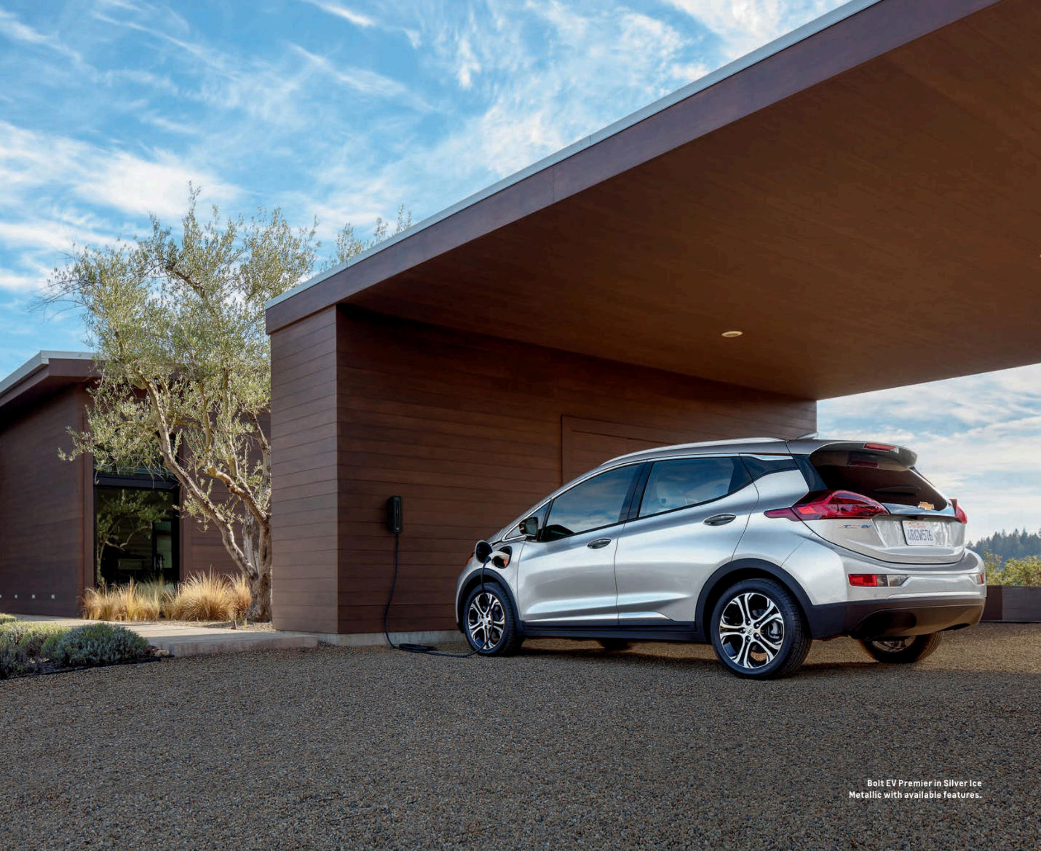
Bolt EV Premier in Silver Ice Metallic with available features.