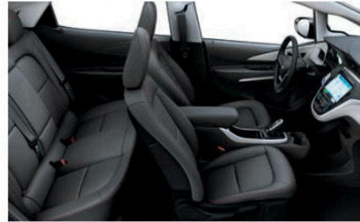
Dark Galvanized Gray Perforated Leather Appointments 5