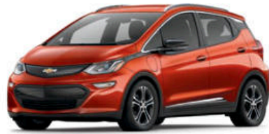
Cayenne Orange Metallic 3