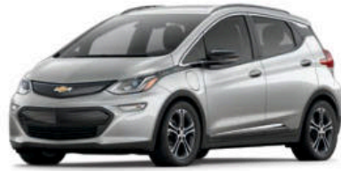
Silver Ice Metallic 1,2