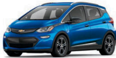
Kinetic Blue Metallic 3