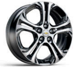
17" Ultra Bright Machined-Aluminum with Painted Pockets Standard on Premier