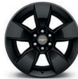
18" Black-Painted Cast-Aluminum (Available with Shoreline Special Edition)