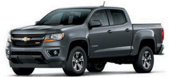
CYBER GRAY METALLIC 1