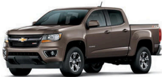
BROWNSTONE METALLIC 1