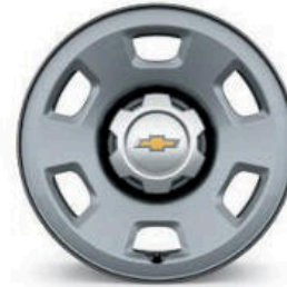
16" Ultra Silver Metallic Painted-Steel (Standard on Base and WT)