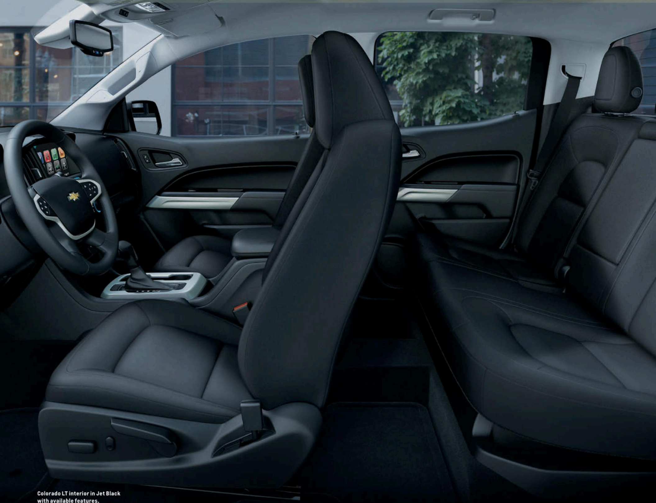
Colorado LT interior in Jet Black with available features.