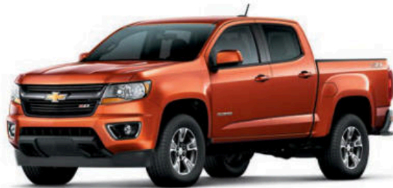
BURNING HOT METALLIC 2