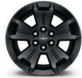
17" Black-Painted Cast-Aluminum (Available with Z71 Midnight Special Edition)