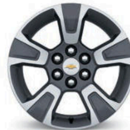
17" Dark Argent Metallic-Painted Cast-Aluminum (Standard on Z71)