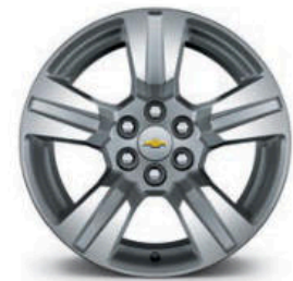
18" Dark Argent Metallic-Painted Cast-Aluminum (Available on LT)