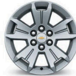
17" Blade Silver Metallic-Painted Cast-Aluminum (Standard on LT; available on WT with Duramax 2.8L Turbo-Diesel engine)