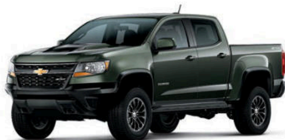
DEEPWOOD GREEN METALLIC 5