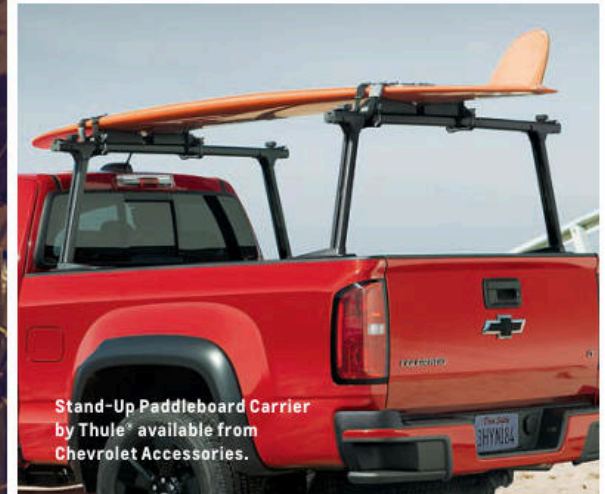
Stand-Up Paddleboard Carrier by Thule ® available from Chevrolet Accessories.