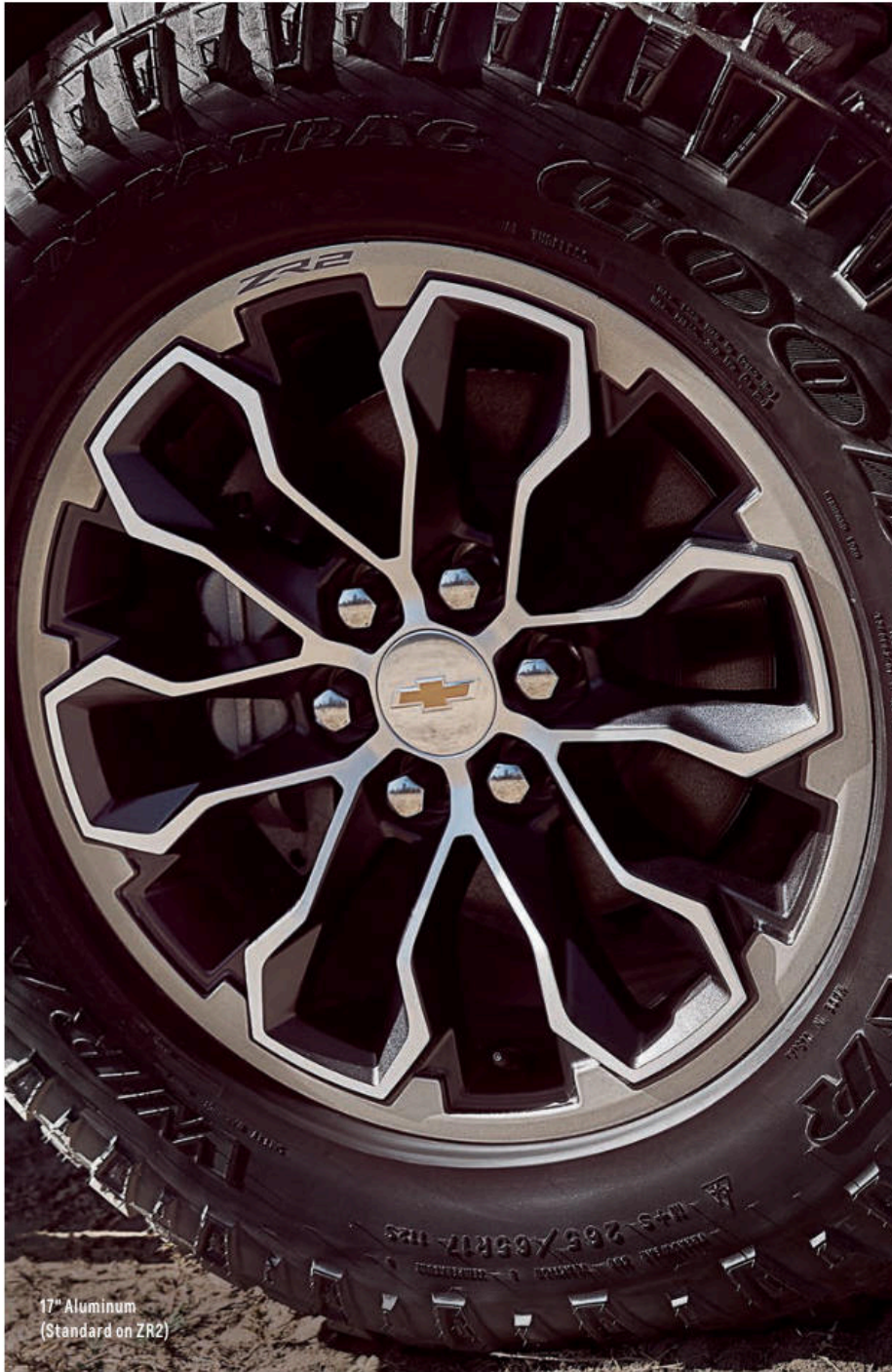
17" Aluminum (Standard on ZR2)