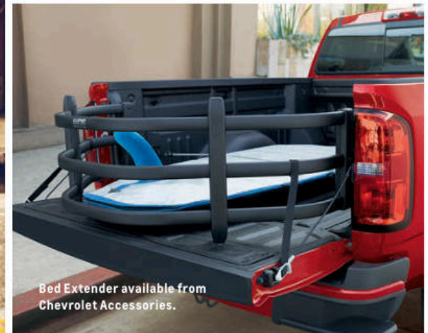
Bed Extender available from Chevrolet Accessories.

1 If you decide to continue service after your trial, the subscription plan you choose will automatically renew thereafter and you will be charged according to your chosen payment method at then-current rates. Fees and taxes apply. To cancel you must call SiriusXM at 1-866-635-2349. See SiriusXM Customer Agreement for complete terms at siriusxm.com . All fees and programming subject to change. 2 Late availability for Shoreline Special Edition.