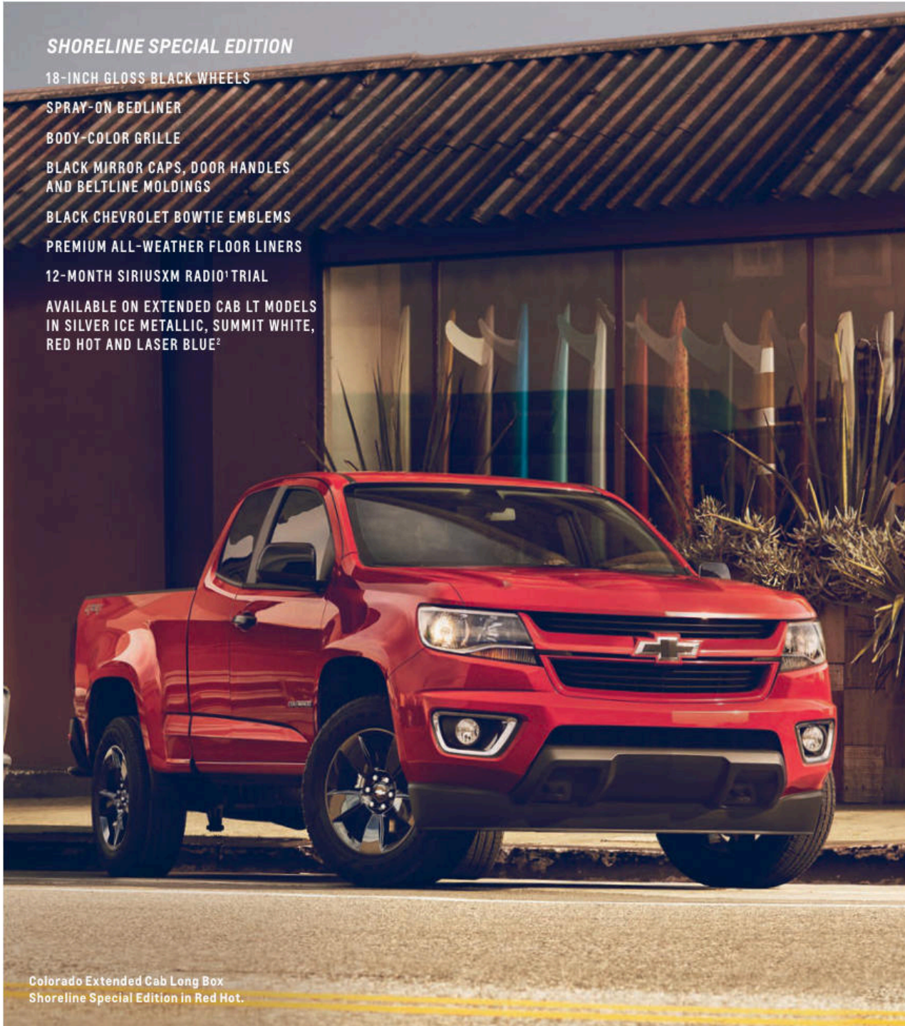
Colorado Extended Cab Long Box Shoreline Special Edition in Red Hot.

AVAILABLE ON EXTENDED CAB LT MODELS IN SILVER ICE METALLIC, SUMMIT WHITE, RED HOT AND LASER BLUE 2