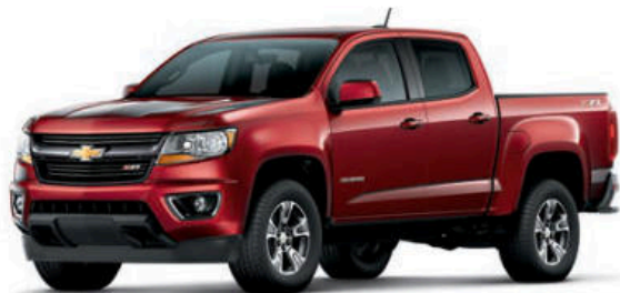
CAJUN RED TINTCOAT 1,2,4