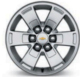
16" Ultra Silver Metallic-Painted Cast-Aluminum (Available with WT Appearance Package)