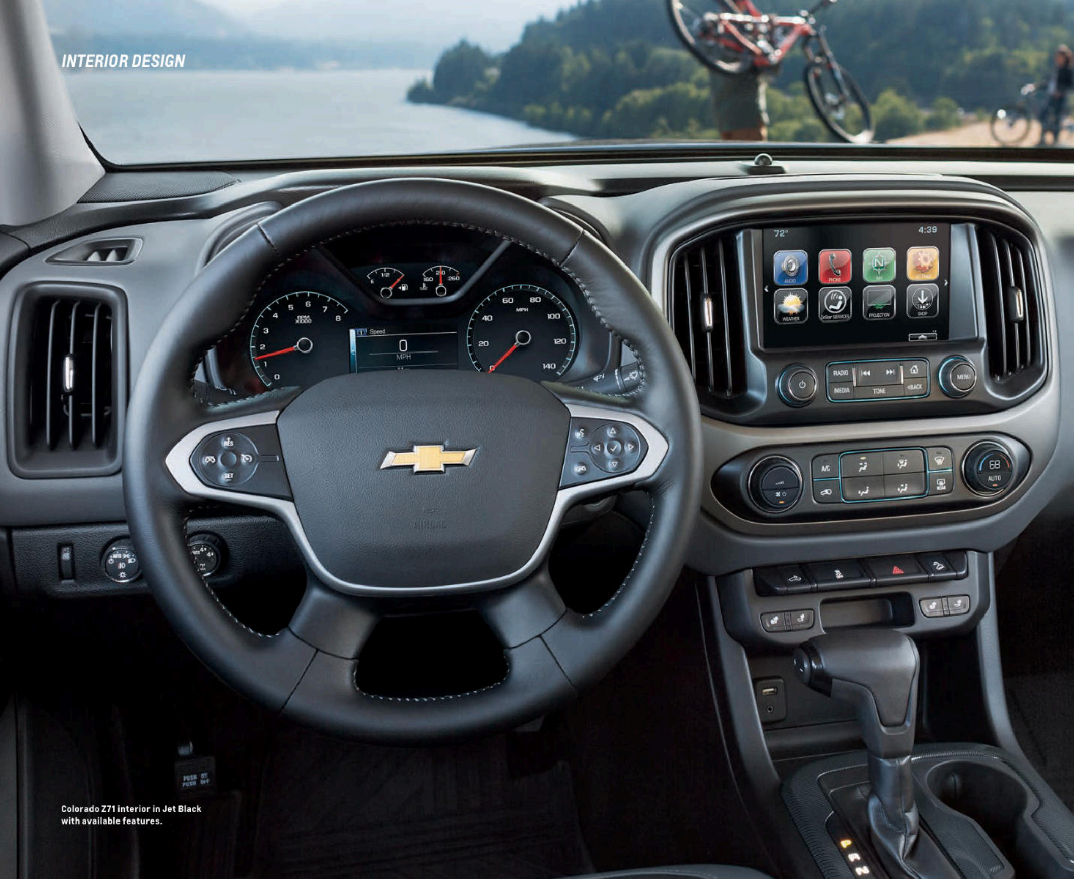
Colorado Z71 interior in Jet Black with available features.