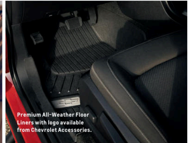
Premium All-Weather Floor Liners with logo available from Chevrolet Accessories.