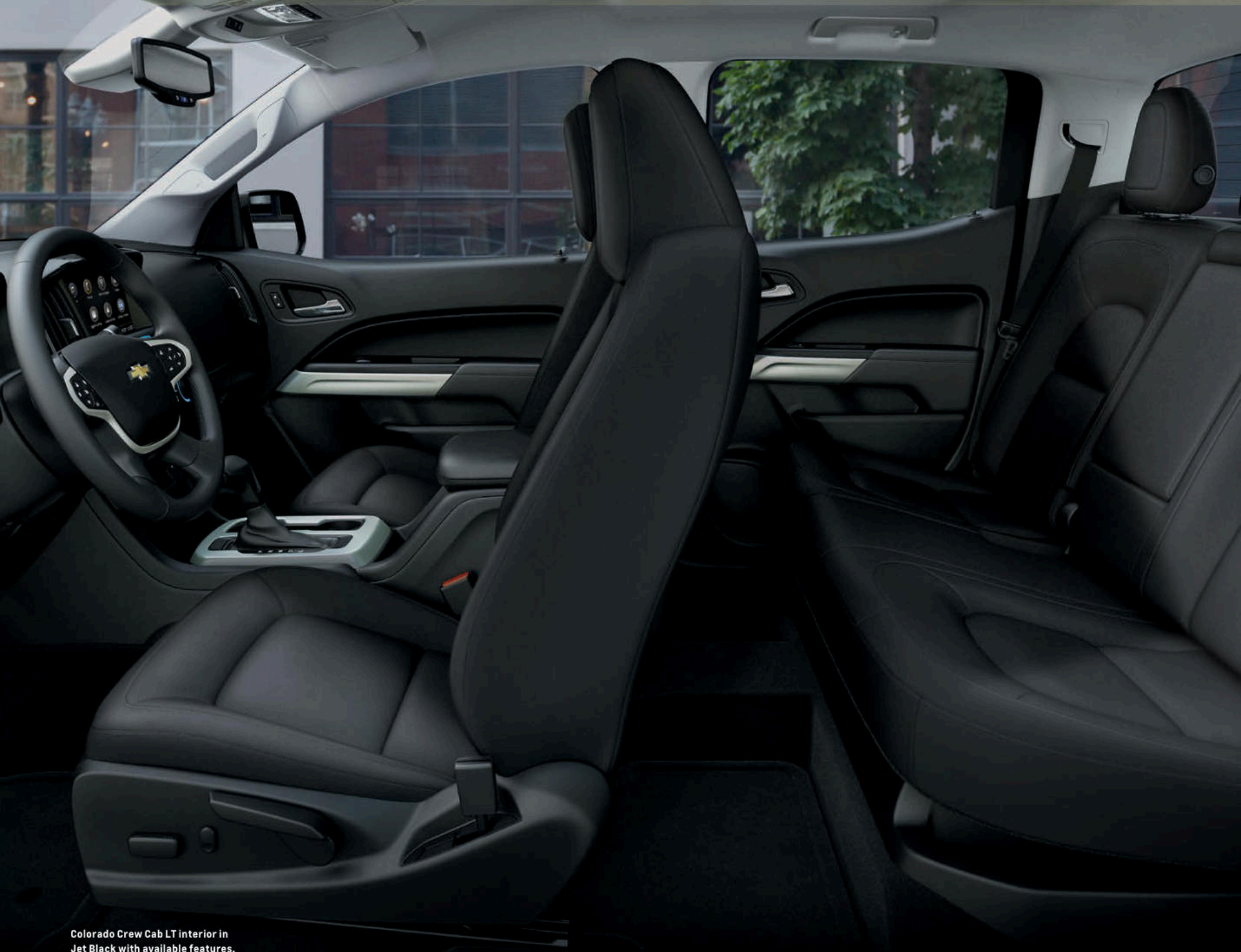
Colorado Crew Cab LT interior in Jet Black with available features.