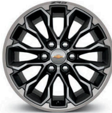
17" Aluminum (Standard on ZR2)