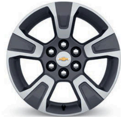
17" Dark Argent Metallic-Painted Cast-Aluminum (Standard on Z71)