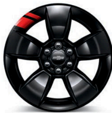
18" Black-Painted Cast-Aluminum with Red Accents (Available with Redline Edition)