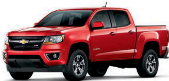
RED HOT 1