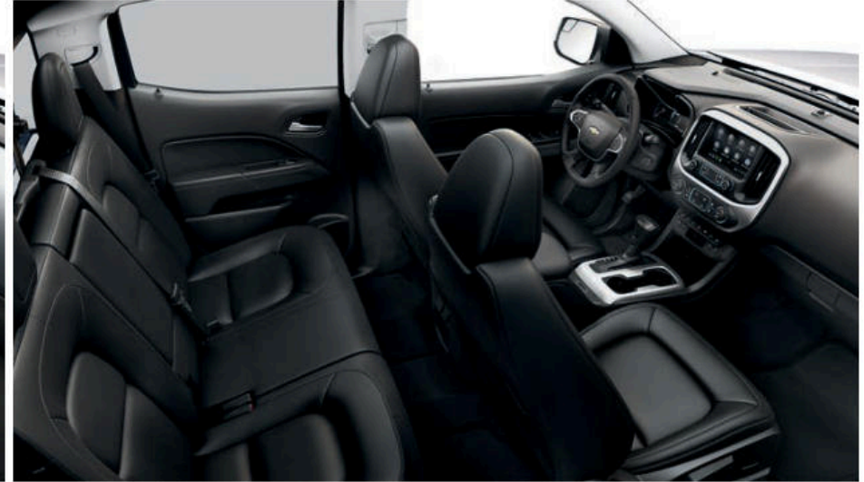
ZR2-Specific Jet Black Leather Appointments with Jet Black Accents