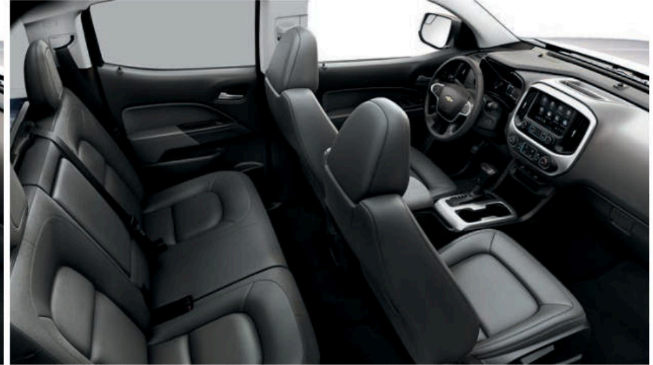
Dark Ash Leather Appointments with Jet Black Accents 4