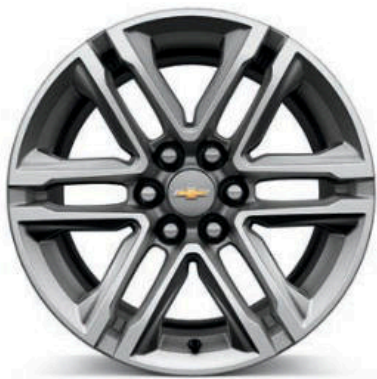
18" Dark Argent Metallic-Painted Cast-Aluminum (Available on WT 1 and LT)