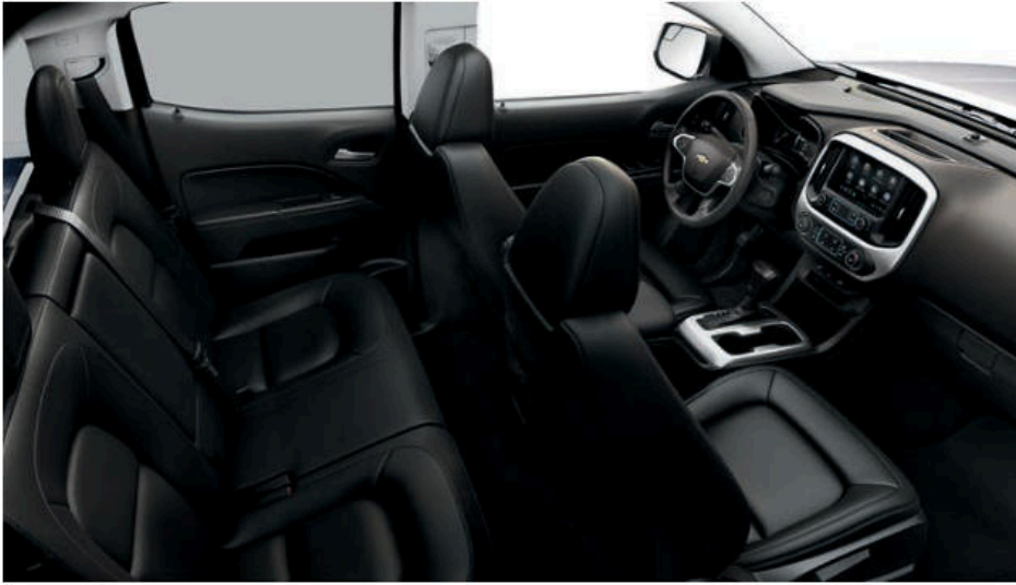
Jet Black Leather Appointments with Jet Black Accents 1