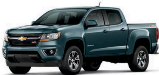
SHADOW GRAY METALLIC