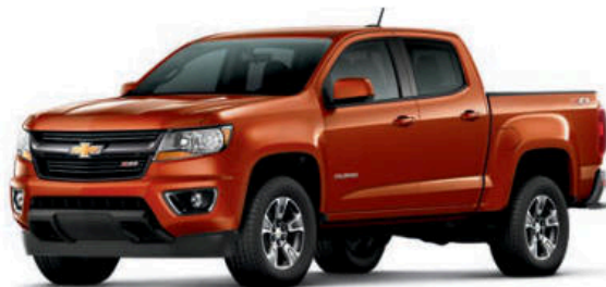
DARK COPPER METALLIC 5