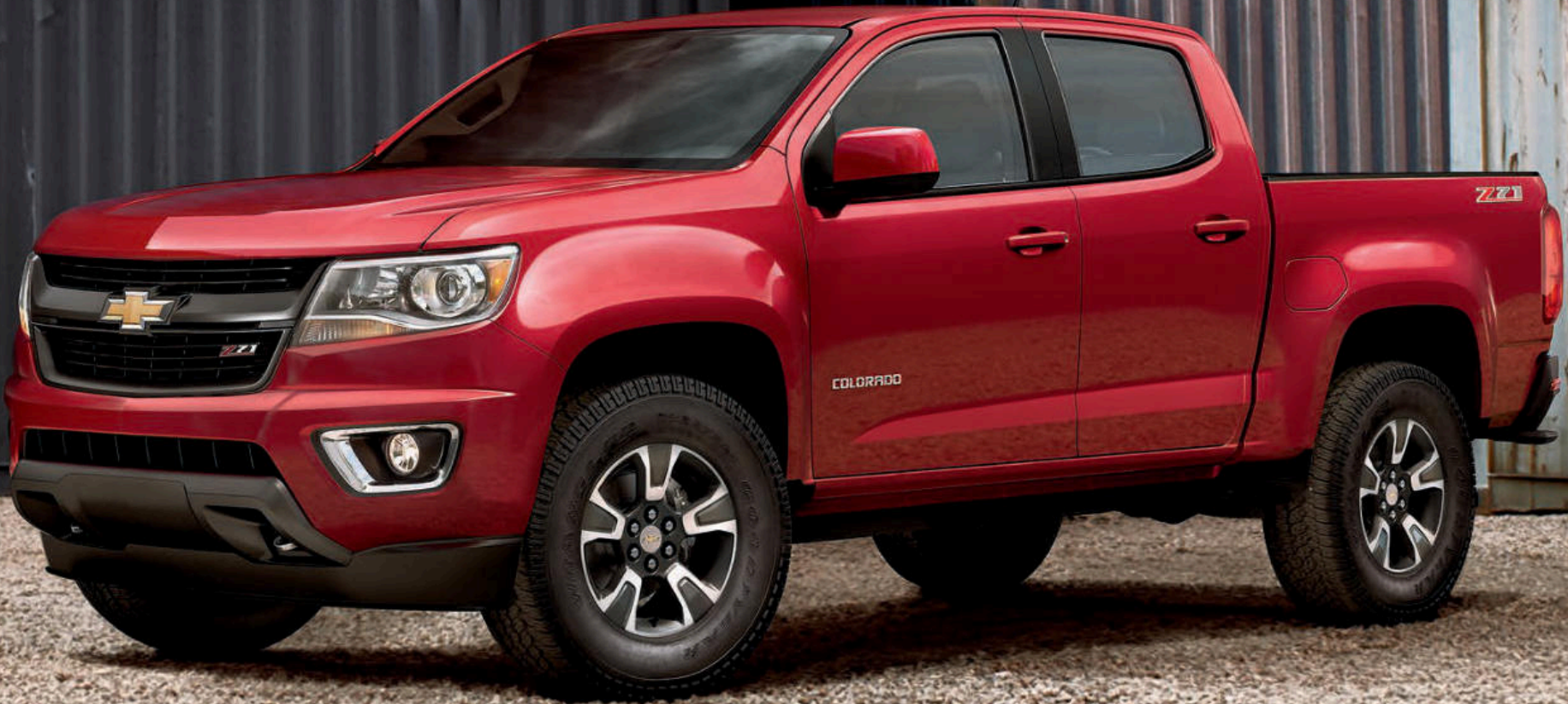
Colorado Crew Cab Short Box Z71 in Red Hot.