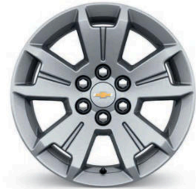
17" Blade Silver Metallic-Painted Cast-Aluminum (Standard on LT and available on WT with Duramax 2.8L Turbo-Diesel engine)