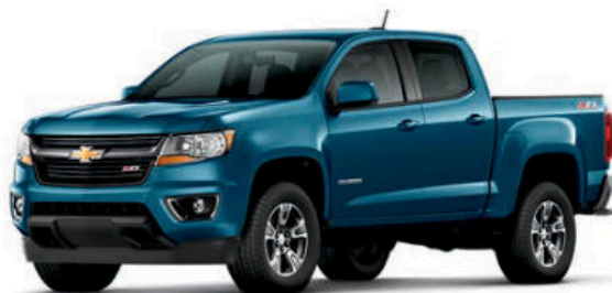
PACIFIC BLUE METALLIC 6