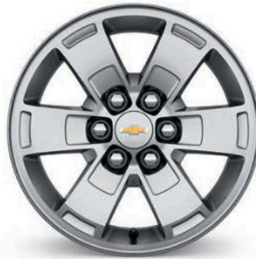
16" Ultra Silver Metallic-Painted Cast-Aluminum (Available with WT Appearance Package)