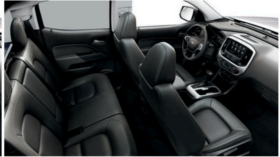
Dark Ash Cloth with Jet Black Accents (LT shown) 2,3