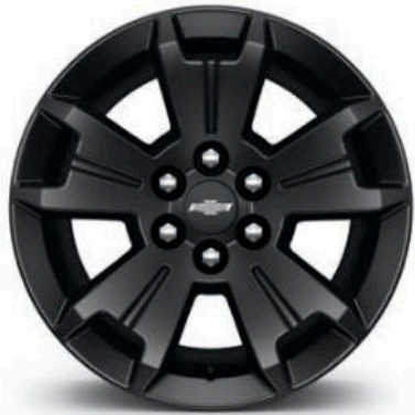
17" Gloss Black-Painted Cast-Aluminum (Available with Z71 Midnight Edition, ZR2 Dusk Special Edition or ZR2 Midnight Special Edition)