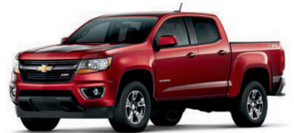
CAJUN RED TINTCOAT 2,3