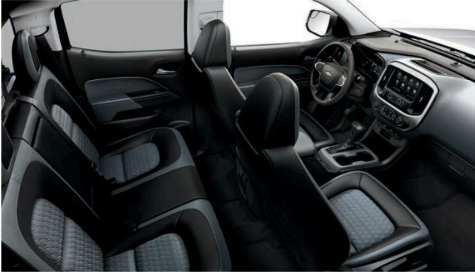
Jet Black/Dark Galvanized Cloth with Leatherette Appointments and Jet Black Accents 3