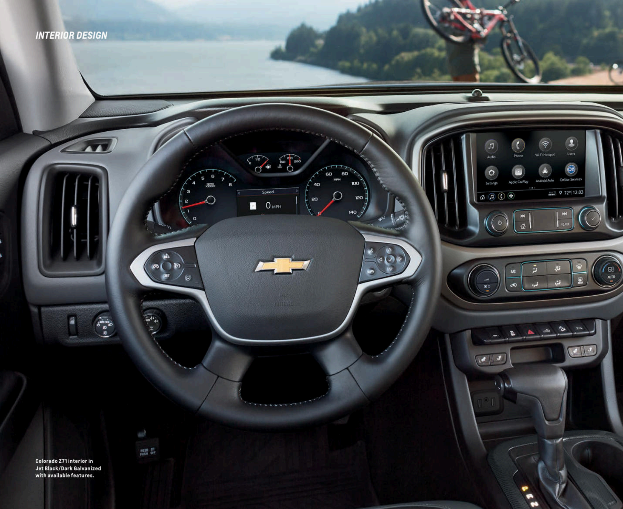
Colorado Z71 interior in Jet Black/Dark Galvanized with available features.