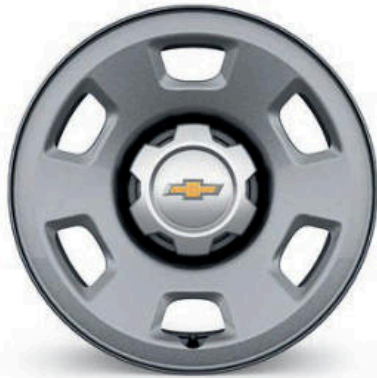
16" Ultra Silver Metallic-Painted Steel (Standard on Base and WT)