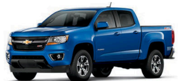
KINETIC BLUE METALLIC 2