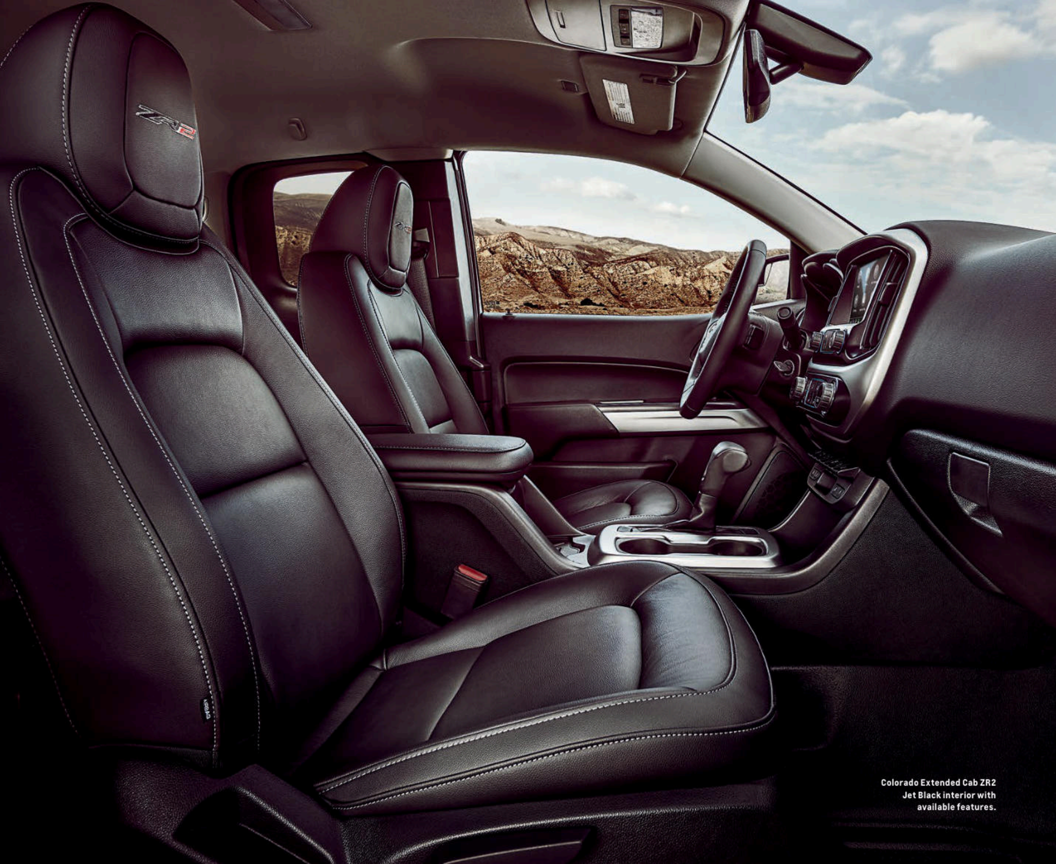
Colorado Extended Cab ZR2 Jet Black interior with available features.