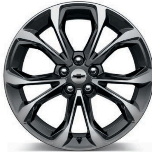
18" Machined-Face Aluminum (Included with RS Package on Diesel Hatchback and Premier)