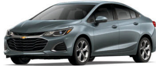
SATIN STEEL GRAY METALLIC 1,3