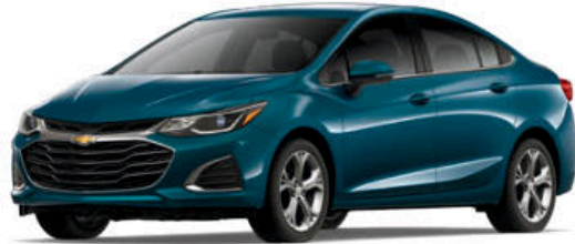
PACIFIC BLUE METALLIC 1,3