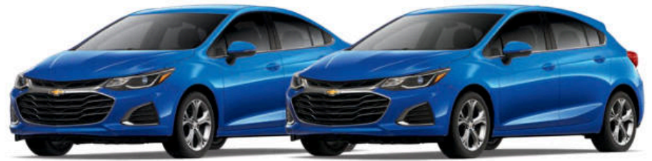
KINETIC BLUE METALLIC 1,2