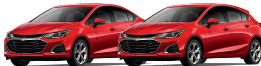
RED HOT 5