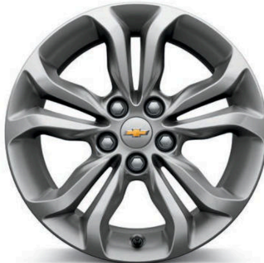
16" Aluminum (Standard on LT and Diesel; included with LS Convenience Package)