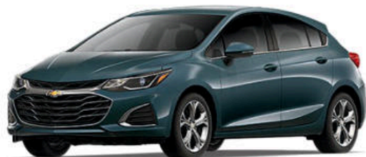
GRAPHITE METALLIC 1,2