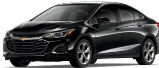
MOSAIC BLACK METALLIC 1,6