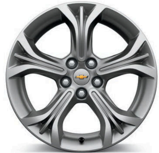
17" Aluminum (Standard on Premier)