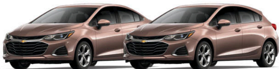
OAKWOOD METALLIC 5