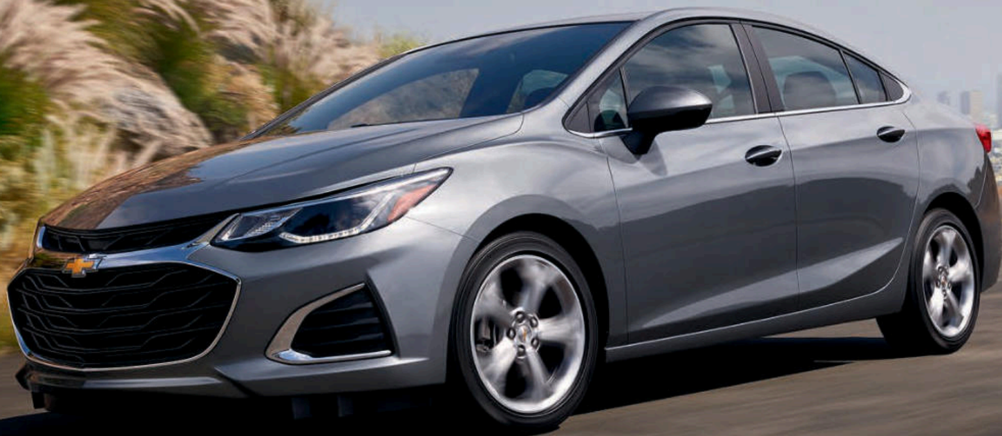
Cruze Premier Sedan in Satin Steel Gray Metallic.