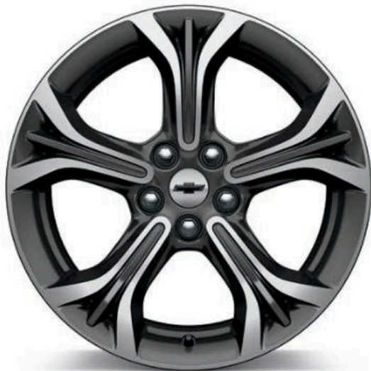
17" Aluminum (Included with RS Package on LT)