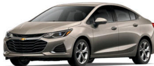
PEPPERDUST METALLIC 3,4