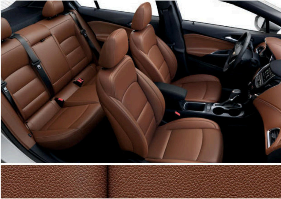
1 Umber Leatherette with Jet Black Accents 1,2