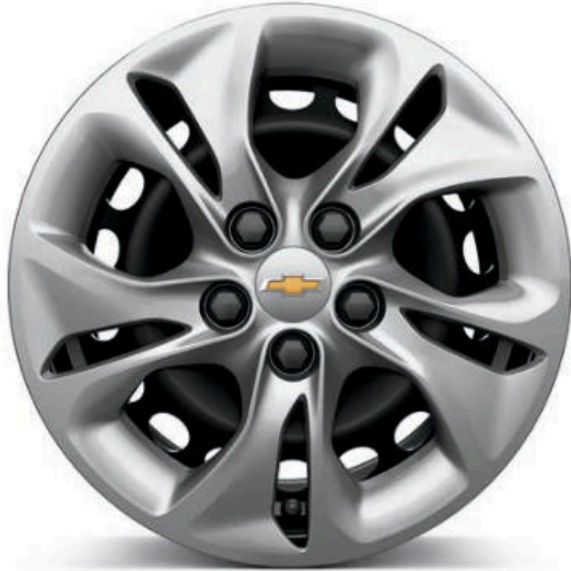
15" Steel with Painted Wheel Cover (Standard on L and LS)