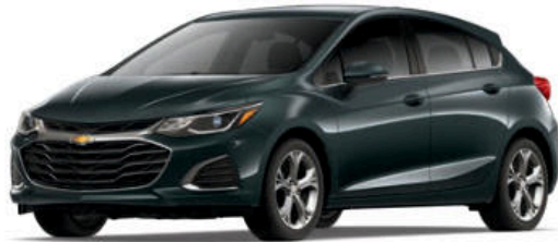
NIGHTFALL GRAY METALLIC 1,5