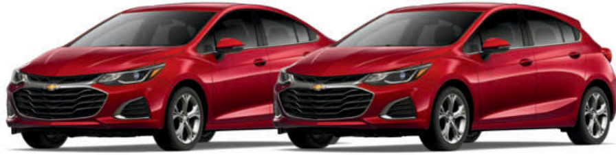
CAJUN RED TINTCOAT 1,2