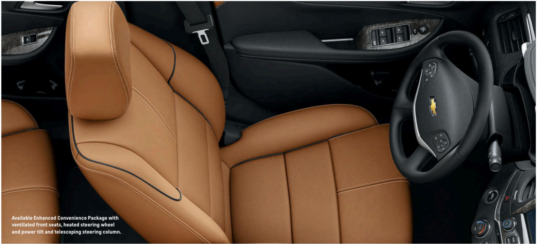
Available Enhanced Convenience Package with ventilated front seats, heated steering wheel and power tilt and telescoping steering column.