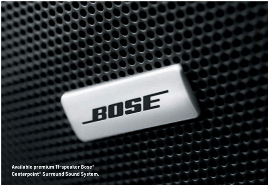
Available premium 11-speaker Bose® Centerpoint® Surround Sound System.