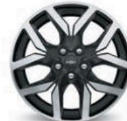
19" Special Midnight Edition with Black-Painted Pockets (Available on LT and LTZ) 6