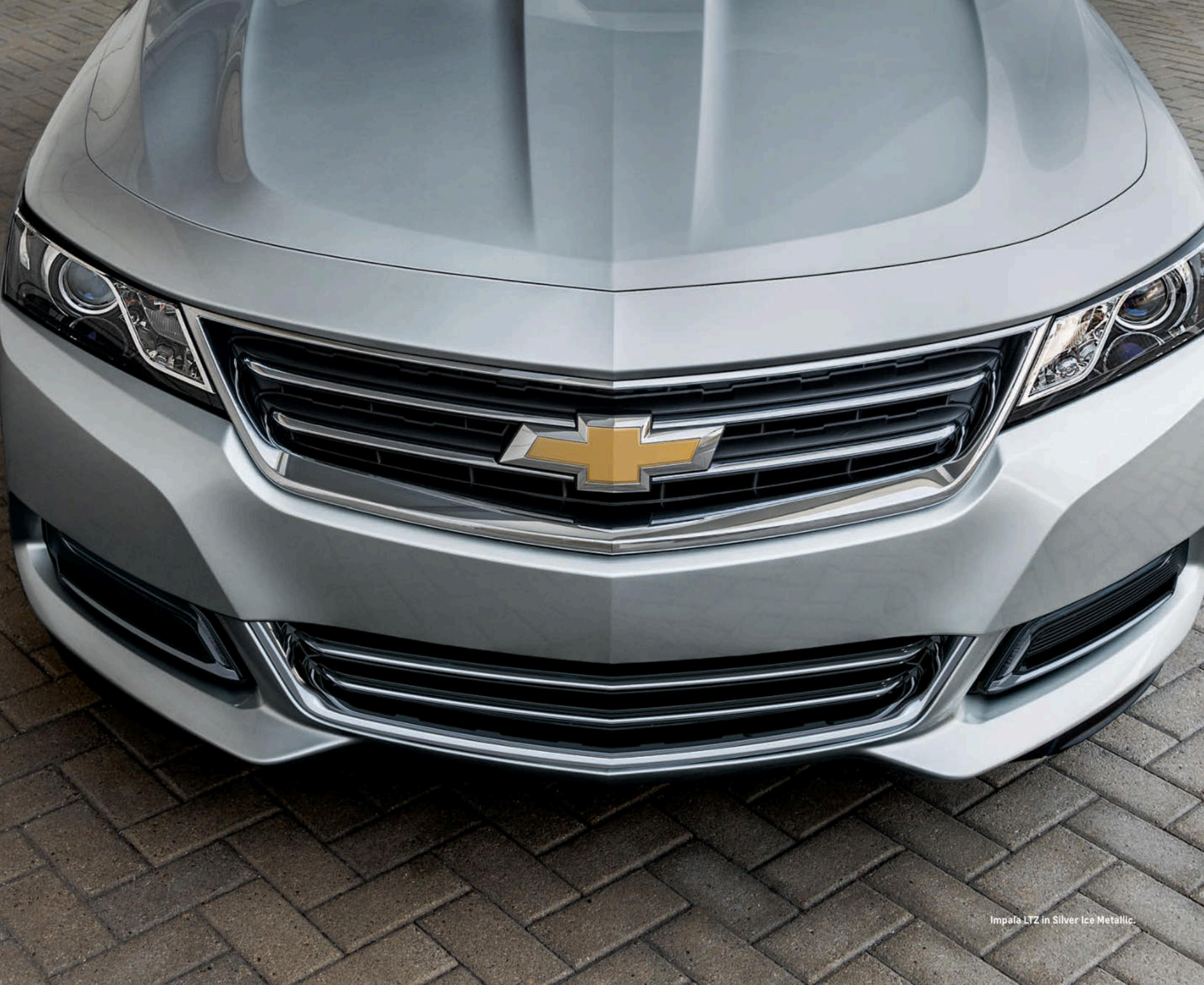
Impala LTZ in Silver Ice Metallic.