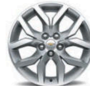
19" Machined-Face Aluminum (Standard on LTZ)