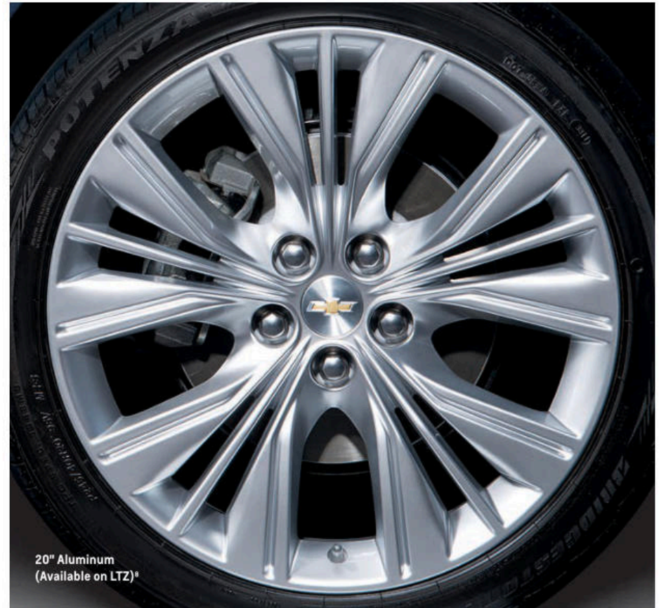
20" Aluminum (Available on LTZ) 8