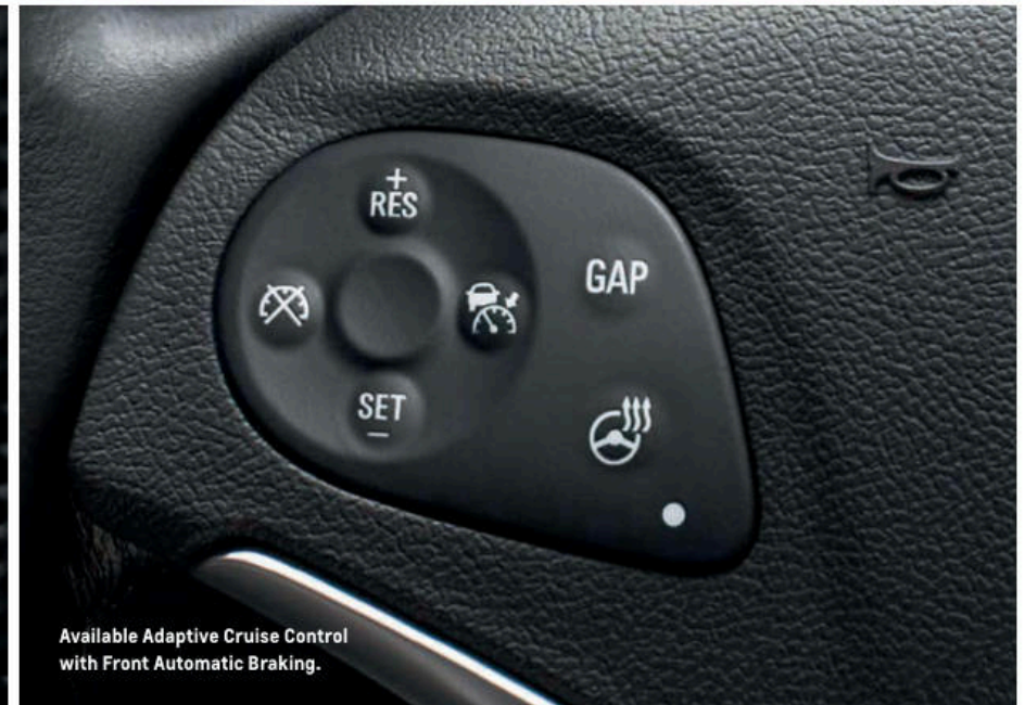
Available Adaptive Cruise Control with Front Automatic Braking.