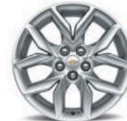
19" Painted-Aluminum (Available on 2LT) 7