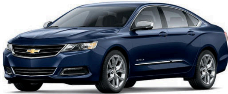
BLUE VELVET METALLIC