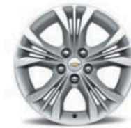
18" Painted-Aluminum (Standard on LT)