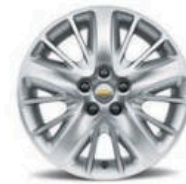
18" Steel with Fascia-Spoke Wheel Cover (Standard on LS)