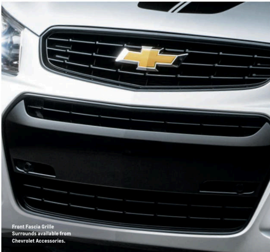
Front Fascia Grille Surrounds available from Chevrolet Accessories.