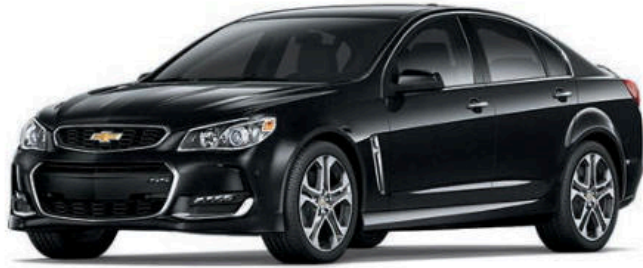
PHANTOM BLACK METALLIC