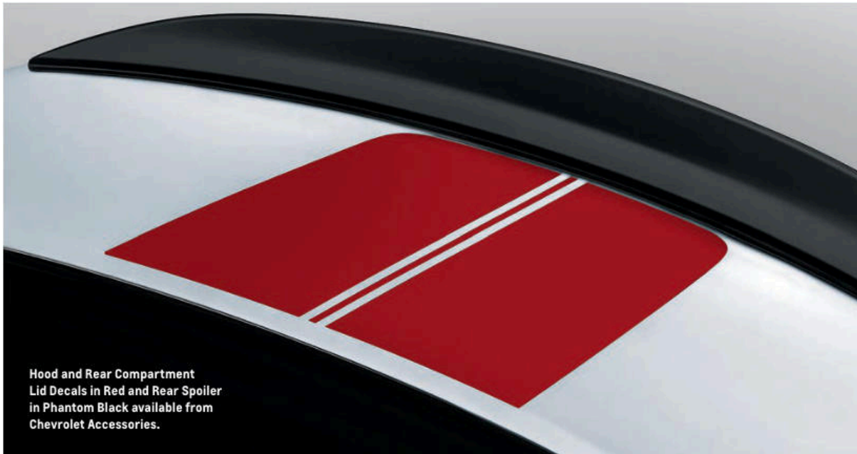
Hood and Rear Compartment Lid Decals in Red and Rear Spoiler in Phantom Black available from Chevrolet Accessories.