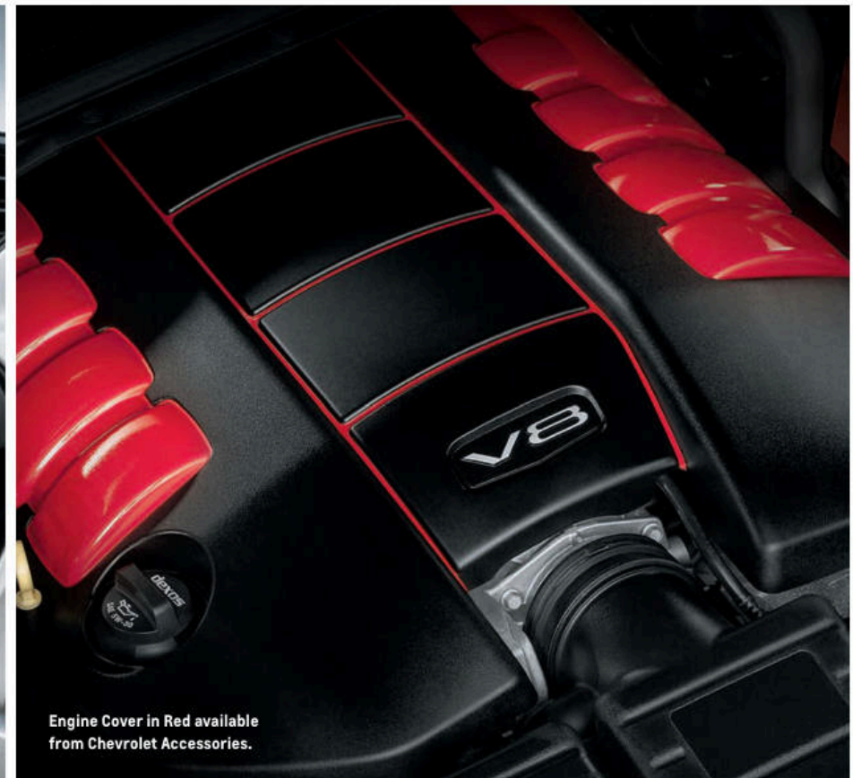
Engine Cover in Red available from Chevrolet Accessories.