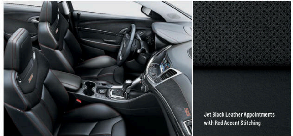
Jet Black Leather Appointments with Red Accent Stitching