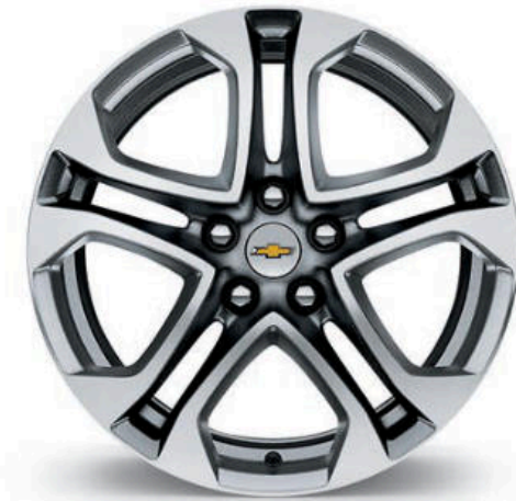
19" Ultra Bright Machined-Face Cast-Aluminum 1 (Standard)