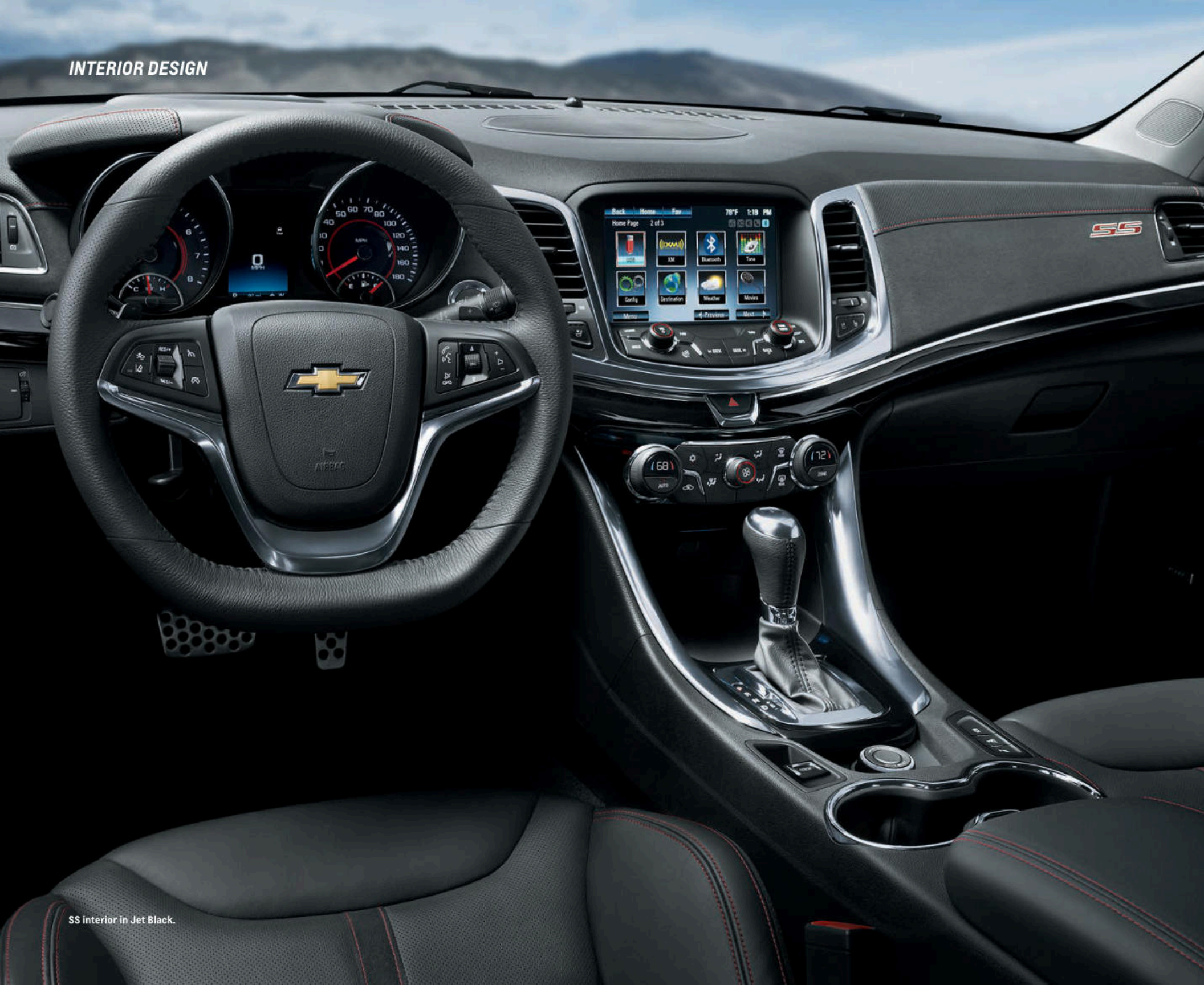
SS interior in Jet Black.