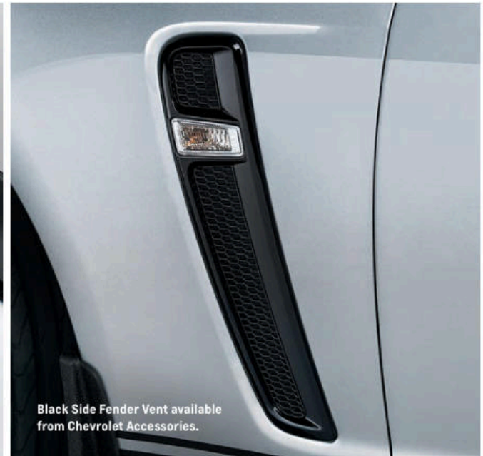
Black Side Fender Vent available from Chevrolet Accessories.