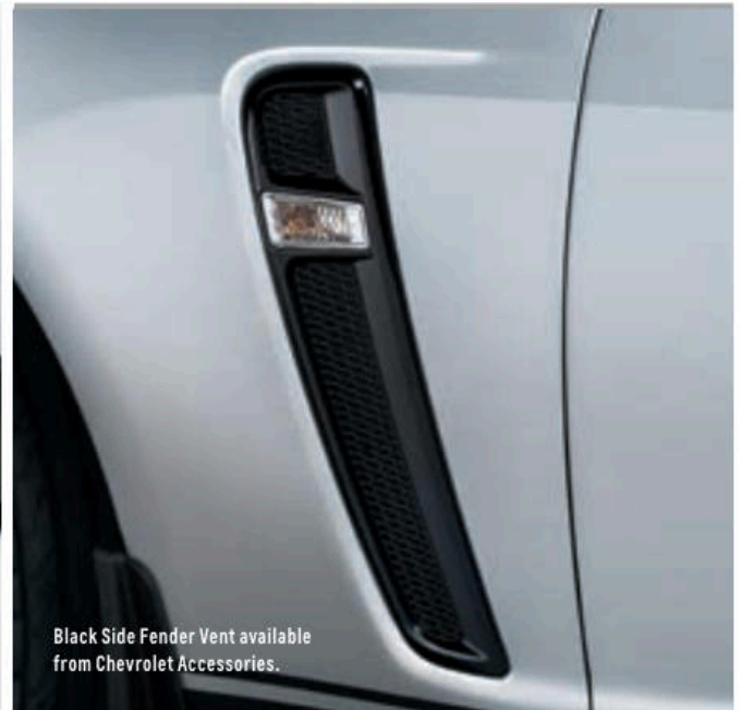
Black Side Fender Vent available from Chevrolet Accessories.