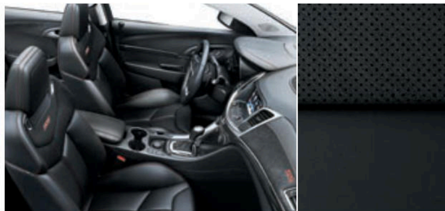
Jet Black Leather Appointments with Red Accent Stitching