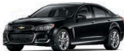
PHANTOM BLACK METALLIC