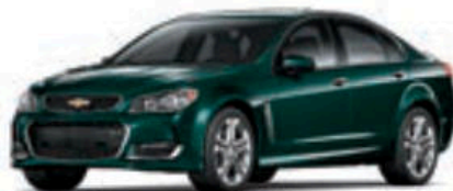
REGAL PEACOCK GREEN METALLIC