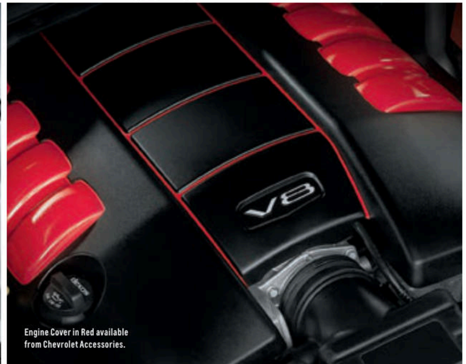
Engine Cover in Red available from Chevrolet Accessories.