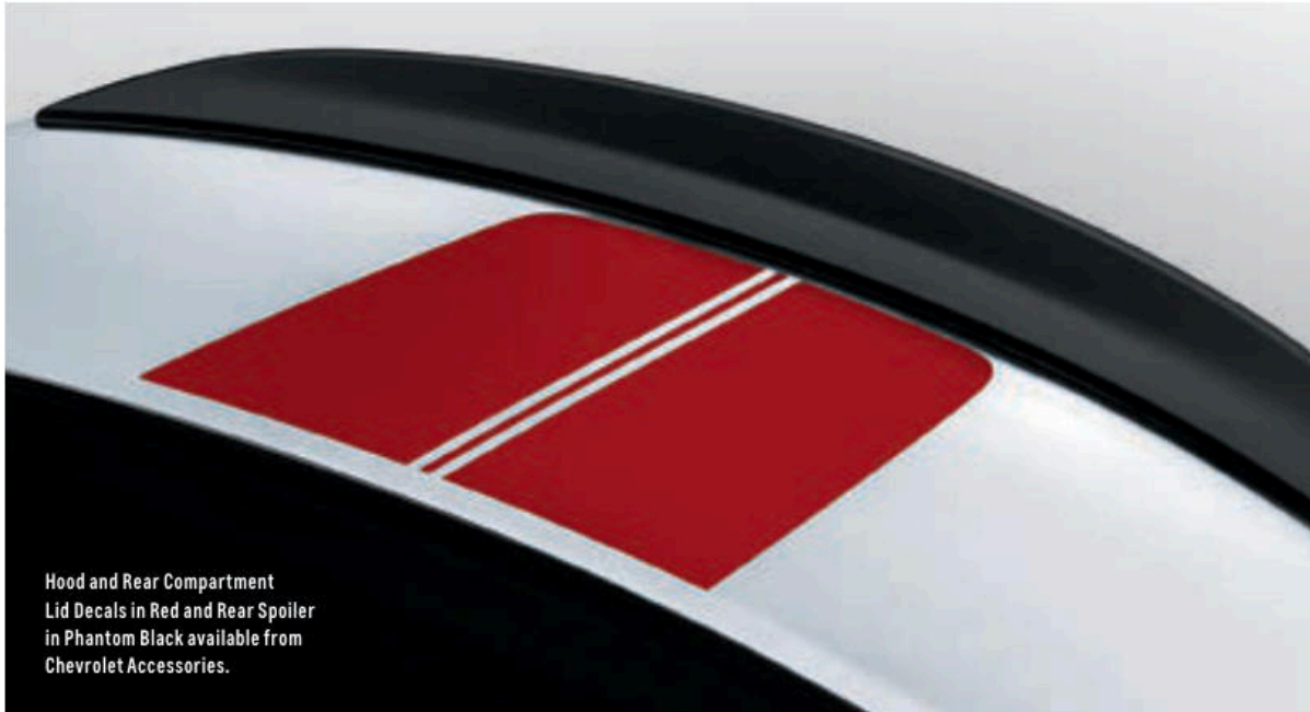
Hood and Rear Compartment Lid Decals in Red and Rear Spoiler in Phantom Black available from Chevrolet Accessories.