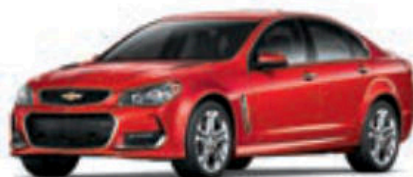
RED HOT 2