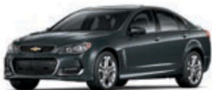
NIGHTFALL GRAY METALLIC