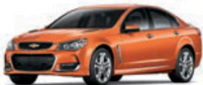
ORANGE BLAST METALLIC 1