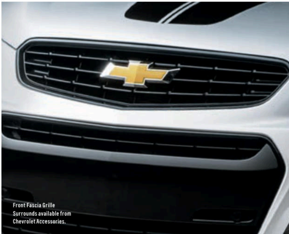
Front Fascia Grille Surrounds available from Chevrolet Accessories.