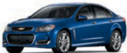
SLIPSTREAM BLUE METALLIC