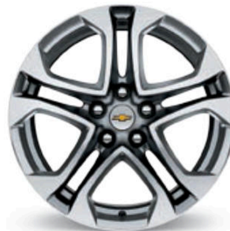
19" Ultra Bright Machined-Face Cast-Aluminum 2 (Standard)