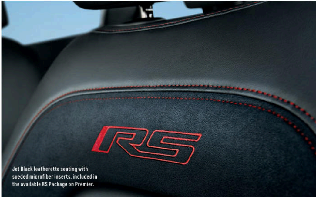
Jet Black leatherette seating with sueded microfiber inserts, included in the available RS Package on Premier.