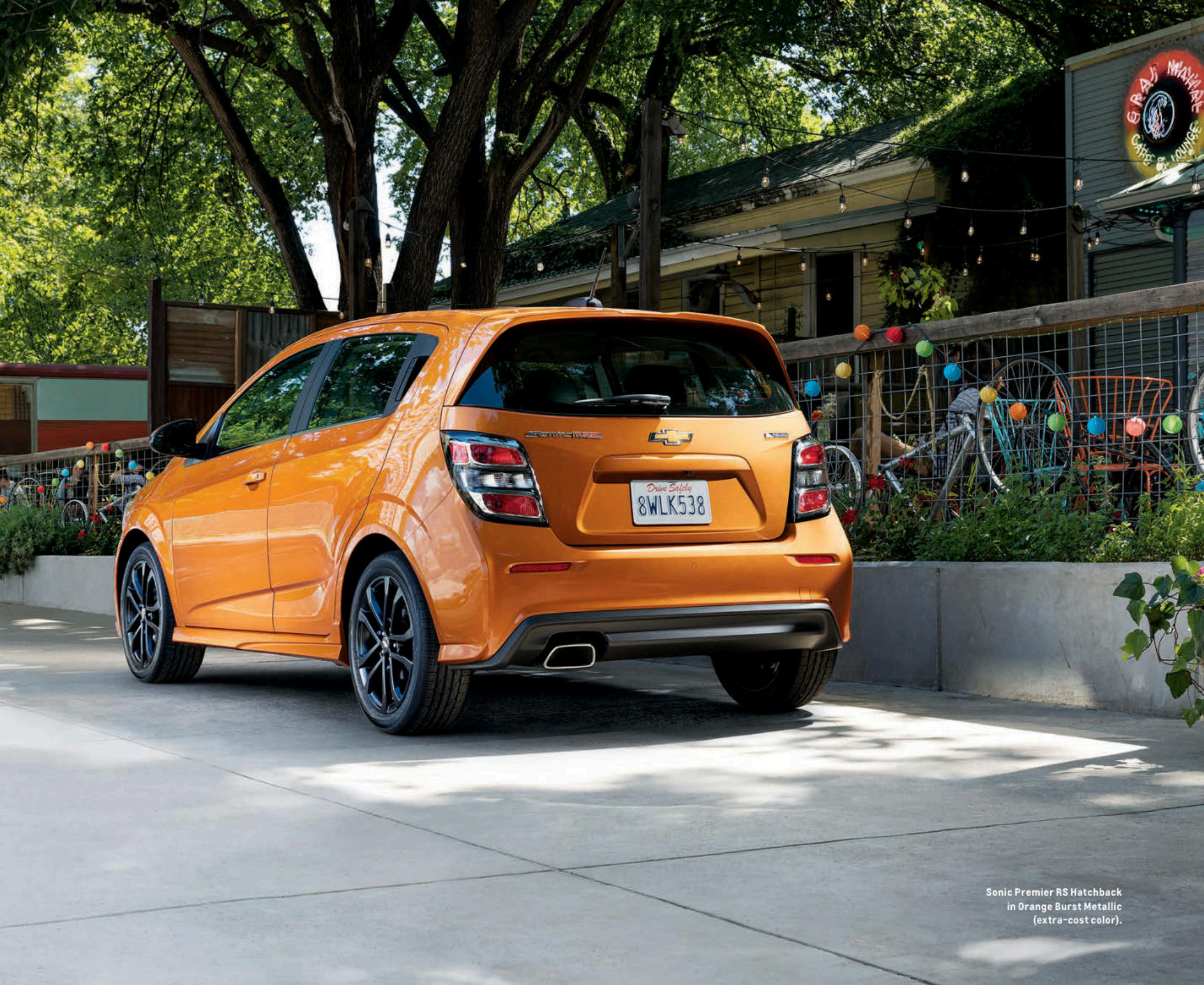
Sonic Premier RS Hatchback in Orange Burst Metallic (extra-cost color).