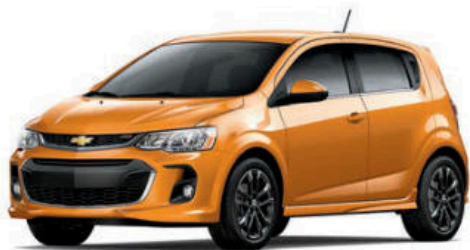
ORANGE BURST METALLIC 1,2