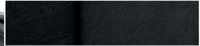
Jet Black Leatherette with Sueded Microfiber Inserts 1