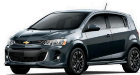
NIGHTFALL GRAY METALLIC