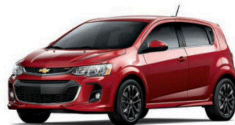
CAJUN RED TINTCOAT 2,3