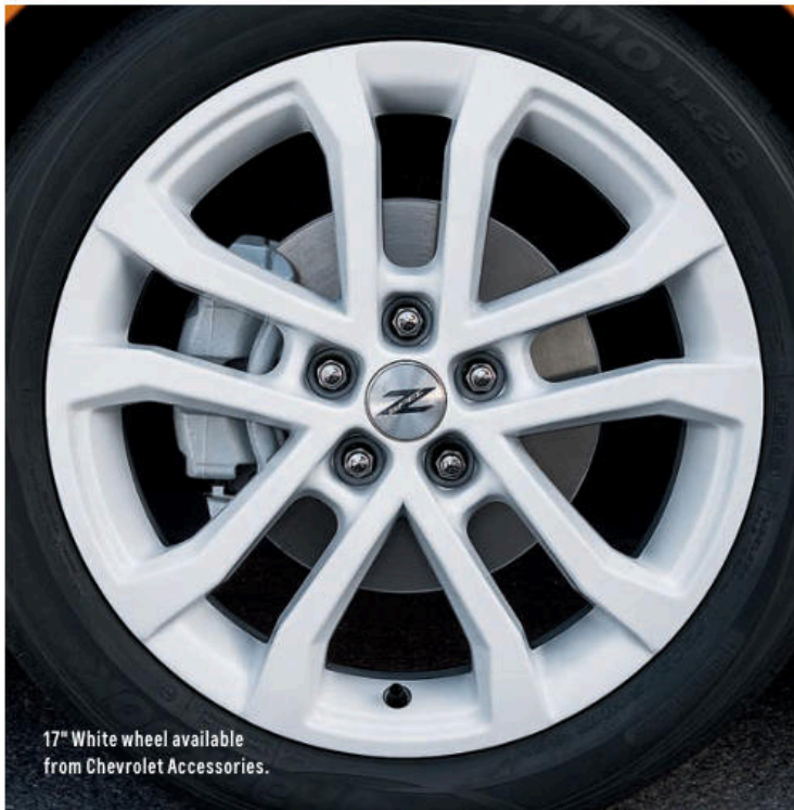
17" White wheel available from Chevrolet Accessories.