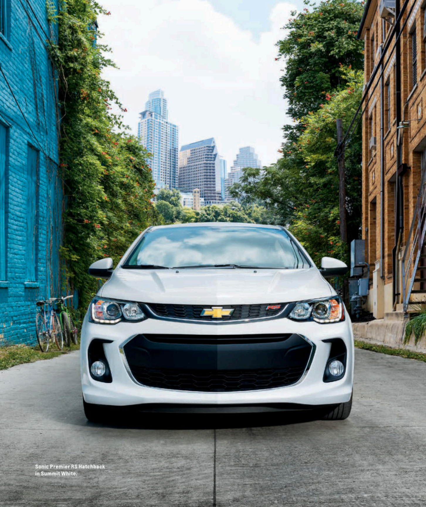
Sonic Premier RS Hatchback in Summit White.