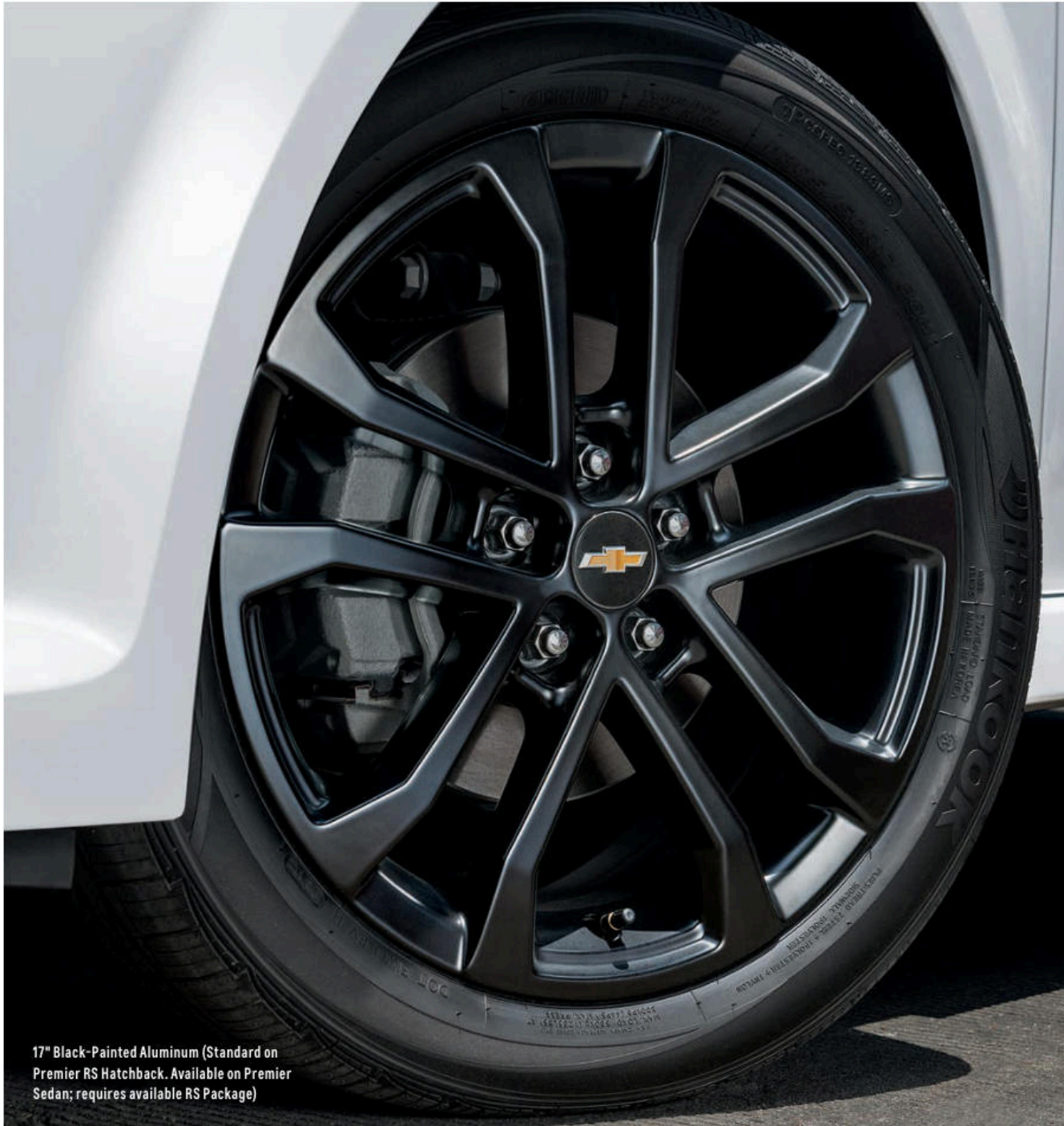
17" Black-Painted Aluminum (Standard on Premier RS Hatchback. Available on Premier Sedan; requires available RS Package)