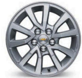
15" Aluminum (Standard on LT Sedan)