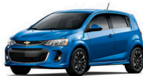
KINETIC BLUE METALLIC 2