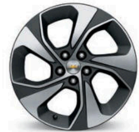
17" Painted-Aluminum (Available on Premier Sedan with automatic transmission)