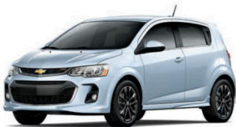
ARCTIC BLUE METALLIC