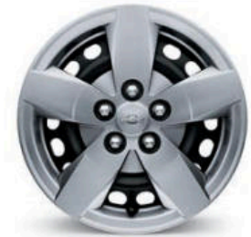
15" Steel with Bolt-On Wheel Cover (Standard on LS)