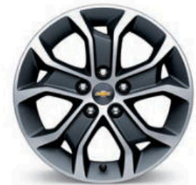
16" Aluminum (Standard on LT Hatchback. Available on LT Sedan; requires available RS Package)