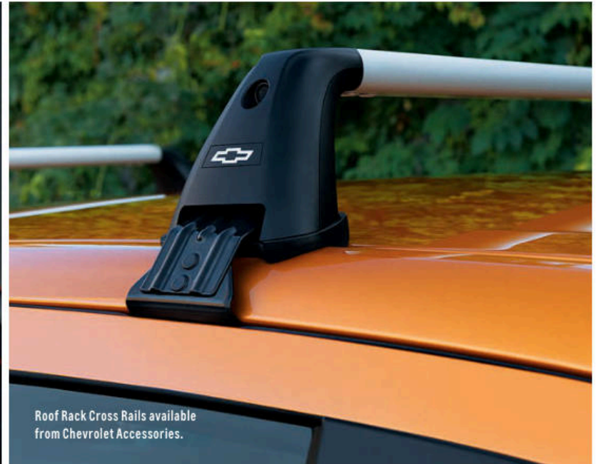
Roof Rack Cross Rails available from Chevrolet Accessories.