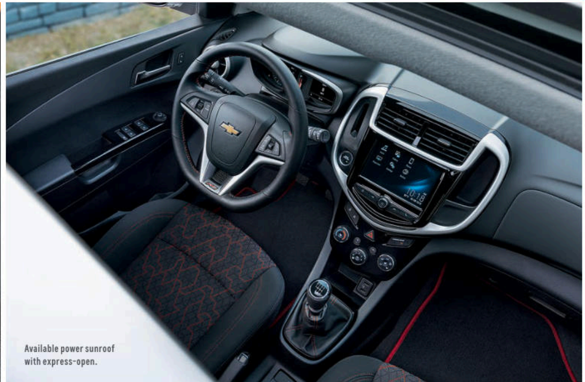
Available power sunroof with express-open.