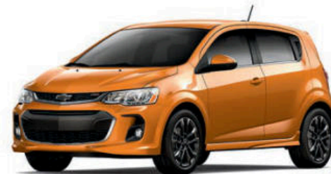
ORANGE BURST METALLIC 1,3