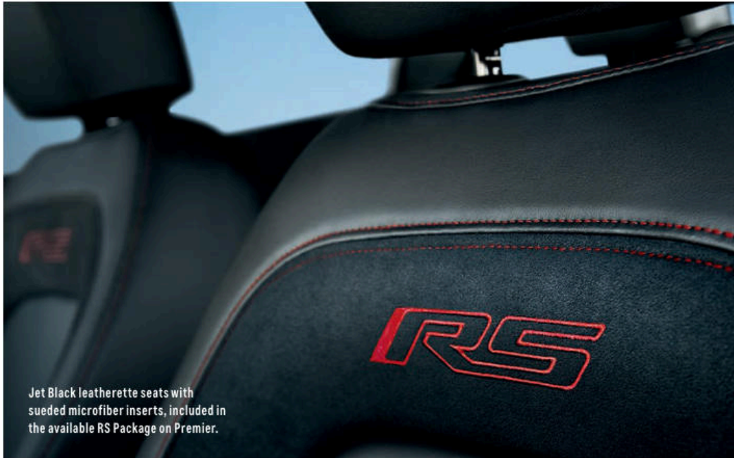
Jet Black leatherette seats with sueded microfiber inserts, included in the available RS Package on Premier.