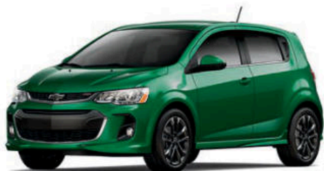
IVY METALLIC 1,2