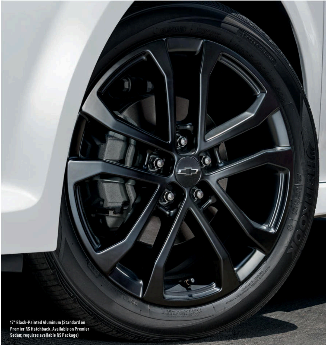
17" Black-Painted Aluminum (Standard on Premier RS Hatchback. Available on Premier Sedan; requires available RS Package)