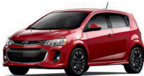
CAJUN RED TINTCOAT 1,2