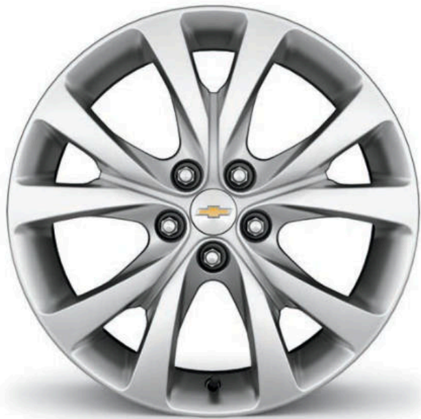
17" Silver-Painted Aluminum Wheel available from Chevrolet Accessories.