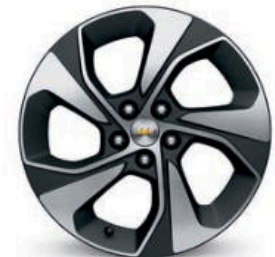
17" Painted-Aluminum (Available on Premier Sedan with automatic transmission)