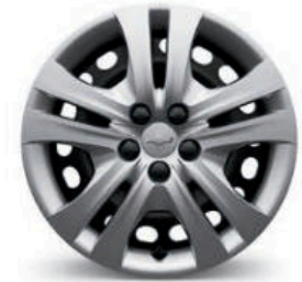
15" Steel with Bolt-On Wheel Cover (Standard on LS)