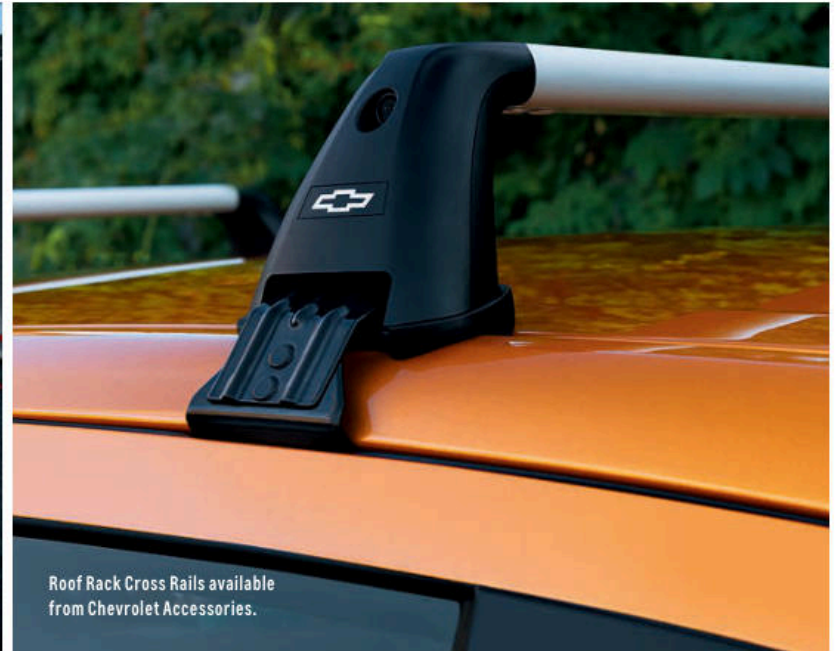
Roof Rack Cross Rails available from Chevrolet Accessories.