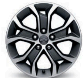
16" Aluminum (Standard on LT Hatchback. Available on LT Sedan; requires available RS Package)