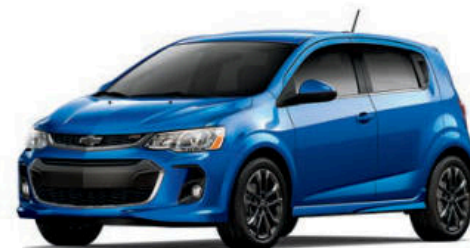
KINETIC BLUE METALLIC 1