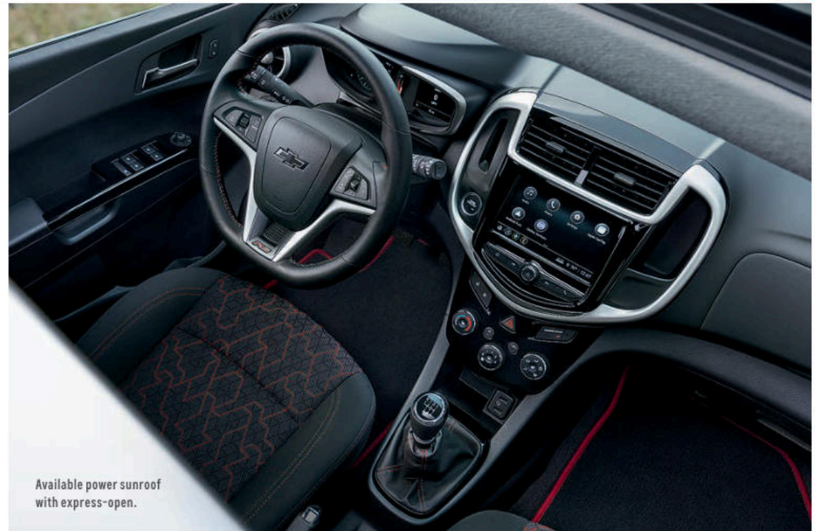
Available power sunroof with express-open.