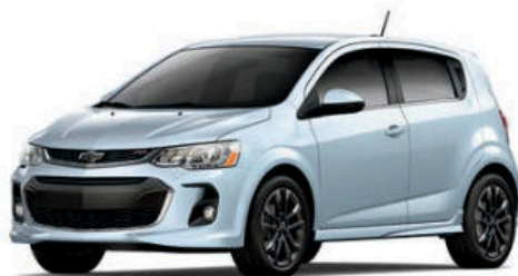
ARCTIC BLUE METALLIC