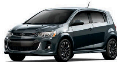
NIGHTFALL GRAY METALLIC