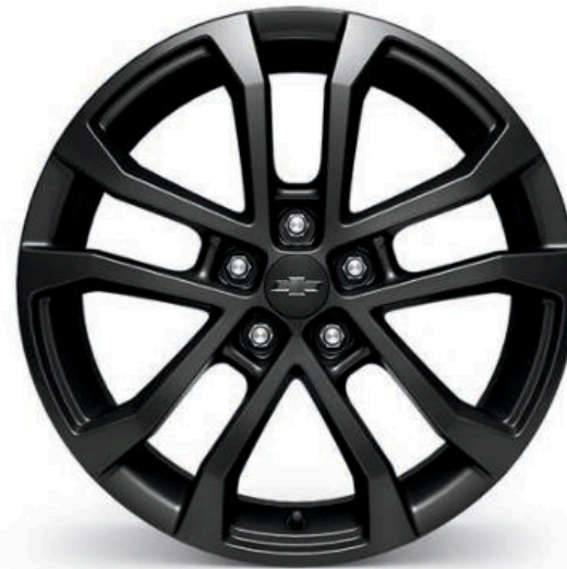
17" Black-Painted Aluminum (Standard on Premier RS Hatchback. Available on Premier Sedan; requires available RS Package)