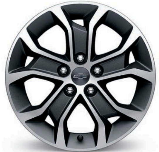
16" Aluminum (Standard on LT Hatchback. Available on LT Sedan; requires available RS Package)