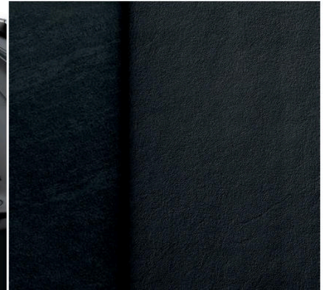
Jet Black Leatherette with Sueded Microfiber Inserts 1