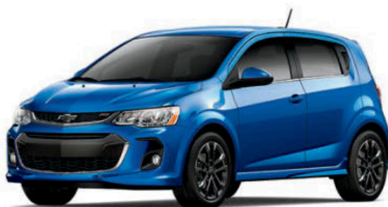
KINETIC BLUE METALLIC 1