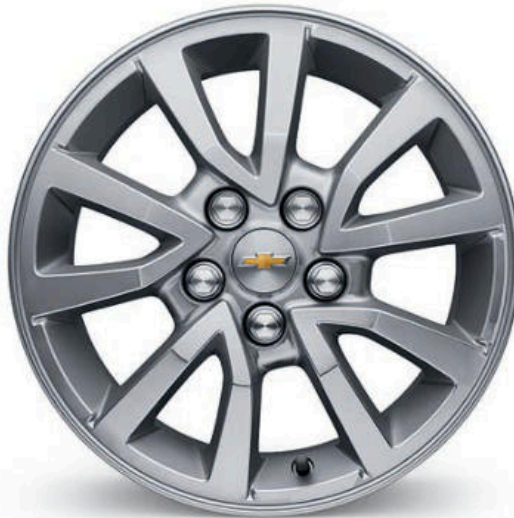
15" Aluminum (Standard on LT Sedan)