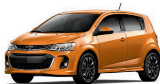
ORANGE BURST METALLIC 1,3