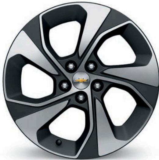
17" Painted-Aluminum (Available on Premier Sedan with automatic transmission)