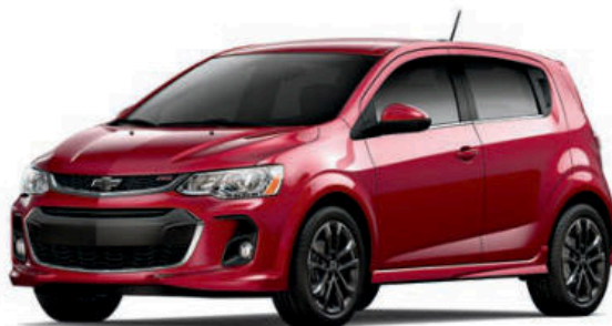
CAJUN RED TINTCOAT 1,2