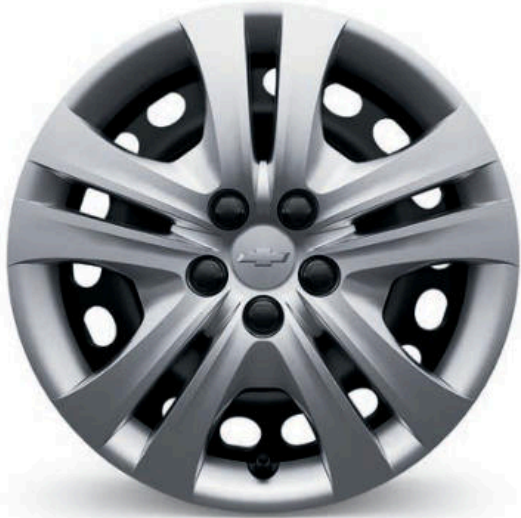
15" Steel with Bolt-On Wheel Cover (Standard on LS)