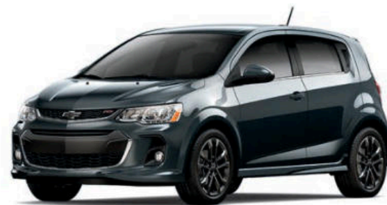
NIGHTFALL GRAY METALLIC