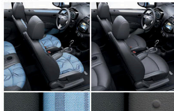
Electric Blue Cloth with Electric Blue Trim (1LT)