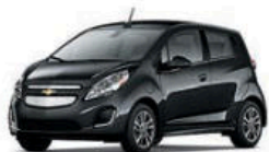
BLACK GRANITE 1