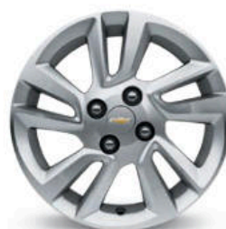
15" Aluminum 3