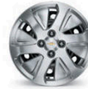
15" Steel (LS)