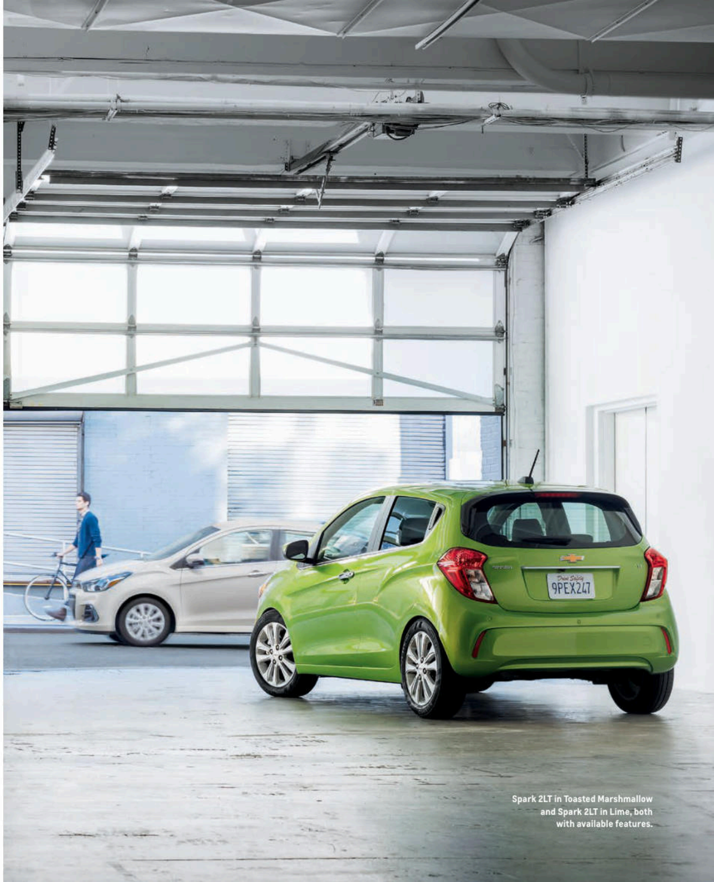
Spark 2LT in Toasted Marshmallow and Spark 2LT in Lime, both with available features.

1 EPA-estimated 31 MPG city/41 highway with available CVT transmission. 2 Vehicle user interfaces are products of Apple and Google and their terms and privacy statements apply. Requires compatible smartphone and data plan rates apply. 3 Full functionality requires compatible Bluetooth and smartphone, and USB connectivity for some devices. MyLink on Spark does not include functionality such as enhanced voice recognition, Gracenote and CD player.