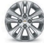
15" Silver-Painted Alloy (LT)