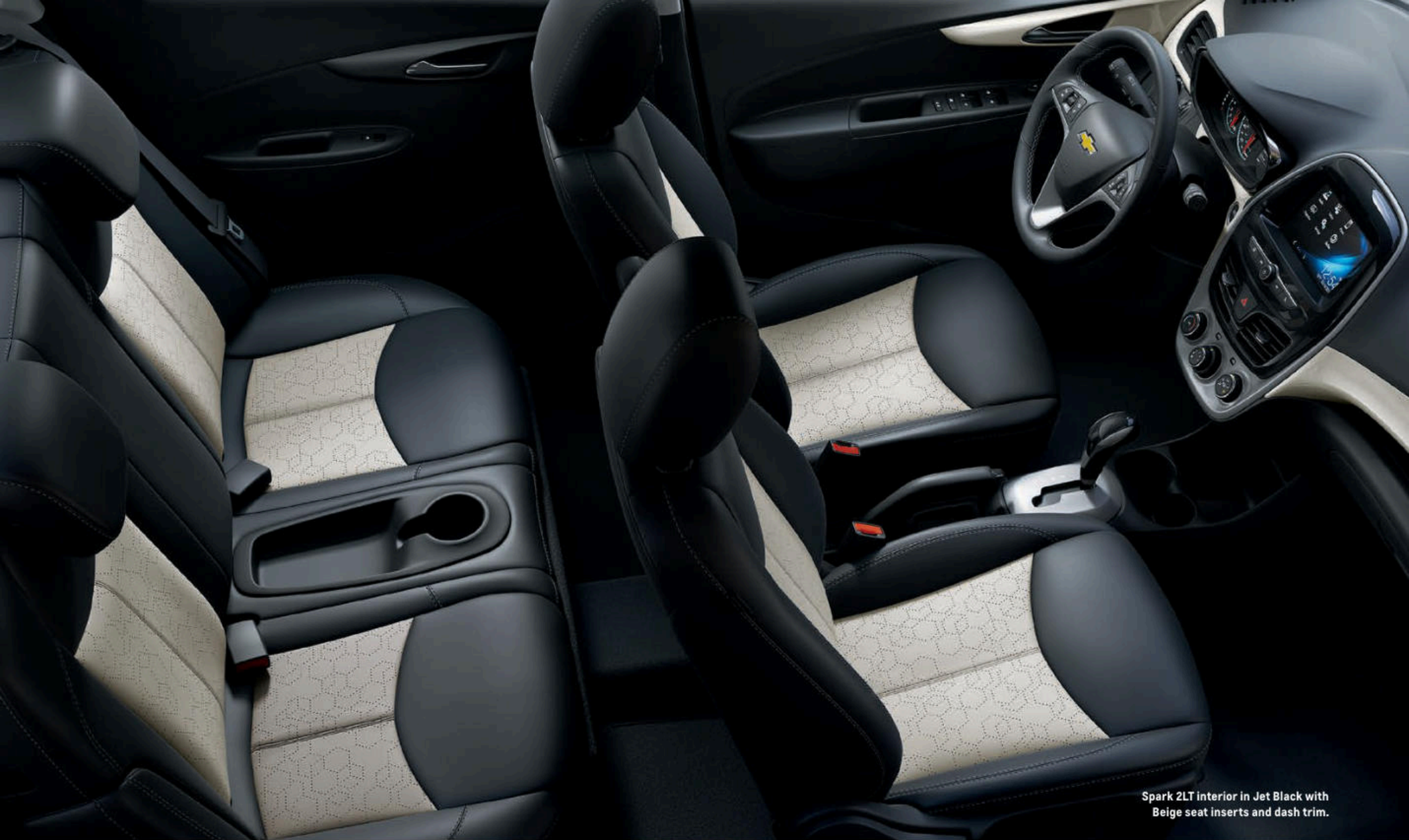
Spark 2LT interior in Jet Black with Beige seat inserts and dash trim.