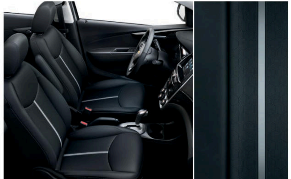
Jet Black Leatherette with Dark Anderson Silver Accent Stripe and Accent Trim 2