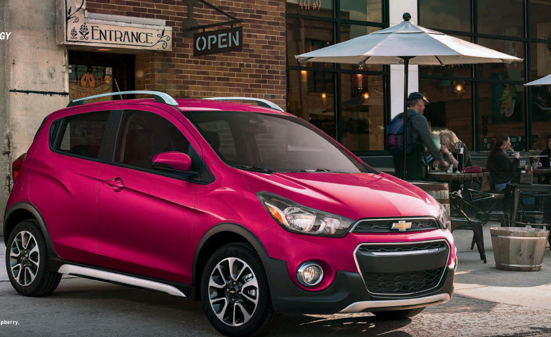
Spark ACTIV in Raspberry.

1 Service varies with conditions and location. Requires active OnStar service and paid AT&T data plan. Vehicle must be on or in accessory mode for Wi-Fi to function. Visit onstar.com for details and limitations. 2 Requires compatible Apple or Android device and data connection. Remote Services require paid plan. 3 Services are subject to User Terms and limitations. Plan does not include emergency or security services. Visit onstar.com for more details. 4 Visit onstar.com for coverage map, system limitations and details. OnStar plan, working electrical system, cell service and GPS signal required. OnStar links to emergency services. 5 If you decide to continue service after your trial, the subscription plan you choose will automatically renew thereafter and you will be charged according to your chosen payment method at then-current rates. Fees and taxes apply. To cancel you must call SiriusXM at 1-866-635-2349. See SiriusXM Customer Agreement for complete terms at siriusxm.com . All fees and programming subject to change.