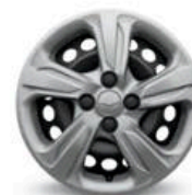
15" Steel with Bolt-On Wheel Cover (LS)