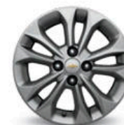
15" Silver-Painted Alloy (1LT and 2LT)