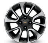
15" Gunmetal Silver-Painted Alloy (ACTIV)