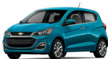
CARIBBEAN BLUE 1