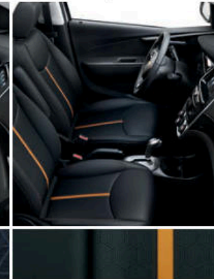
Jet Black Leatherette with Orange Burst Accent Stripe and Accent Trim 4