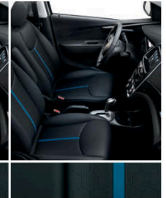
Jet Black Leatherette with Caribbean Blue Accent Stripe and Accent Trim 5