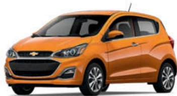
ORANGE BURST 1