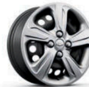
15" Steel with Bolt-On Wheel Cover (LS)