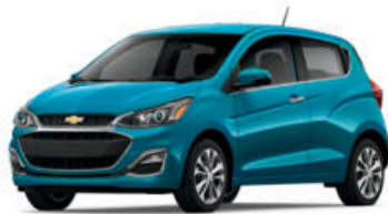
Caribbean Blue 1