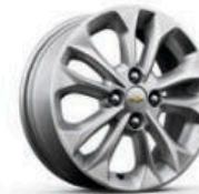
15" Silver-Painted Aluminum (1LT and 2LT)