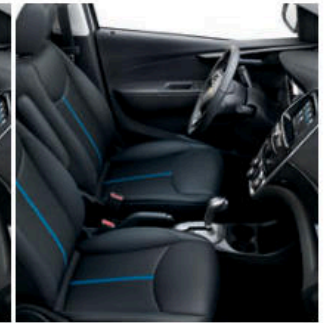
Jet Black Leatherette with Caribbean Blue Accent Stripe and Accent Trim 5