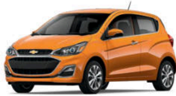
Orange Burst 1