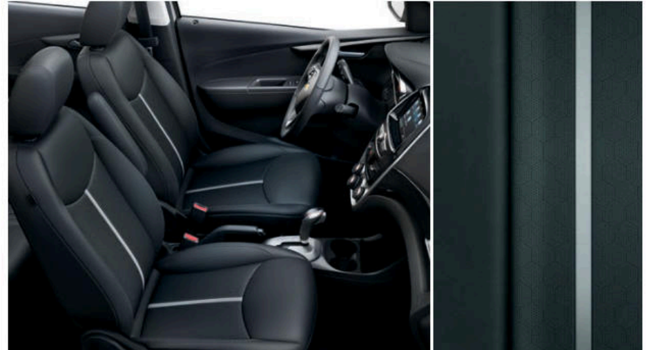
Jet Black Leatherette with Dark Anderson Silver Accent Stripe and Accent Trim 2