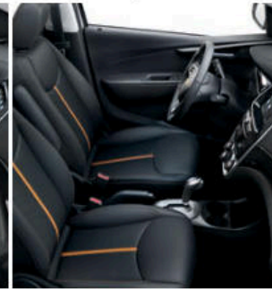
Jet Black Leatherette with Orange Burst Accent Stripe and Accent Trim 4