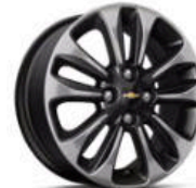
15" Black-Painted Machined-Finish Aluminum (Available on 1LT)