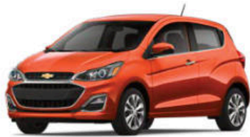
Cayenne Orange 1