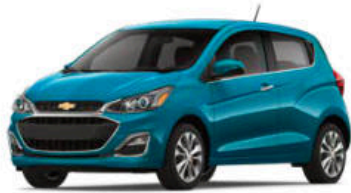
Caribbean Blue 1,2