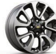
15" Gunmetal Silver-Painted Aluminum (ACTIV)