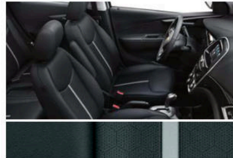
Jet Black Leatherette with Dark Anderson Silver Accent Stripe and Accent Trim 5