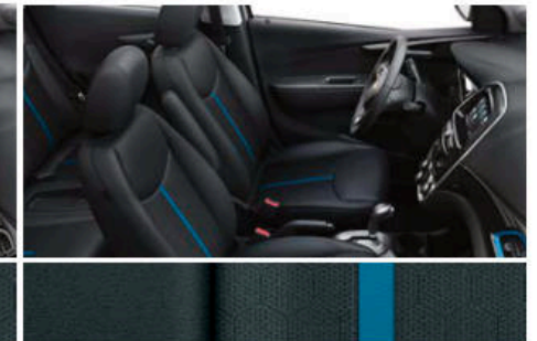
Jet Black Leatherette with Caribbean Blue Accent Stripe and Accent Trim 6