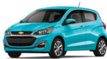
Mystic Blue 1