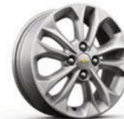
15" Silver-Painted Aluminum (1LT and 2LT)