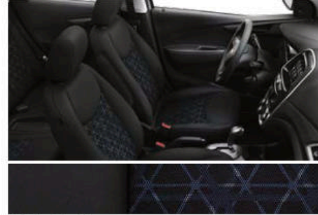
Jet Black Cloth 3