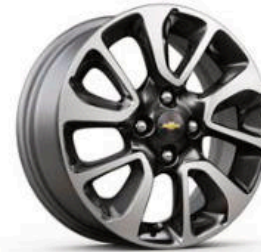
15" Gunmetal Silver-Painted Aluminum Wheels Standard on ACTIV