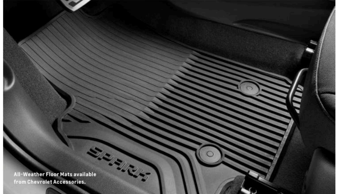
All-Weather Floor Mats available from Chevrolet Accessories.