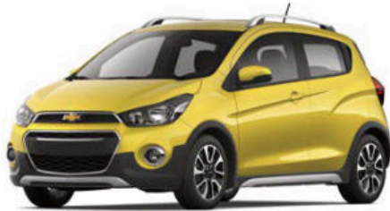
Nitro Yellow 1