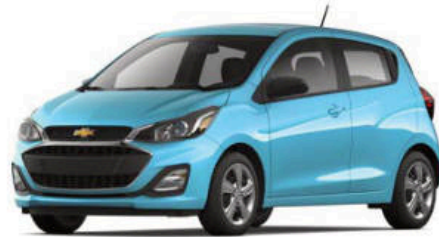
Mystic Blue 1