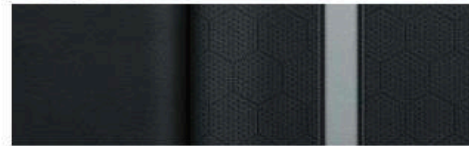
Jet Black Leatherette with Dark Anderson Silver Accent Stripe and Accent Trim