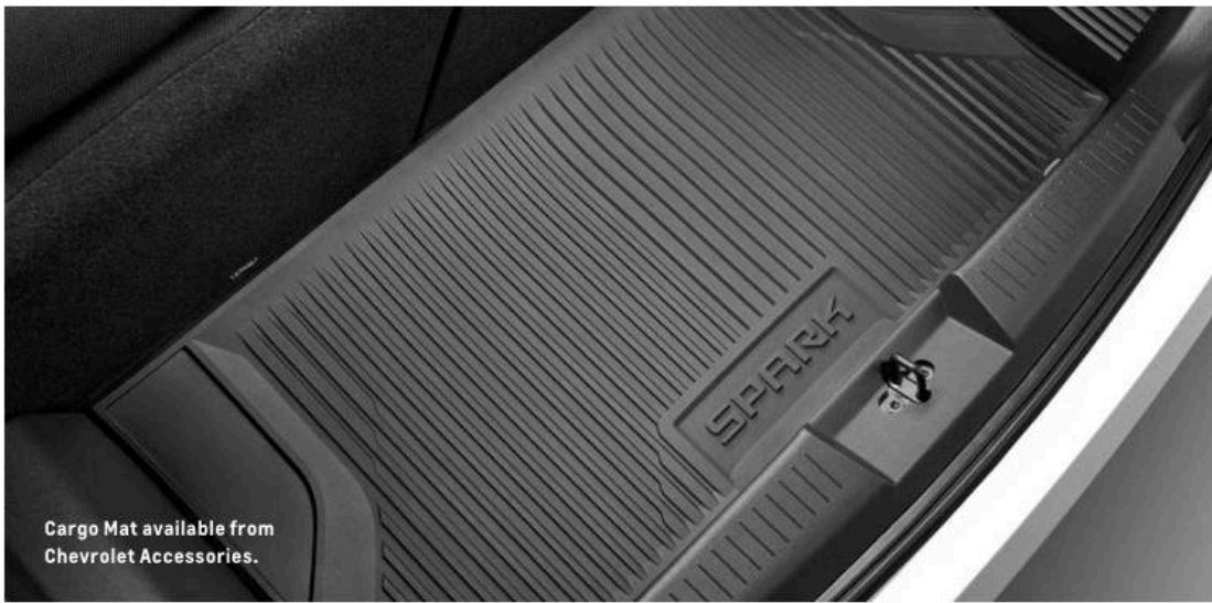
Cargo Mat available from Chevrolet Accessories.