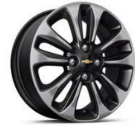
15" Black-Painted Machined-Finish Aluminum Wheels Available on 1LT with Spark Special Edition