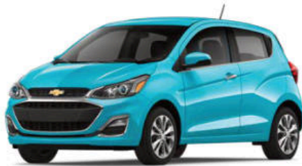
Mystic Blue 1