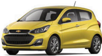
Nitro Yellow 1