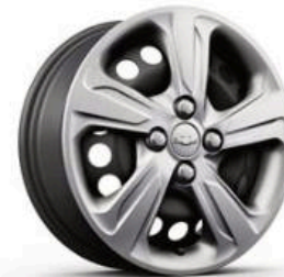
15" Steel Wheels with Painted Wheel Covers Standard on LS