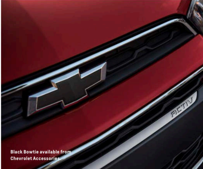
Black Bowtie available from Chevrolet Accessories.