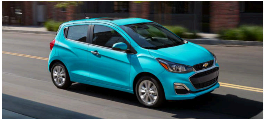
Spark 2LT in Mystic Blue (extra-cost color).

1 Chevrolet Infotainment System functionality varies by model. Full functionality requires compatible Bluetooth and smartphone, and USB connectivity for some devices. 2 Vehicle user interface is a product of Apple and its terms and privacy statements apply. Requires compatible iPhone and data plan rates apply. 3 Vehicle user interface is a product of Google, and its terms and privacy statements apply. Requires the Android Auto app on Google Play and a compatible Android smartphone. Data plan rates apply. You can check which smartphones are compatible at g.co/androidauto/requirements . 4 Service varies with conditions and location. Requires active service and paid AT&T data plan. Visit onstar.com for details and limitations. 5 Not compatible with all devices. 6 Cargo and load capacity limited by weight and distribution. 7 Safety or driver assistance features are no substitute for the driver's responsibility to operate the vehicle in a safe manner. Read the vehicle Owner's Manual for important feature limitations and information.