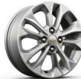
15" Silver-Painted Aluminum Wheels Standard on 2LT