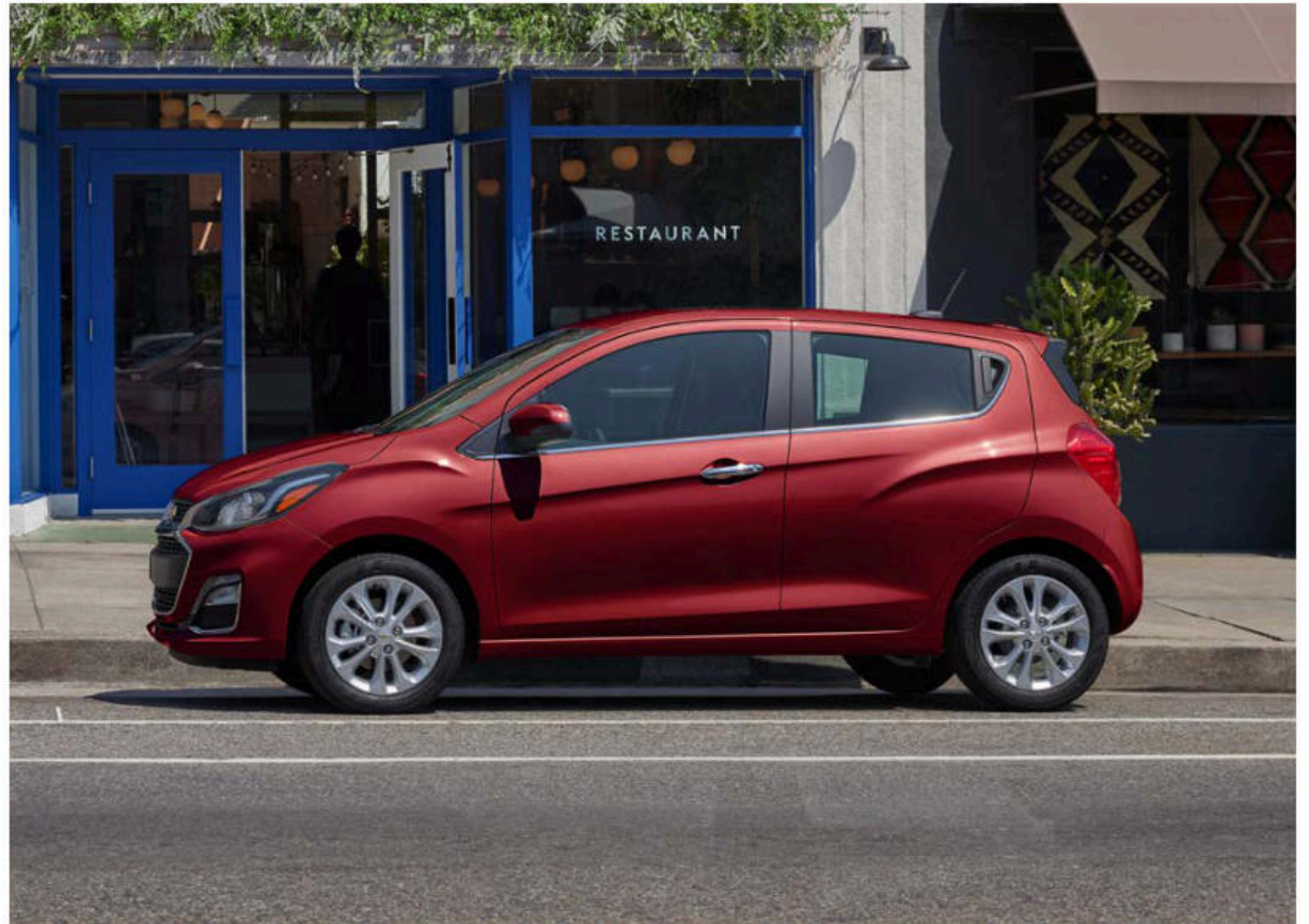
Spark 2LT in Crimson.

Going small can be the fastest way to keep up in today's world. Chevrolet Spark is not only fun to drive, but it also fits almost anywhere you want to go, with space for friends and fun. Spark offers innovative safety features and smart technologies that help keep you connected along the way. Better yet, you'll now have your pick of all those too-small-for-everybody-else parking spots.