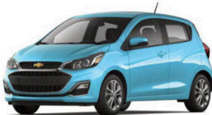
Mystic Blue 1