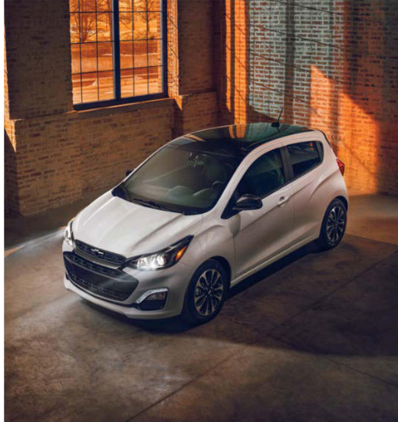
Spark Special Edition.