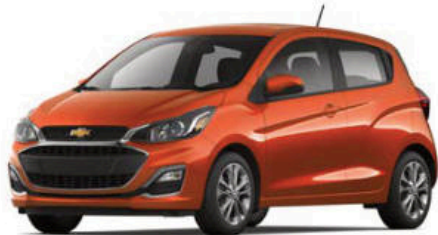
Cayenne Orange 1