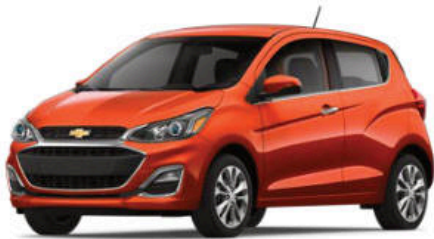
Cayenne Orange 1