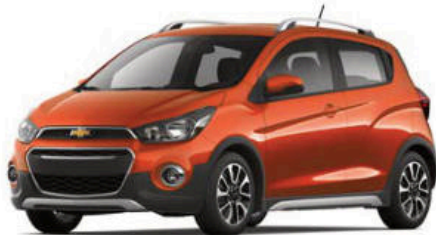
Cayenne Orange 1