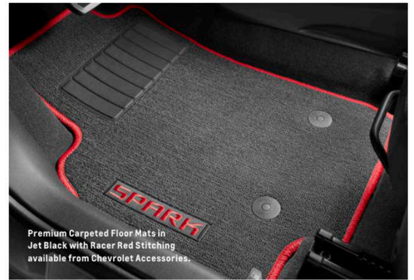
Premium Carpeted Floor Mats in Jet Black with Racer Red Stitching available from Chevrolet Accessories.