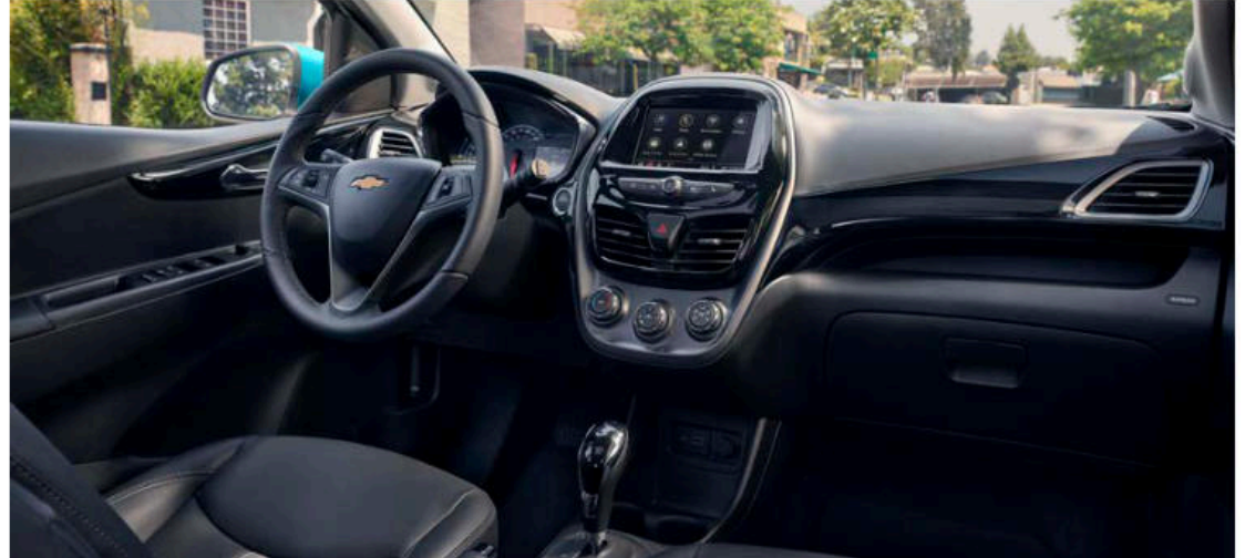
Spark 2LT interior in Jet Black.