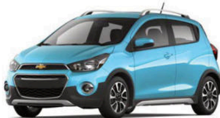
Mystic Blue 1