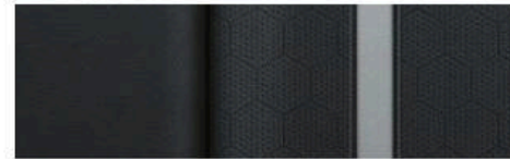
Jet Black Leatherette with Dark Anderson Silver Accent Stripe and Accent Trim