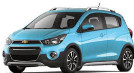
Mystic Blue 1