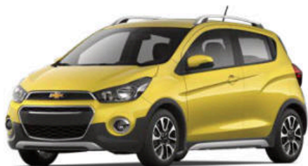
Nitro Yellow 1