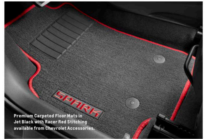
Premium Carpeted Floor Mats in Jet Black with Racer Red Stitching available from Chevrolet Accessories.