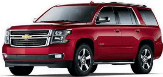
SIREN RED TINTCOAT 1