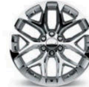
22" Chrome-Aluminum Multi-Feature Design (Available on LT and LTZ)