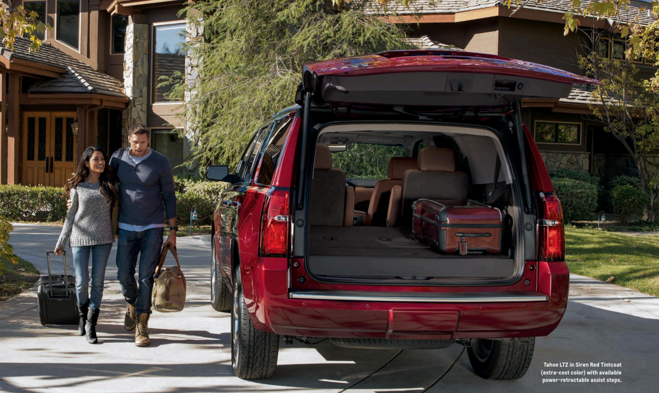
Tahoe LTZ in Siren Red Tintcoat (extra-cost color) with available power-retractable assist steps.

VERSATILITY DEFINED. How you use your Tahoe changes from day to day and even from trip to trip. The supremely quiet and comfortable interior provides spaciousness for up to nine passengers in LS models.