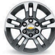
18" Aluminum with High-Polished Finish (Standard on LS and LT)