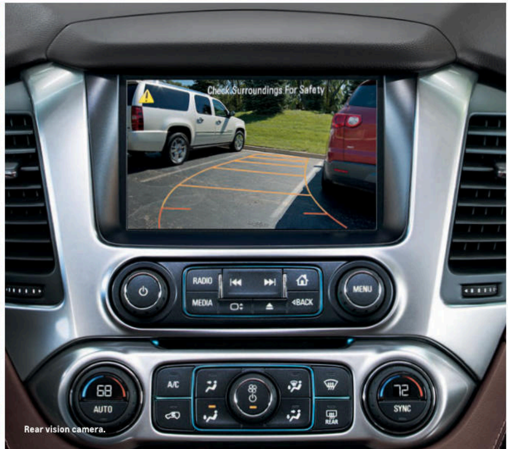
Rear vision camera.