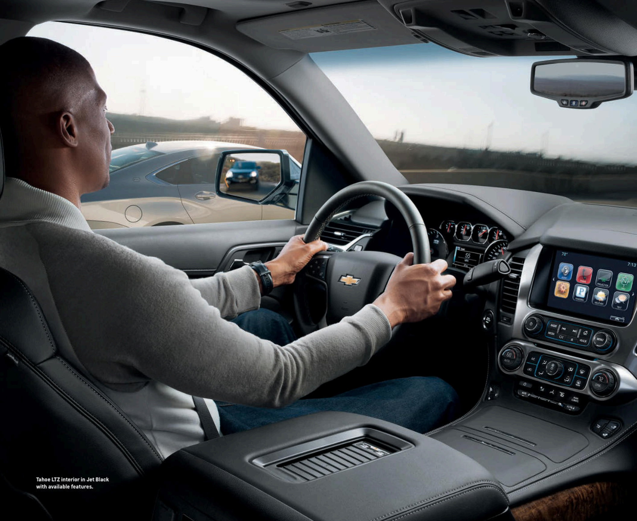
Tahoe LTZ interior in Jet Black with available features.