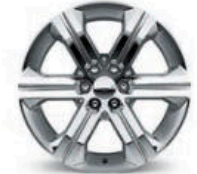
22" Chrome-Aluminum (Available on LT and LTZ)