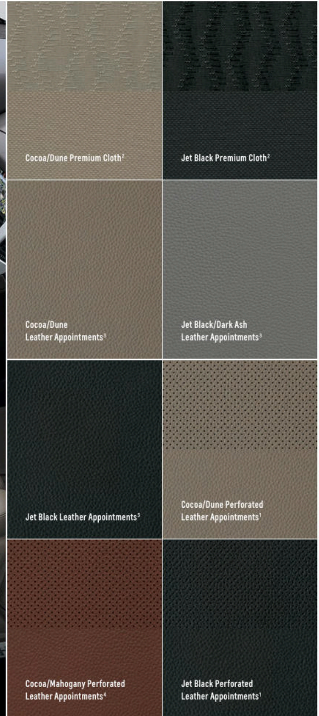
Cocoa/Dune Perforated Leather Appointments 1