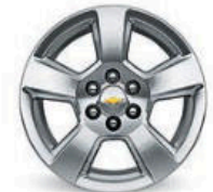
20" Polished-Aluminum (Standard on LTZ; available on LS and LT)