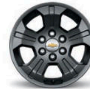
18" Painted-Aluminum (Available on LT; requires Z71 Off-Road Package)