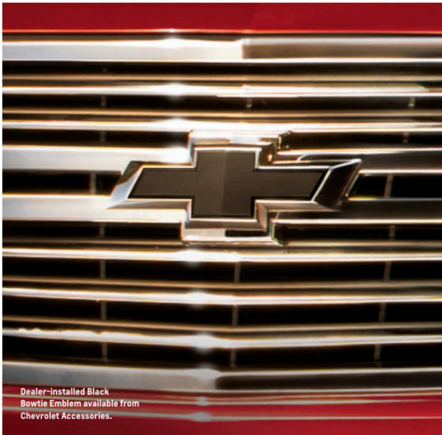
Dealer-installed Black Bowtie Emblem available from Chevrolet Accessories.