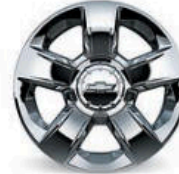
20" Chrome-Aluminum (Available on LTZ)