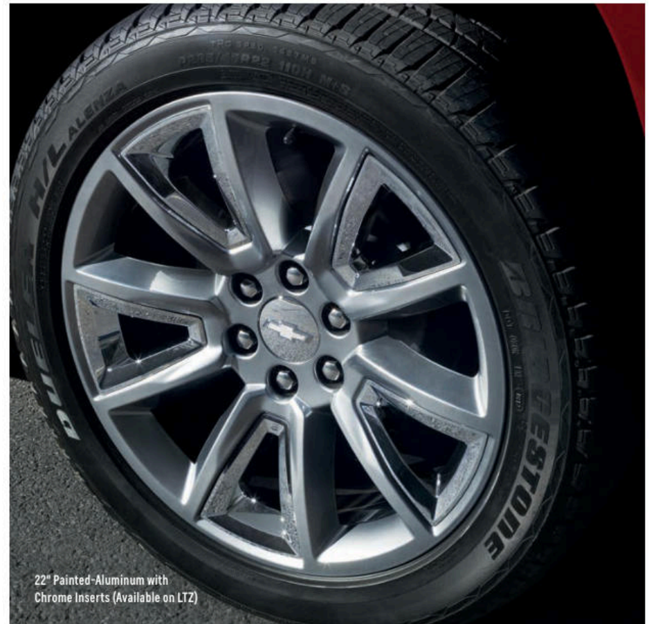
22" Painted-Aluminum with Chrome Inserts (Available on LTZ)