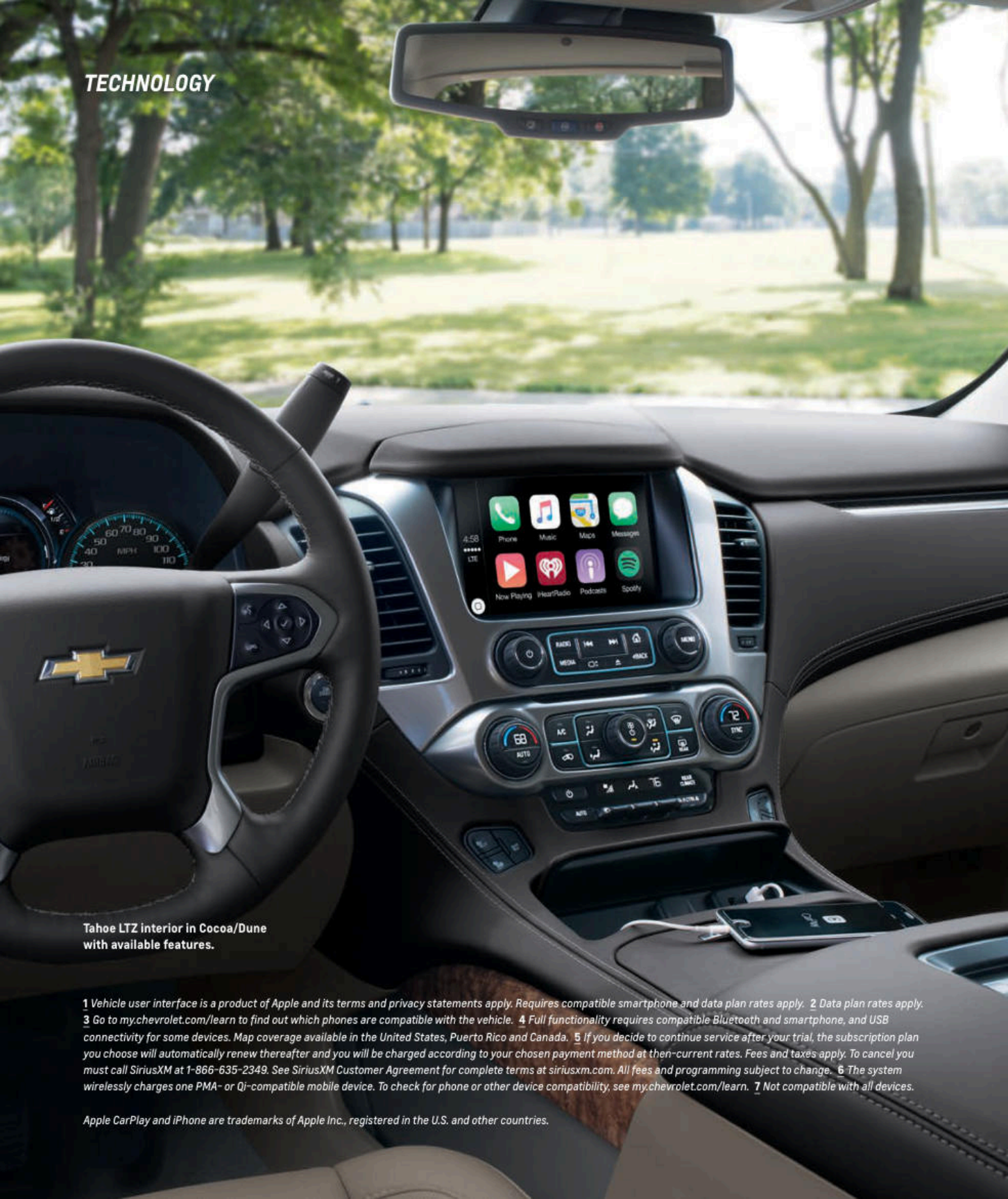
Tahoe LTZ interior in Cocoa/Dune with available features.

1 Vehicle user interface is a product of Apple and its terms and privacy statements apply. Requires compatible smartphone and data plan rates apply. 2 Data plan rates apply. 3 Go to my.chevrolet.com/learn to find out which phones are compatible with the vehicle. 4 Full functionality requires compatible Bluetooth and smartphone, and USB connectivity for some devices. Map coverage available in the United States, Puerto Rico and Canada. 5 If you decide to continue service after your trial, the subscription plan you choose will automatically renew thereafter and you will be charged according to your chosen payment method at then-current rates. Fees and taxes apply. To cancel you must call SiriusXM at 1-866-635-2349. See SiriusXM Customer Agreement for complete terms at siriusxm.com . All fees and programming subject to change. 6 The system wirelessly charges one PMA- or Qi-compatible mobile device. To check for phone or other device compatibility, see my.chevrolet.com/learn . 7 Not compatible with all devices.