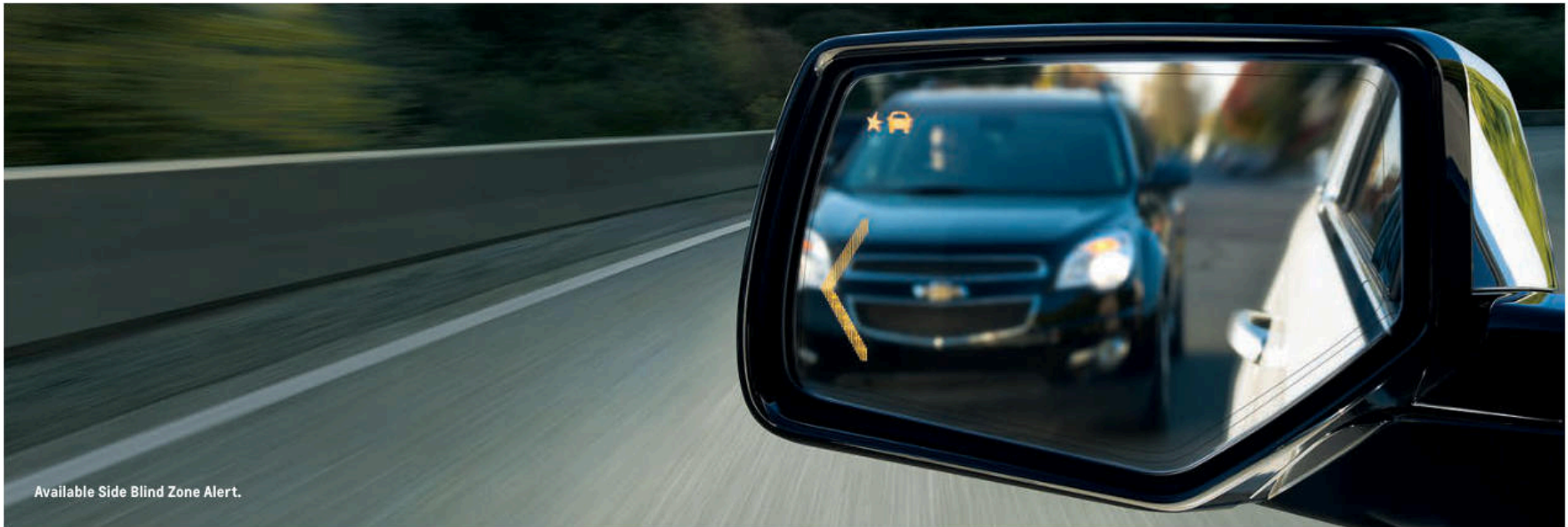
Available Side Blind Zone Alert.