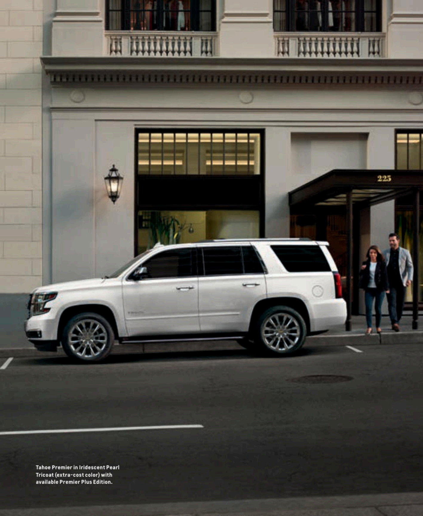
Tahoe Premier in Iridescent Pearl Tricoat (extra-cost color) with available Premier Plus Edition.