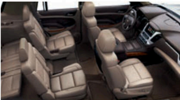
Dune Perforated Leather Appointments with Cocoa Accents 5