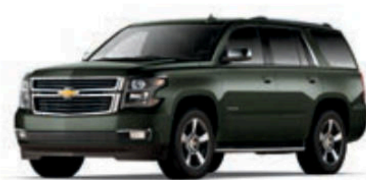
DEEPWOOD GREEN METALLIC 1,3