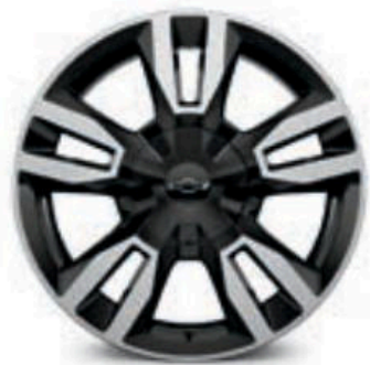
22" Gloss Black-Painted Aluminum with Custom Silver Accents (SGK) (Included with RST Edition)