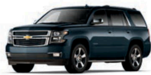
SHADOW GRAY METALLIC