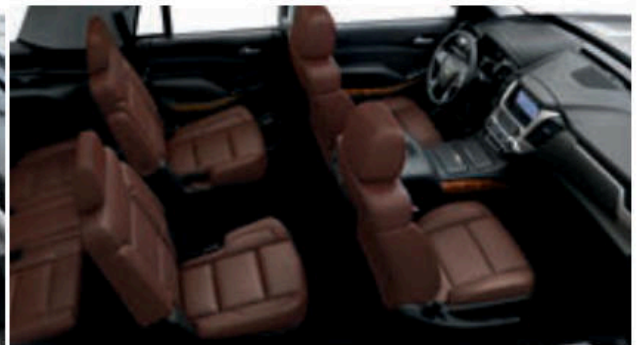
Mahogany Perforated Leather Appointments with Jet Black Accents 6