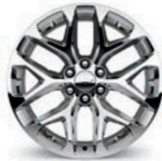
22" Chrome-Aluminum Multi-Featured Design (RPT) (Available on LT and Premier)