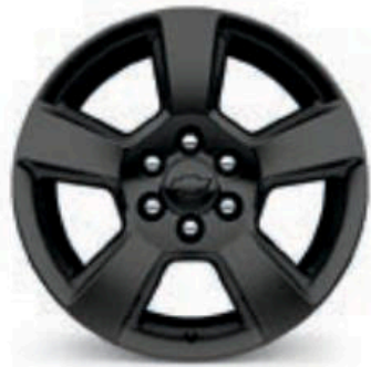
20" Black-Painted Aluminum (NZQ) (Included with LT Midnight Edition)