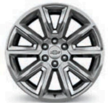
22" Premium Painted-Aluminum with Chrome Inserts (SGF) (Available on LT and Premier)