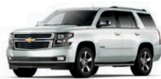
IRIDESCENT PEARL TRICOAT 1,2