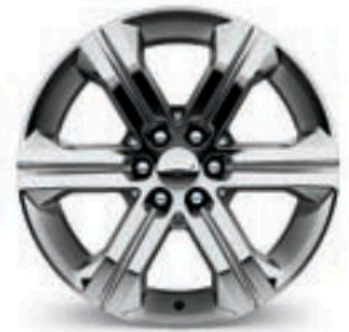
22" Chrome-Aluminum (SMI) (Available on LT and Premier)