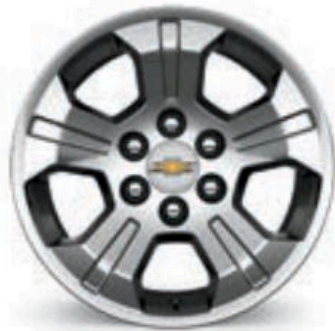
18" Painted-Aluminum (RCV) (Included with Custom Edition and Z71 Off-Road Package)