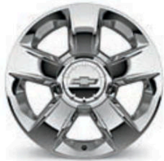
20" Chrome-Aluminum (RD2) (Available on Premier; included with LT Signature Package)