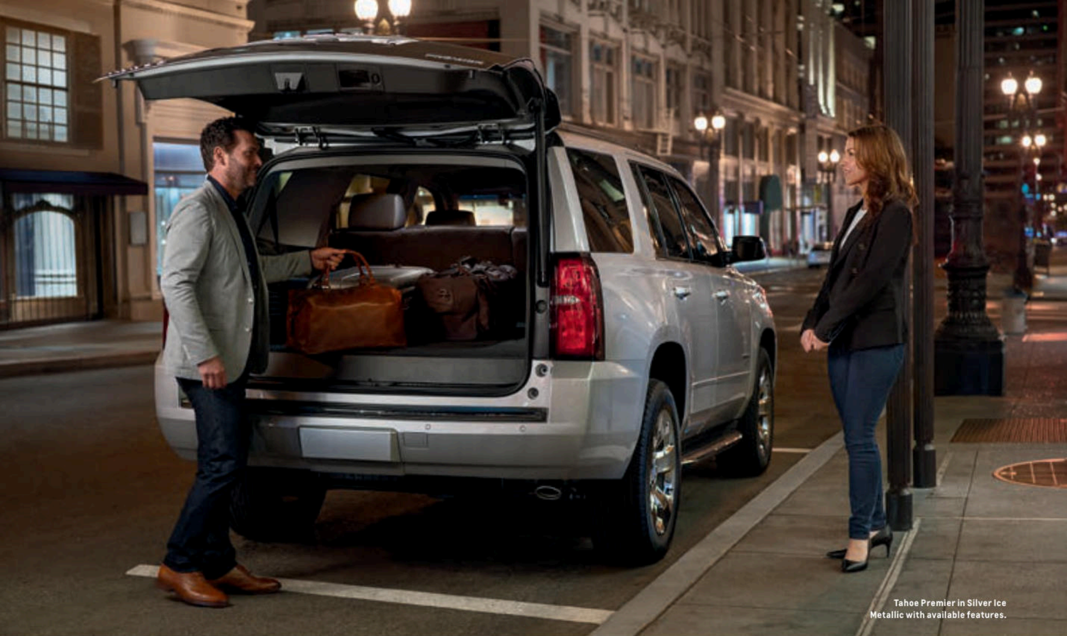
Tahoe Premier in Silver Ice Metallic with available features.

BE READY FOR ANYTHING. With the second- and third-row seats folded down, you'll have 94.7 cu. ft. of cargo space! That's more than enough room for everyday use or a weeklong road trip.