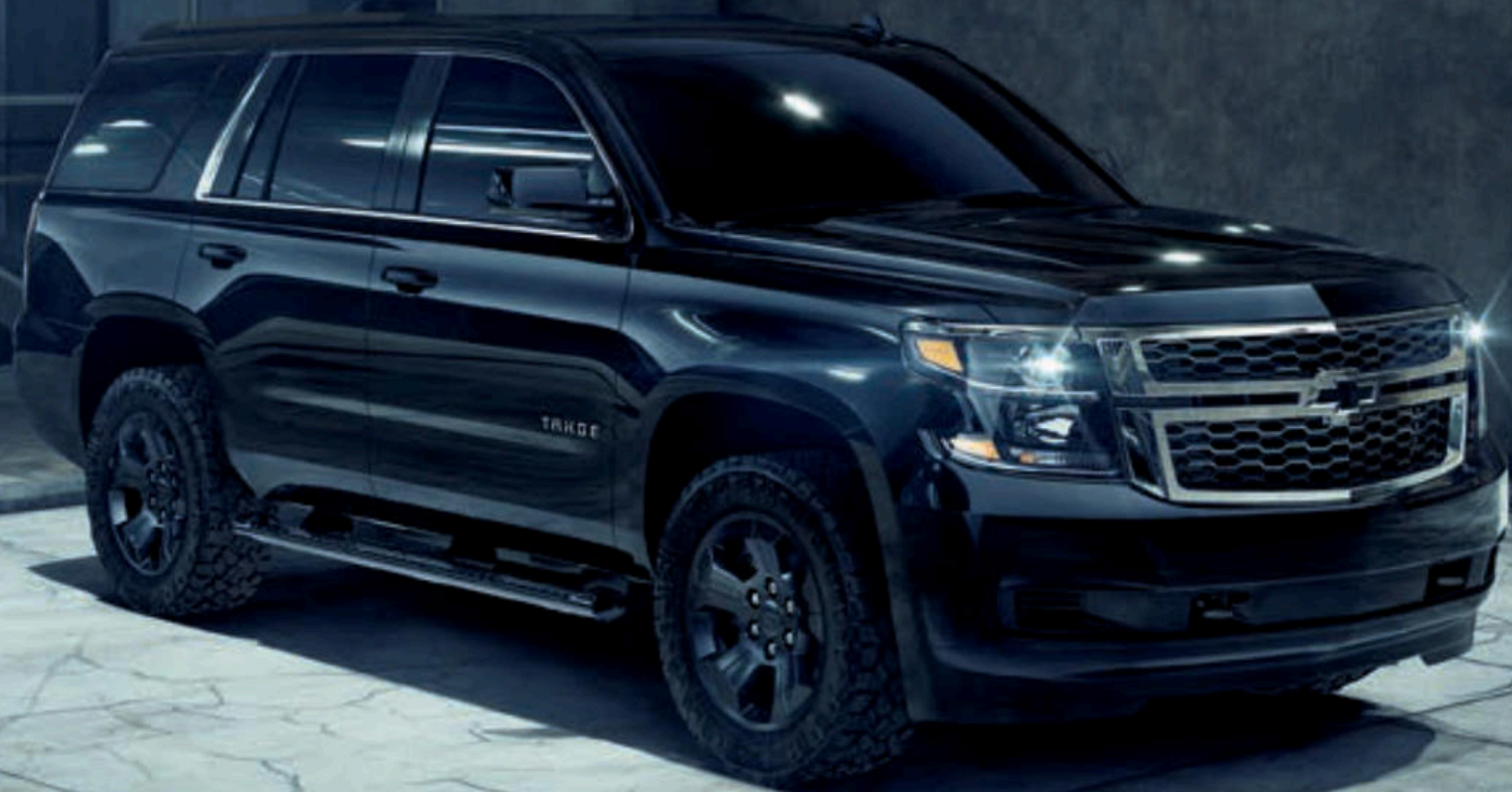
Tahoe LS in Black with available Custom Midnight Edition.