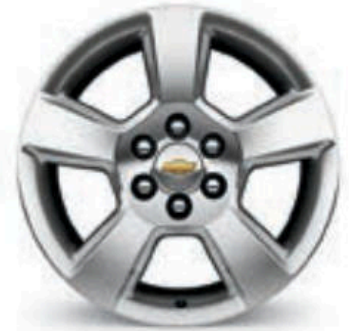
20" Polished-Aluminum (RD4) (Standard on Premier; available on LS and LT)