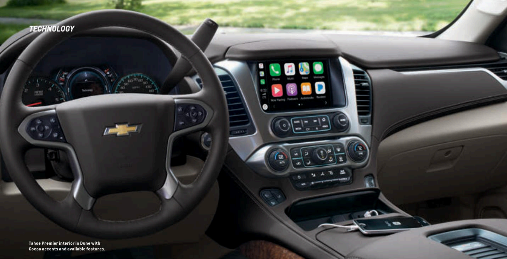
Tahoe Premier interior in Dune with Cocoa accents and available features.