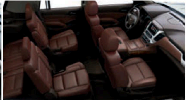
Mahogany Perforated Leather Appointments with Cocoa Accents 3,4