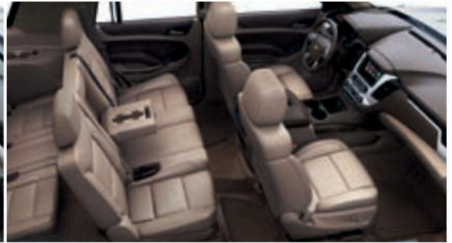
Dune Leather Appointments with Cocoa Accents 2