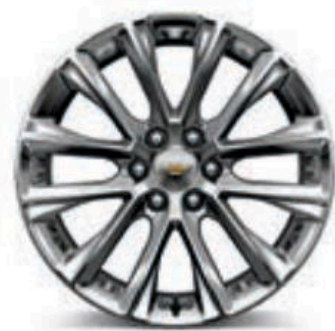
22" 12-Spoke Aluminum with Polished Finish (SH0) (Included with Premier Plus Edition)