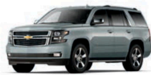
SATIN STEEL METALLIC