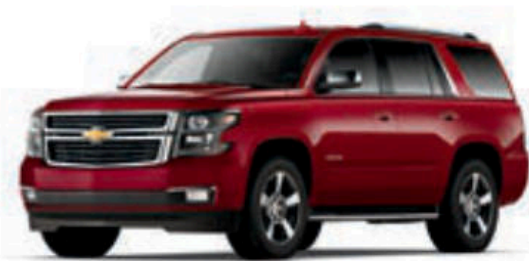
SIREN RED TINTCOAT 1