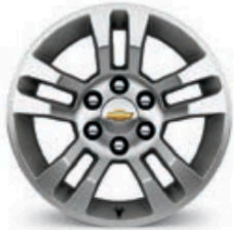
18" Aluminum with High-Polished Finish (PZX) (Standard on LS and LT)