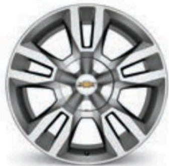
22" Bright Machined-Aluminum with Bright Silver Finish (SIY) (Available on Premier)