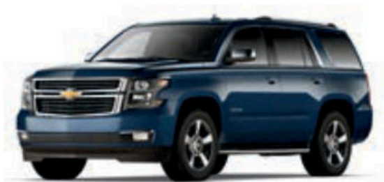
BLUE VELVET METALLIC