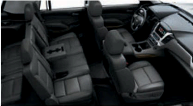
Dark Ash Leather Appointments with Jet Black Accents 2