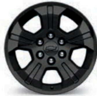
18" Black-Painted Aluminum (RE6) (Included with Z71 Midnight Edition and Custom Midnight Edition)