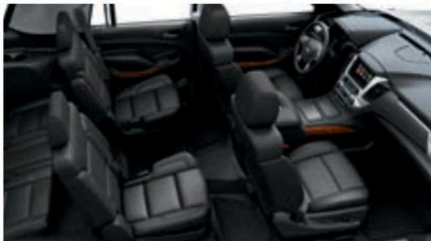
Jet Black Perforated Leather Appointments with Jet Black Accents 5