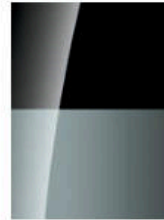
Mosaic Black Metallic/ Satin Steel Metallic