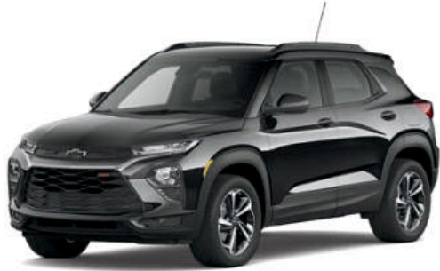
Mosaic Black Metallic 2