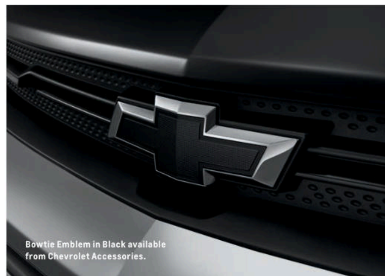
Bowtie Emblem in Black available from Chevrolet Accessories.