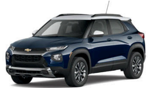
Midnight Blue Metallic 2,4