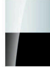
Summit White/ Mosaic Black Metallic