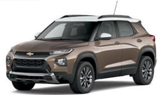
Zeus Bronze Metallic 5