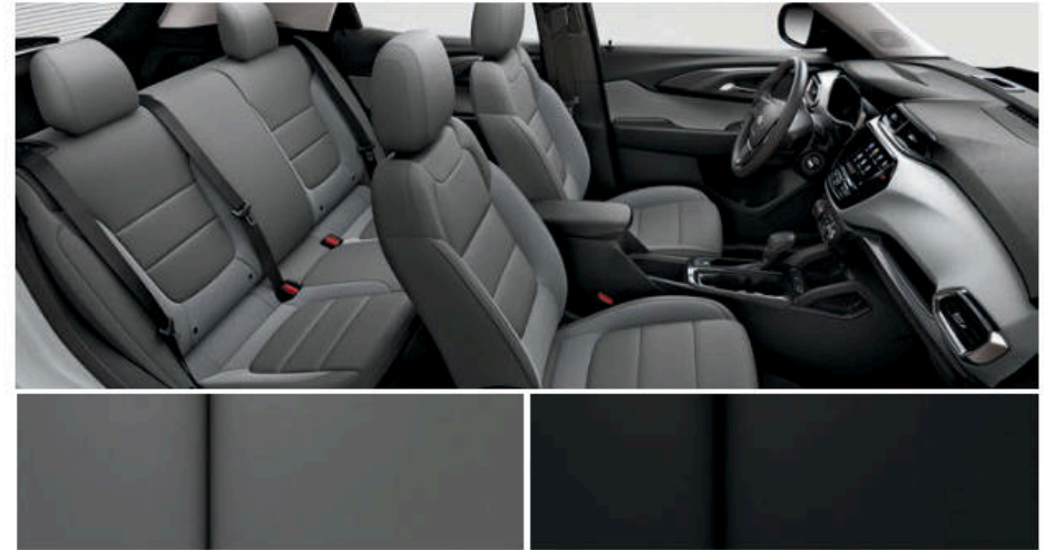
Medium Ash Gray Cloth (shown)