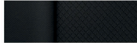
Jet Black Cloth/Leatherette Seating Surfaces with Red Accents