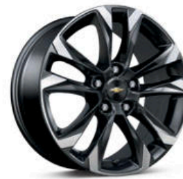
17" High-Gloss Black Machined-Aluminum Wheels Standard on LT