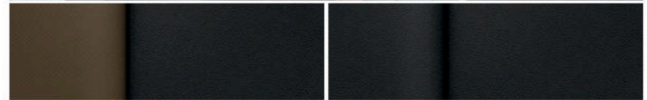
Jet Black Leatherette Seating Surfaces with Almond Butter Accents (shown)