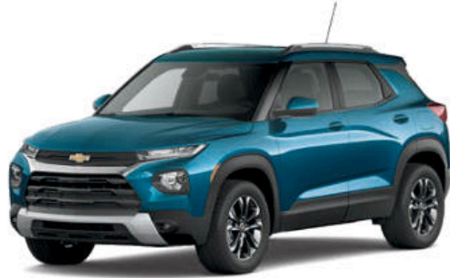
Pacific Blue Metallic 2,3,4