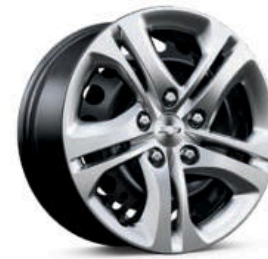
16" Steel Wheels with Bolt-On Wheel Covers Standard on L

Wipers – front variable-speed, intermittent with washers; rear intermittent with washer