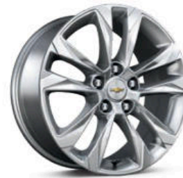
17" Silver-Painted Aluminum Wheels Standard on LS

Seat – flat-folding front passenger seatback