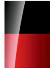
Mosaic Black Metallic/ Scarlet Red Metallic