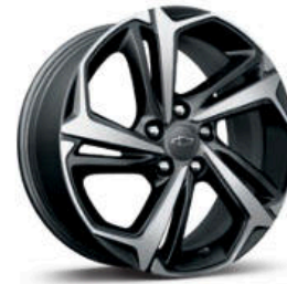
18" High-Gloss Black Machined-Aluminum Wheels Standard on RS

RS In addition to or replacing LT features, RS includes: