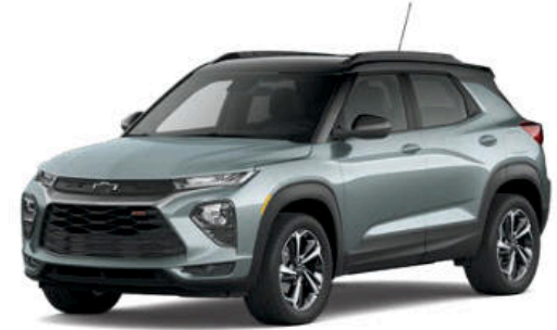
Satin Steel Metallic 2