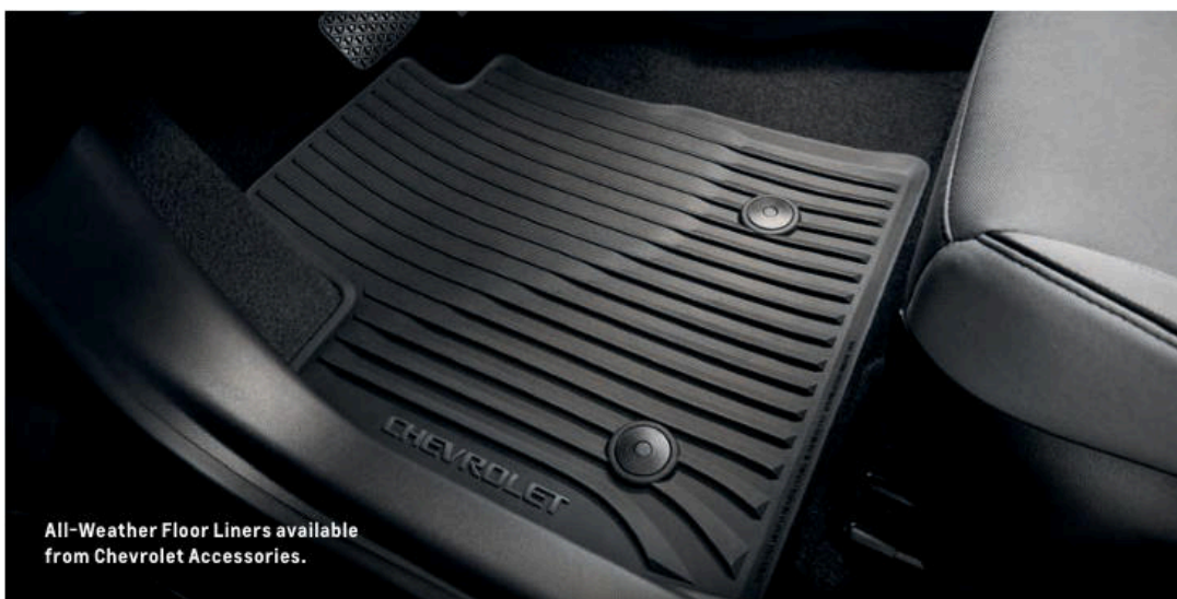
All-Weather Floor Liners available from Chevrolet Accessories.