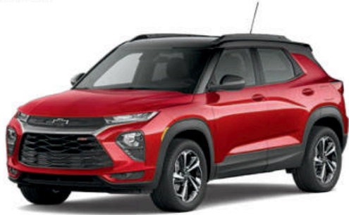
Scarlet Red Metallic 2,3