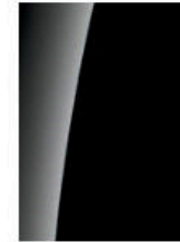
Mosaic Black Metallic/ Mosaic Black Metallic