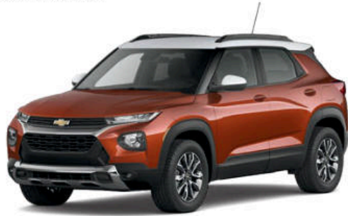
Dark Copper Metallic 2,4