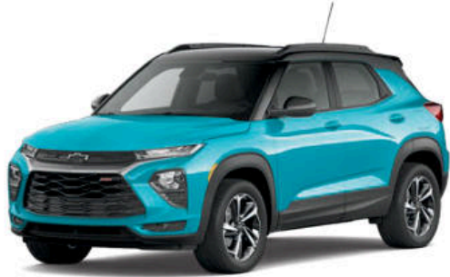
Oasis Blue 6