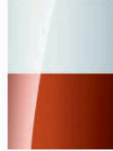
Summit White/ Dark Copper Metallic