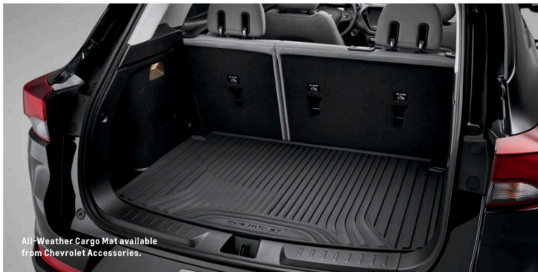
All-Weather Cargo Mat available from Chevrolet Accessories.