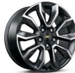
17" High-Gloss Black Machined-Aluminum Wheels Standard on ACTIV

Steering wheel – 3-spoke, leather-wrapped