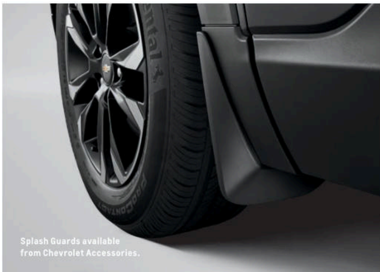
Splash Guards available from Chevrolet Accessories.