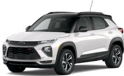
Iridescent Pearl Tricoat 1,2