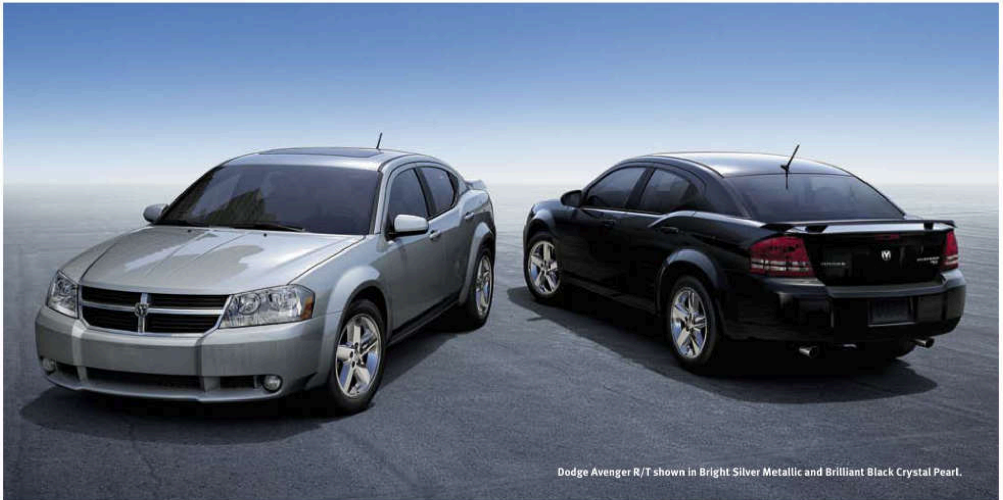
Dodge Avenger R/T shown in Bright Silver Metallic and Brilliant Black Crystal Pearl.