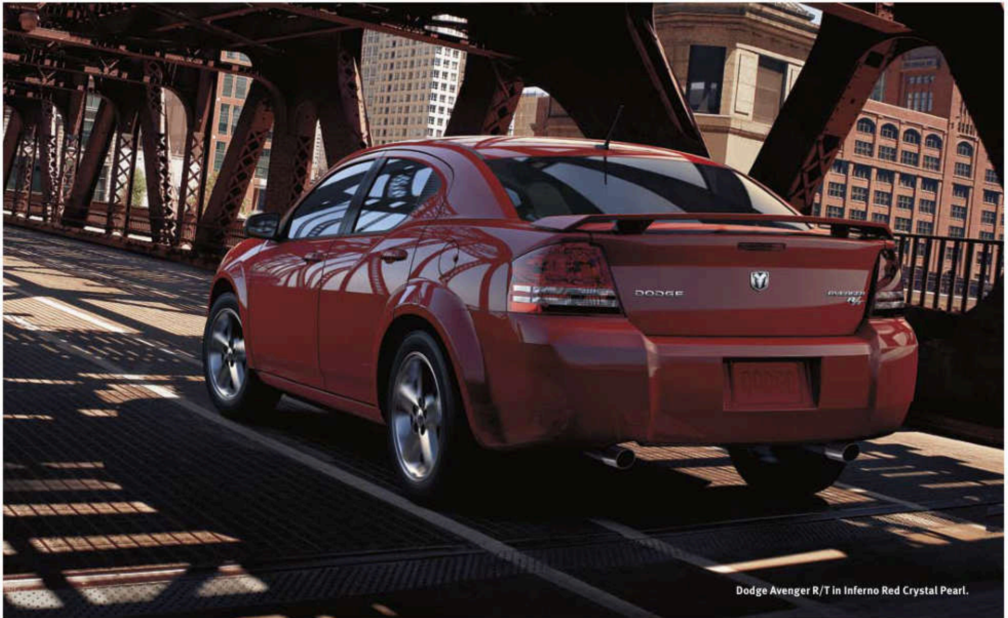
Dodge Avenger R/T in Inferno Red Crystal Pearl.

ATTITUDE REQUIRES POWER. BRAINS REQUIRE EFFICIENCY. The available 3.5-liter V6 on R/T puts out 235 horsepower and 232 lb-ft of torque and comes with a 6-speed AutoStick ® transaxle with more ratios for a more efficient driving cycle. The 6-speed AutoStick transaxle on Avenger R/T is the domestic industry's first fully electronic, real-time-control 6-speed automatic transmission. It offers automatic and manual shifting, better acceleration, smoother shifts, and a quiet ride. Leaving no doubt that Avenger R/T with the available 3.5-liter engine is the total package, it also features a rear spoiler, 18-inch Motive ultra-brite aluminum wheels, all-season performance tires, fog lamps, a dual exhaust with chrome tips, and a sport-tuned suspension.