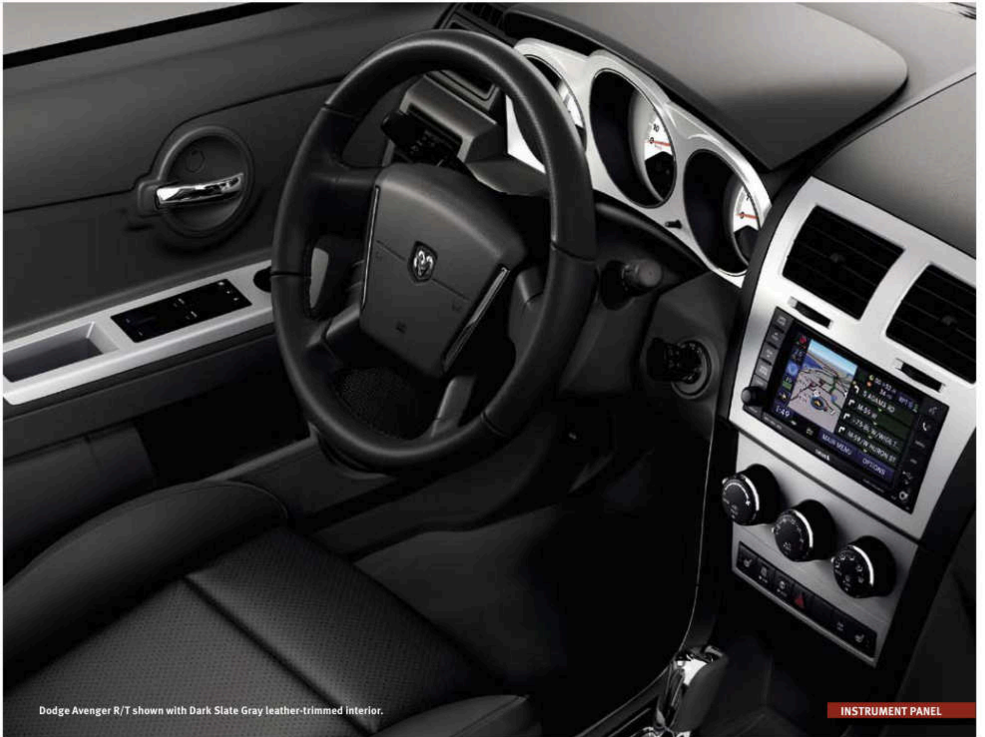
Dodge Avenger R/T shown with Dark Slate Gray leather-trimmed interior.