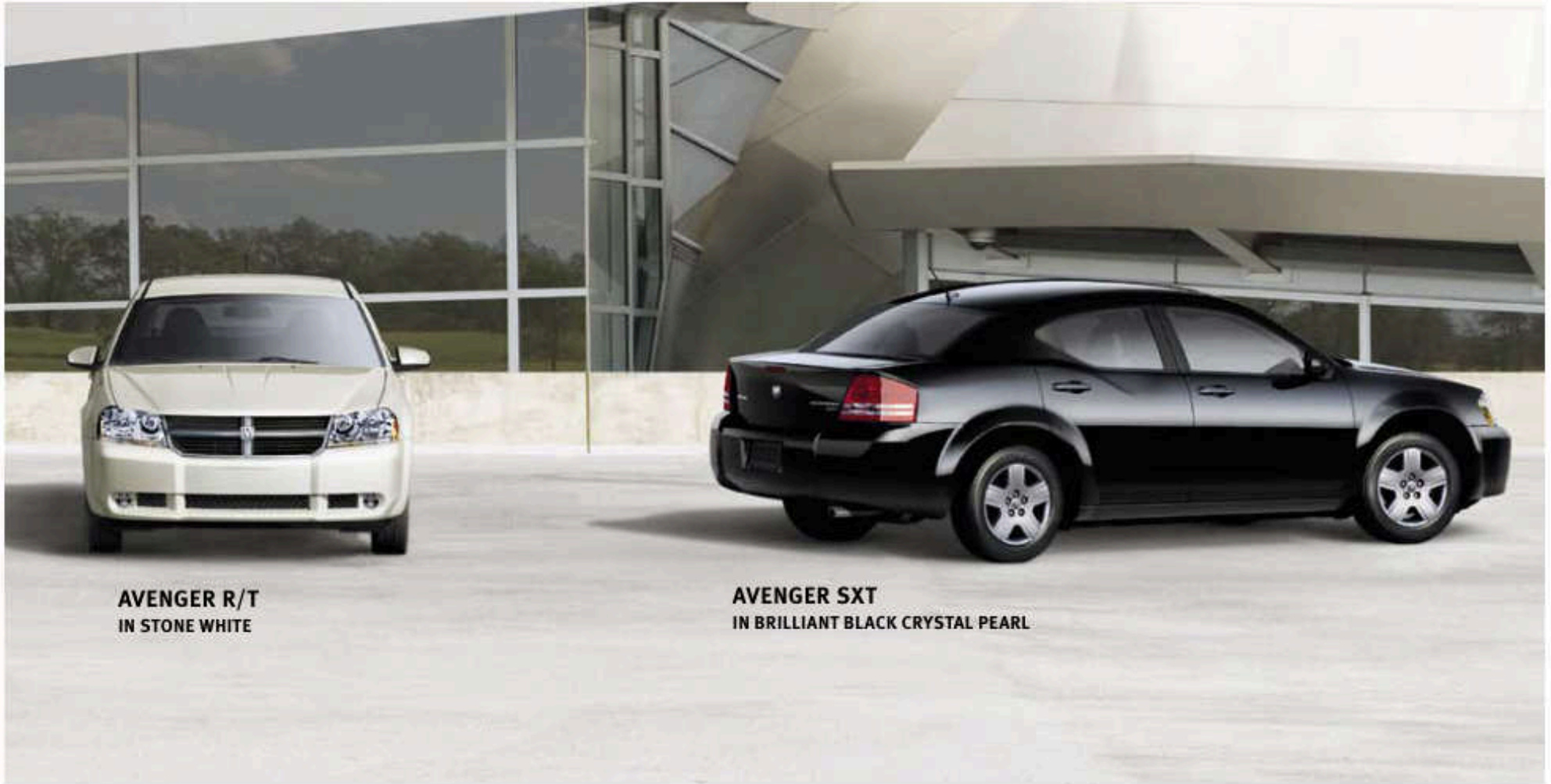
AVENGER R/T IN STONE WHITE