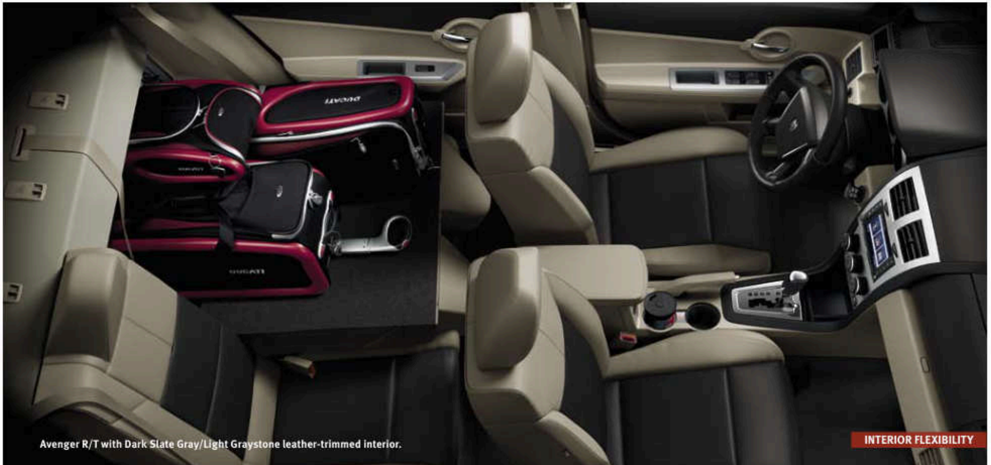
Avenger R/T with Dark Slate Gray/Light Graystone leather-trimmed interior.