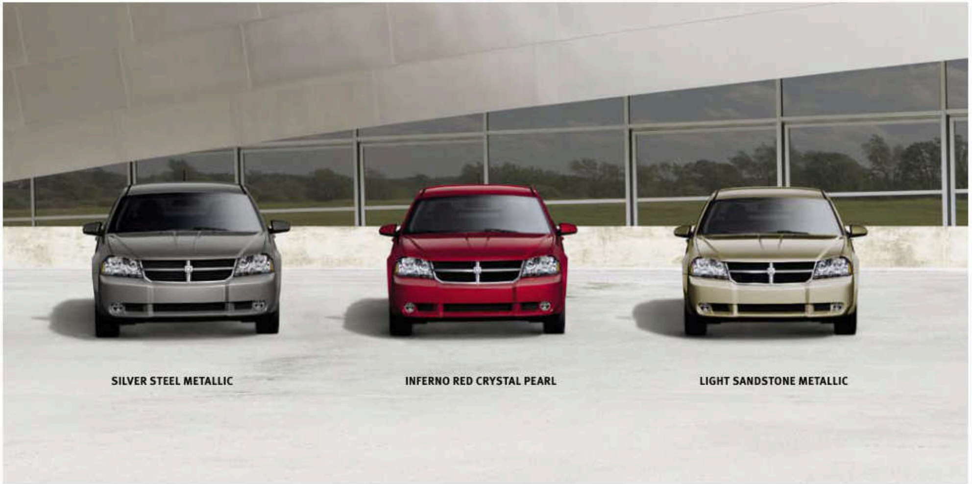
SILVER STEEL METALLIC