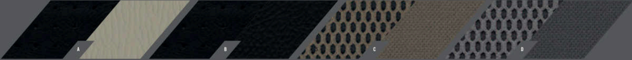
AVENGER INTERIOR COLORS: A) Radar Perforated Leather Trim/Sutton Vinyl in Dark Slate Gray/Light Graystone B) Radar Perforated Leather Trim/Sutton Vinyl in Dark Slate Gray C) Canyons/Racine Premium Stain-Resistant Cloth in Medium Khaki D) Canyons/Racine Premium Stain-Resistant Cloth in Dark Slate Gray