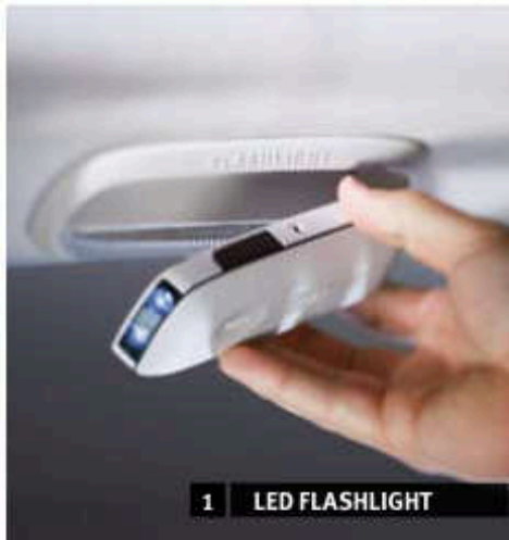
1 LED FLASHLIGHT