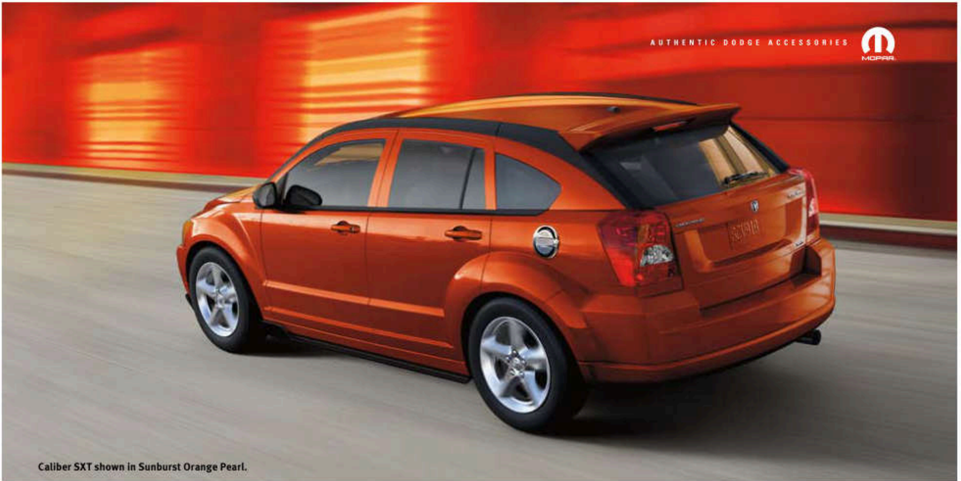
Caliber SXT shown in Sunburst Orange Pearl.

AUTHENTIC DODGE ACCESSORIES. When you enhance your Caliber with Authentic Dodge Accessories by Mopar, you gain far more than substantial style, premium protection, powerful performance or extreme entertainment. You also benefit from the authentic difference found only in an original equipment accessory. It's a difference you'll recognize in the higher standards and tighter tolerances required of original equipment accessories. And one you'll appreciate in our stricter testing measures, from impact performance tests to harsh on- and off-road durability testing. Choose the full line of accessories that feature a fit, finish and functionality designed specifically for your Caliber.