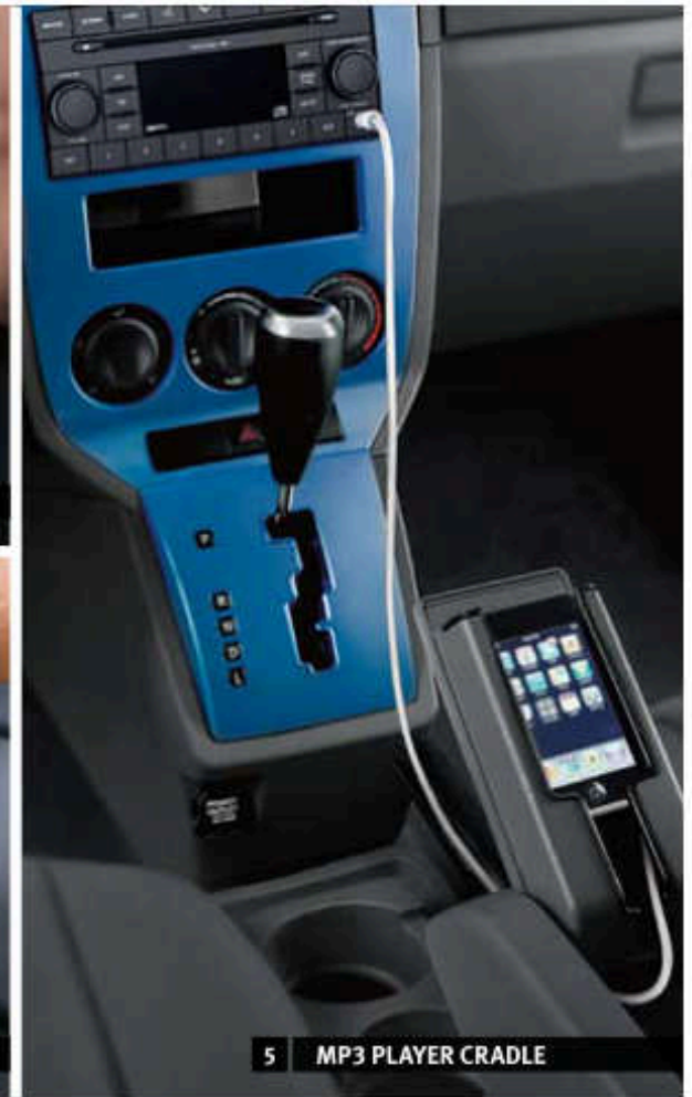
5 MP3 PLAYER CRADLE