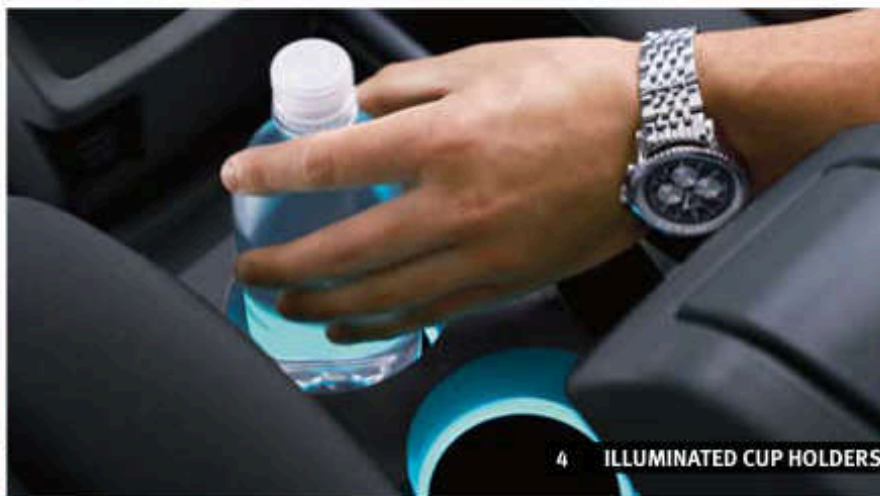
4 ILLUMINATED CUP HOLDERS