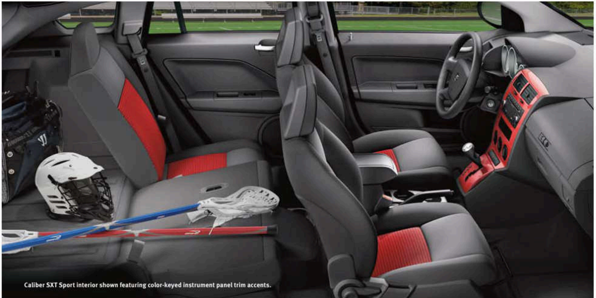
Caliber SXT Sport interior shown featuring color-keyed instrument panel trim accents.

SEATING OPTIONS. Inside Caliber you'll find seating flexibility as varied as the things you can carry.