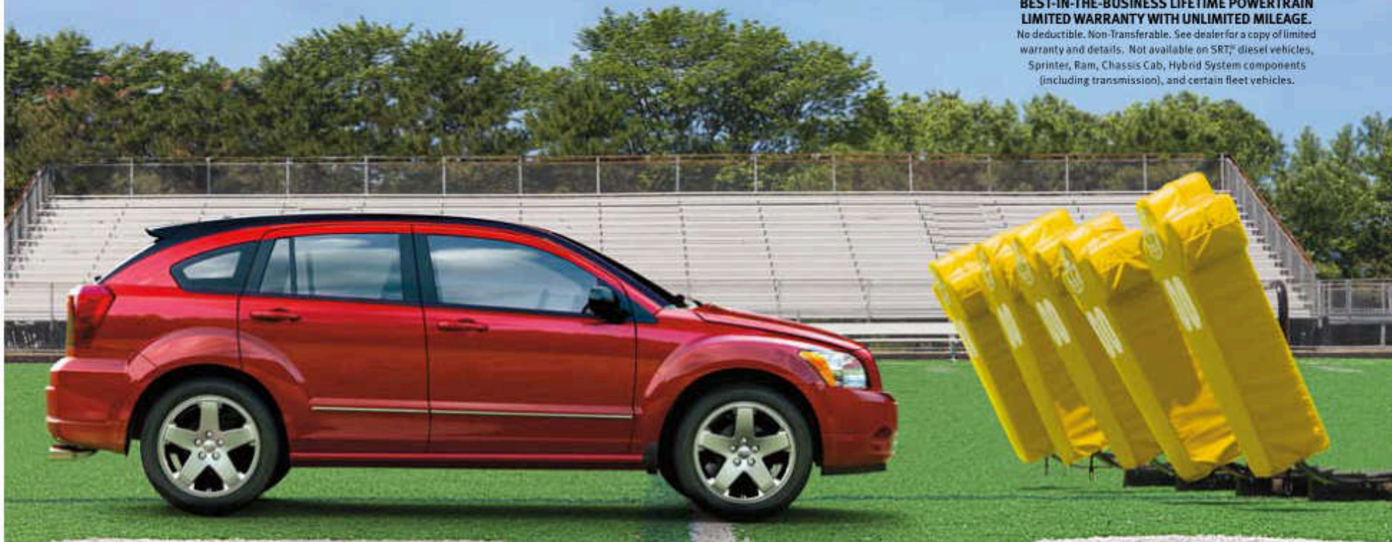
Caliber R/T shown in Inferno Red Crystal Pearl.

No deductible. Non-Transferable. See dealer for a copy of limited warranty and details. Not available on SRT ® diesel vehicles, Sprinter, Ram, Chassis Cab, Hybrid System components (including transmission), and certain fleet vehicles.