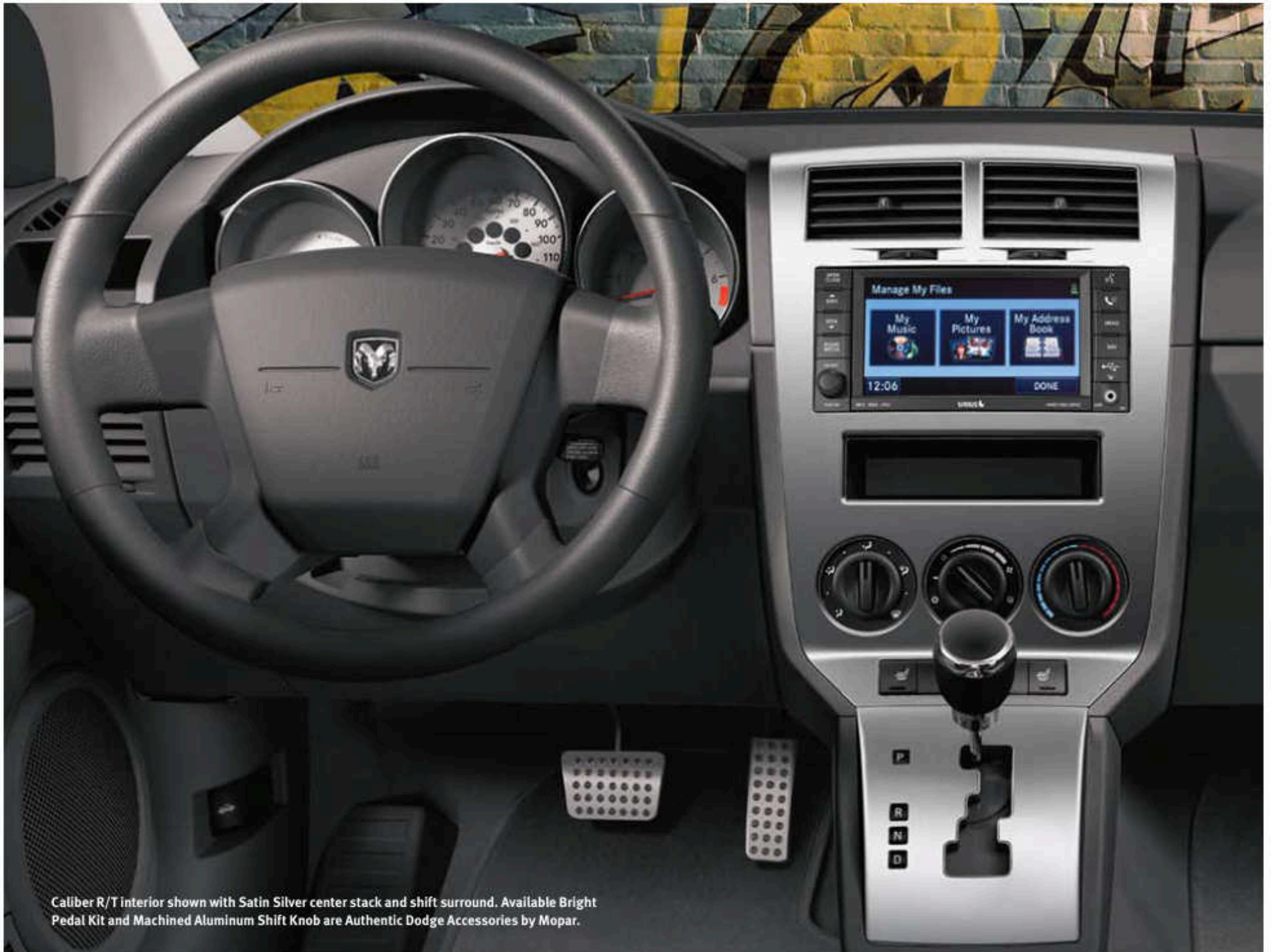
Caliber R/T interior shown with Satin Silver center stack and shift surround. Available Bright Pedal Kit and Machined Aluminum Shift Knob are Authentic Dodge Accessories by Mopar.