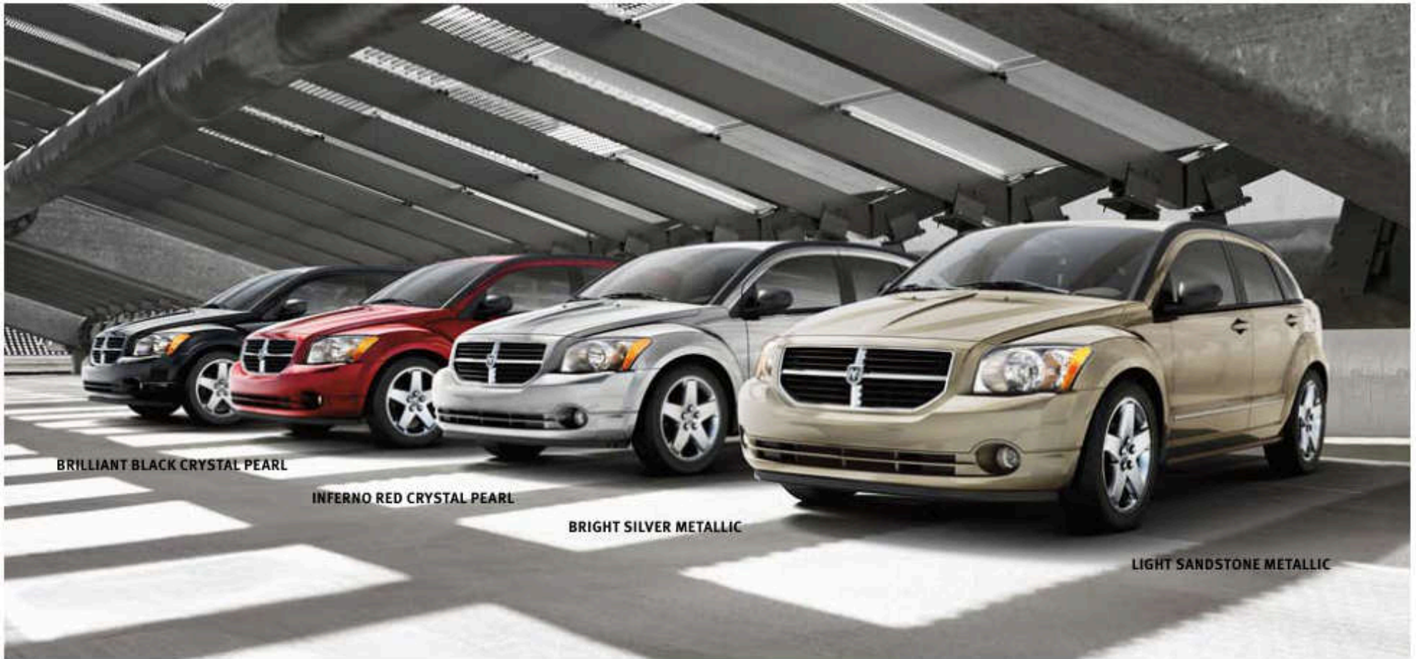
BRILLIANT BLACK CRYSTAL PEARL