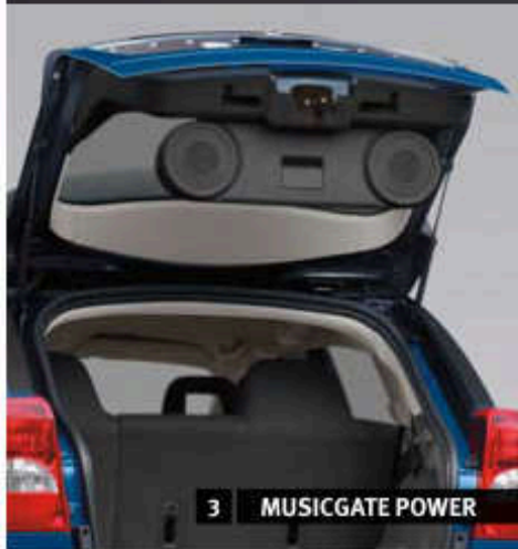
3 MUSICGATE POWER