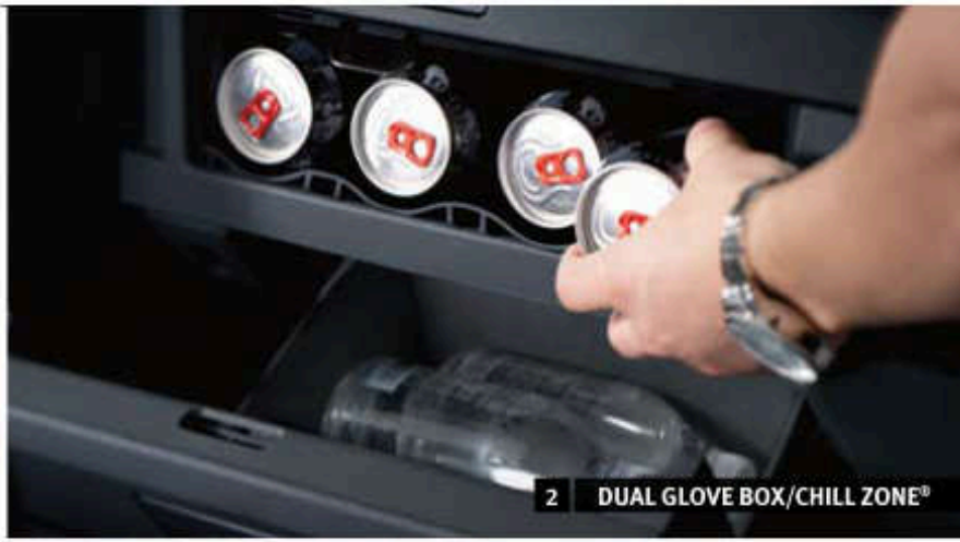
2 DUAL GLOVE BOX/CHILL ZONE®