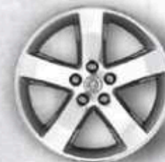
18-inch Cast Aluminum. Standard on R/T. Optional on SE.