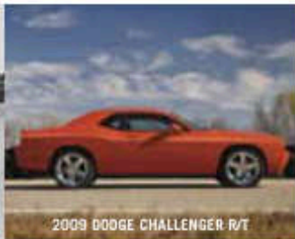
2009 DODGE CHALLENGER R/T