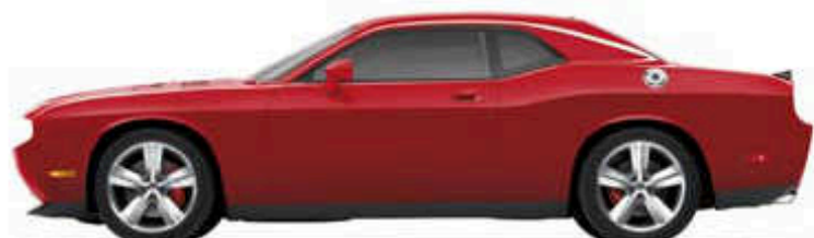
Challenger SRT8 shown in TorRed