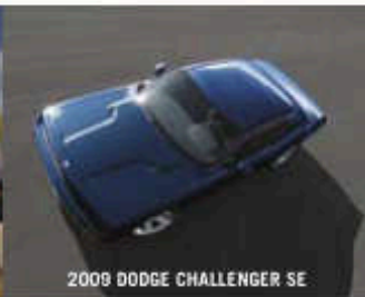
2009 DODGE CHALLENGER SE