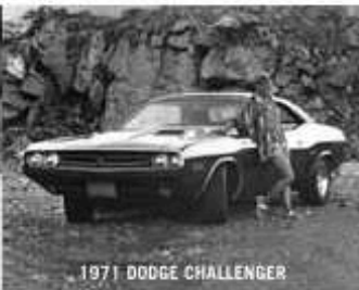
1971 DODGE CHALLENGER