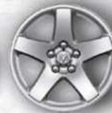
17-inch Machined-Face Aluminum. Standard on SE.