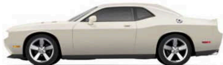
Challenger R/T shown in Stone White