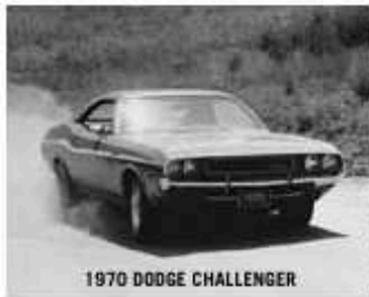
1970 DODGE CHALLENGER