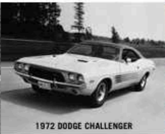
1972 DODGE CHALLENGER