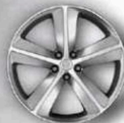
20-inch SRT® Forged Aluminum. Standard on SRT8®.