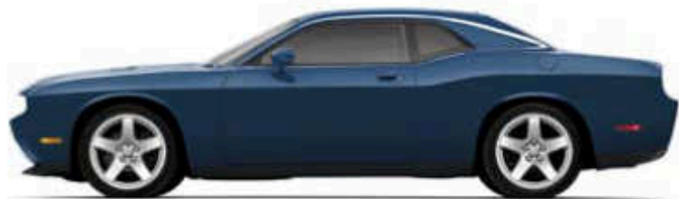
Challenger SE shown in Deep Water Blue Metallic