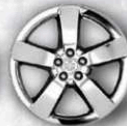
20-inch Chrome-Clad Cast Aluminum. Optional on R/T.