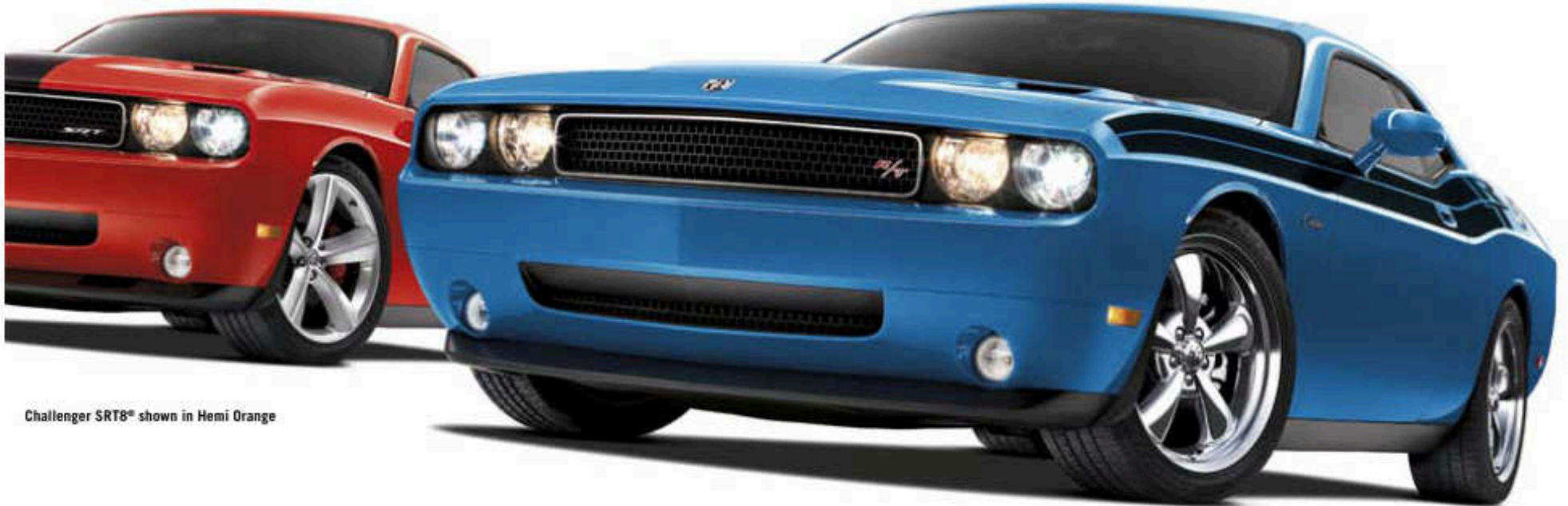
Challenger SRT8 ® shown in Hemi Orange

Those looking to offer a tribute to the 1970s' original need look no further than a Challenger R/T Classic 111 or SRT8 ® Spring Special 111 clad exclusively in B5 Blue from the Chrysler paint code archives. The R/T Classic's scripted fender badge is a nod to the sire that started it all. It features a vented performance hood that increases airflow while cooling the 5.7-liter VVT HEMI ® V8. The polished chrome 20-inch Heritage wheels may be right-now in size, but they're pure throwback in style, along with the wide-side stripe. Clad an SRT8 in B5 Blue and it will be decked with a performance hood that gives its 6.1-liter HEMI SRT ® V8 engine some breathing room. Like eye black on a lineman's cheekbones or paint on a Tomcat's nosecone, the SRT8 hood is knocked down in a matte black hood stripe and is ready for battle. Its interior, however, turns it right back up with blue accents on its performance-bolstered seatbacks.