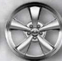
20-inch Polished Heritage. Standard on R/T Classic.