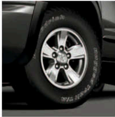
16-inch Painted Cast Aluminum Wheel (Available on ST)