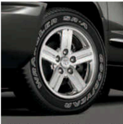
18-inch Chrome-Clad Aluminum Wheel (Available on Laramie)