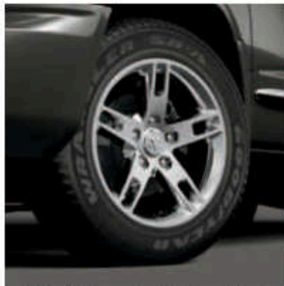
18-inch Chrome Cast Aluminum Wheel (Authentic Accessory by Mopar®)