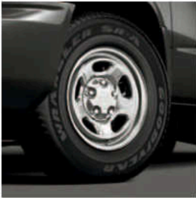
16-inch Styled Steel Wheel (Standard on ST)