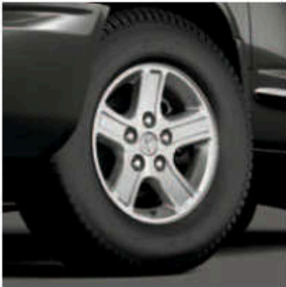
17-inch Cast Aluminum Machined Wheel (Standard on Big Horn/Lone Star)