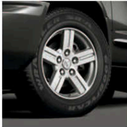
18-inch Painted Cast Aluminum Wheel (Standard on Laramie, Available on Big Horn/Lone Star)