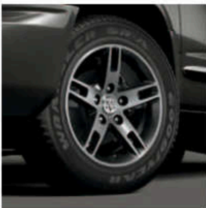
18-inch Machined-Face, Black Pocket Chrome Cast Aluminum Wheel (Authentic Accessory by Mopar®)