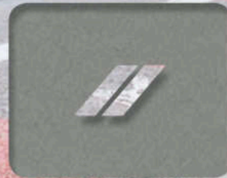
BILLET SILVER METALLIC