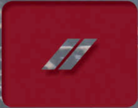
REDLINE RED 2 COAT PEARL