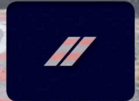
TRUE BLUE PEARL