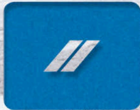
LASER BLUE PEARL