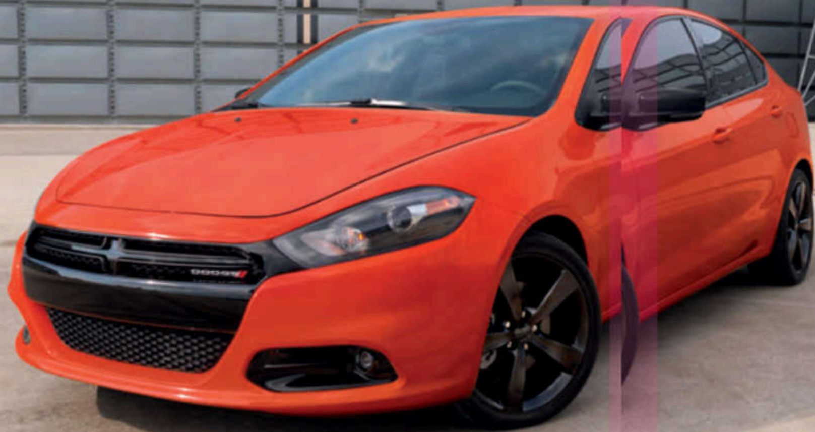
← //// Dart Blacktop shown in Vitamin C.