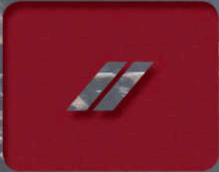
REDLINE RED 2 COAT PEARL