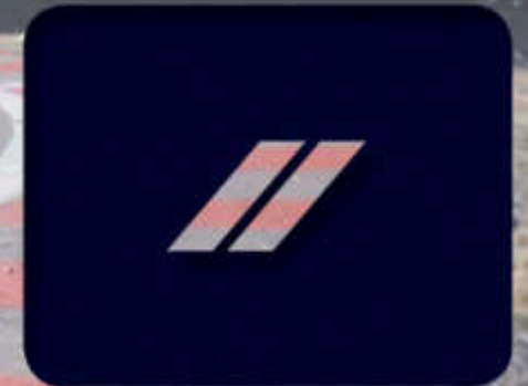
TRUE BLUE PEARL