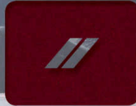
PASSION RED PEARL