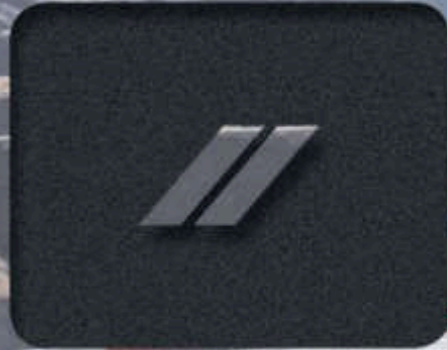
GRANITE CRYSTAL METALLIC