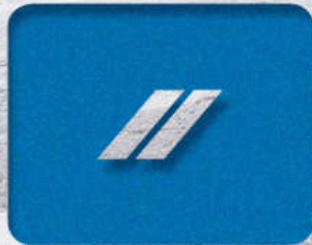
LASER BLUE PEARL