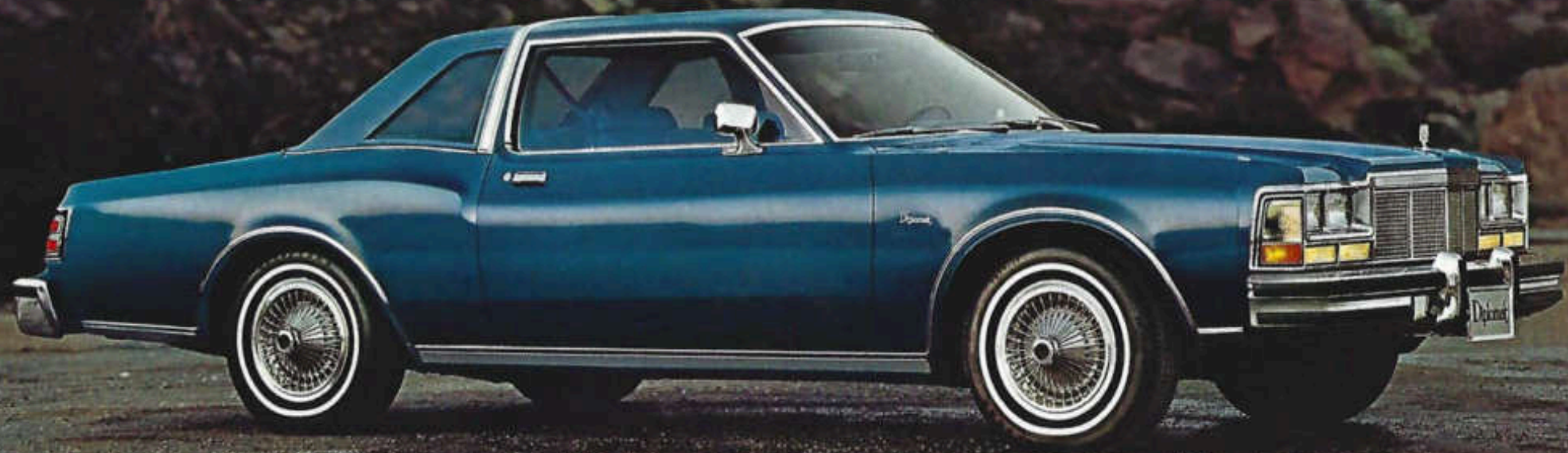
The Diplomat: the two-door.