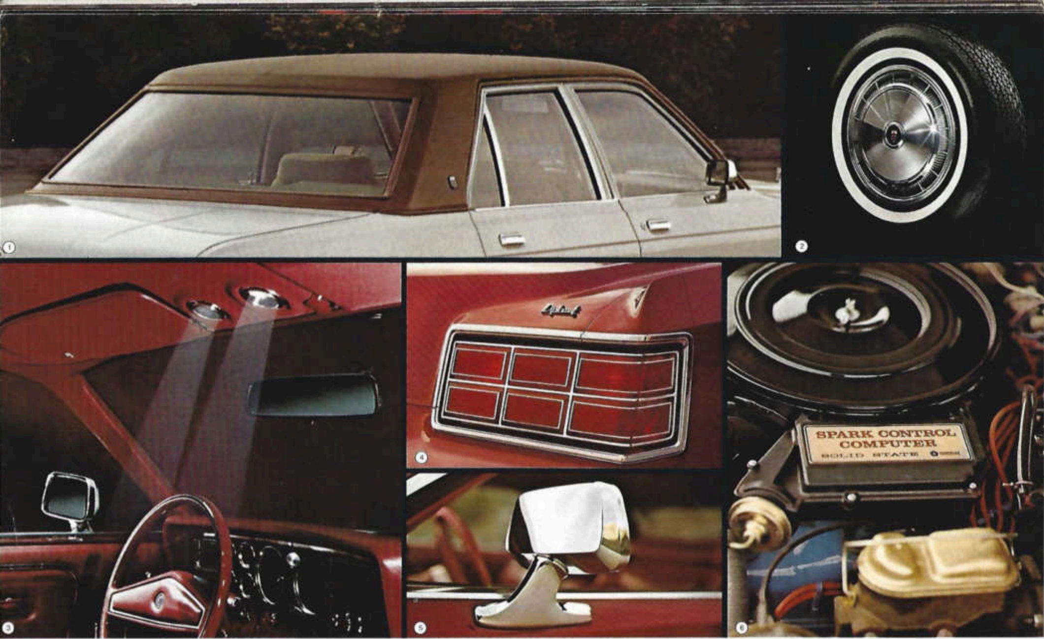
The Truest Test of a Luxury Car? Its Standard Equipment.