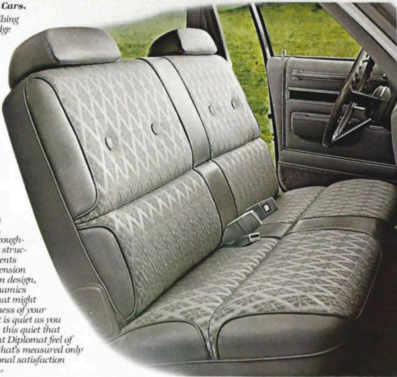
Upper left: Optional vinyl bench seat for Diplomat two-door. Above: Standard Diplomat cloth-and-vinyl bench seat.