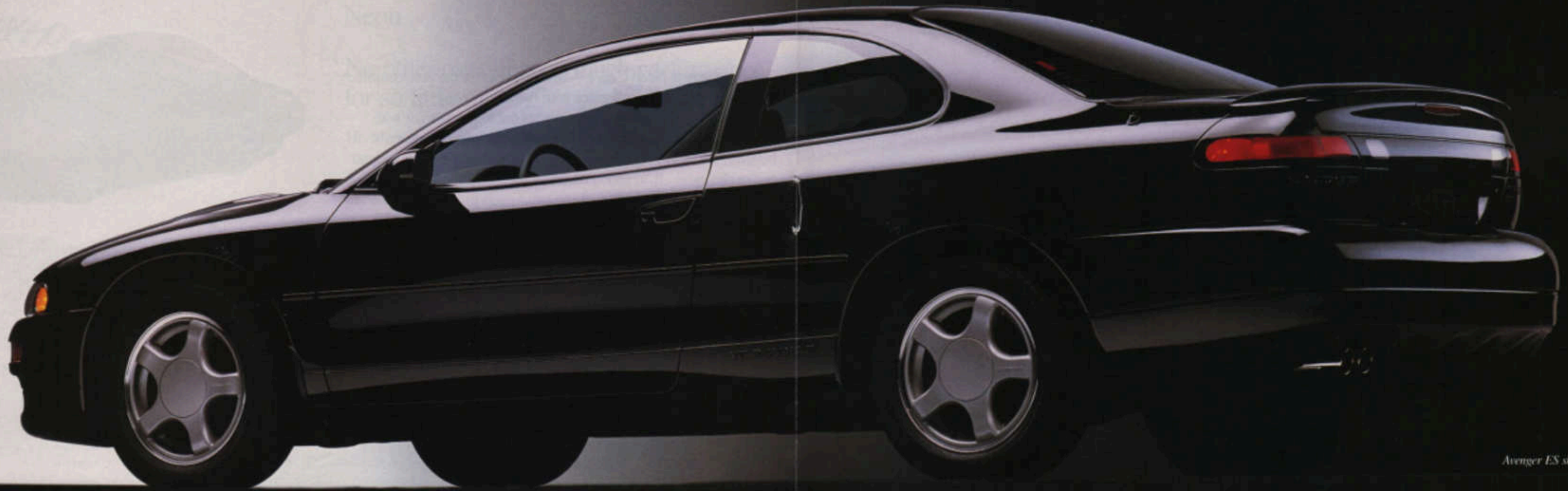
Avenger ES shown in Black.