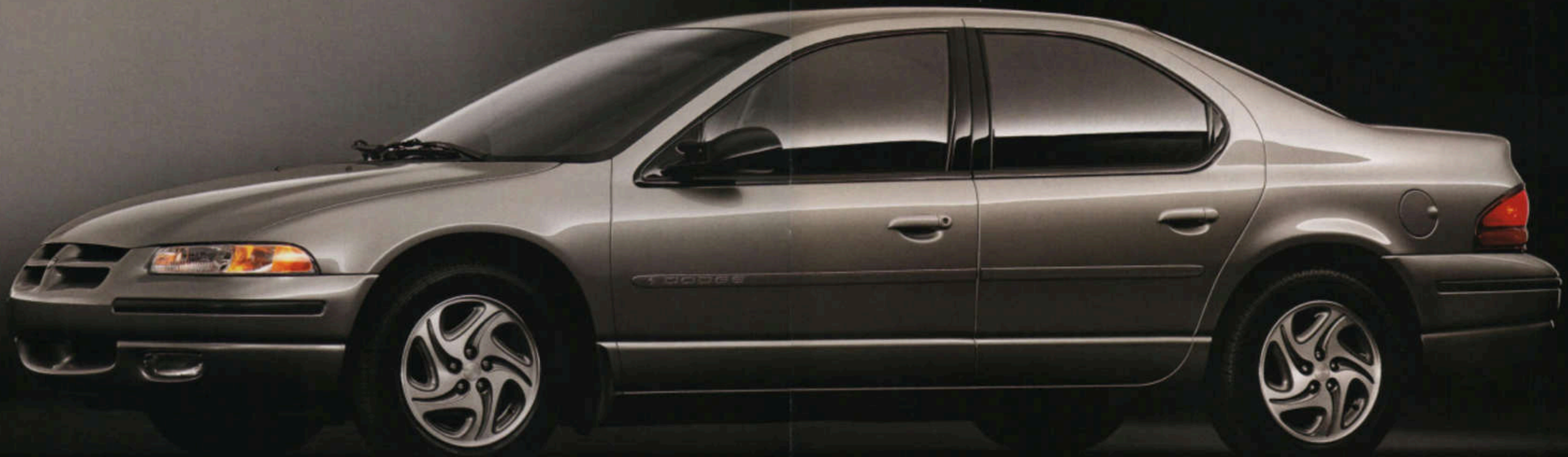
Stratus ES shown in Light Silver Fern.