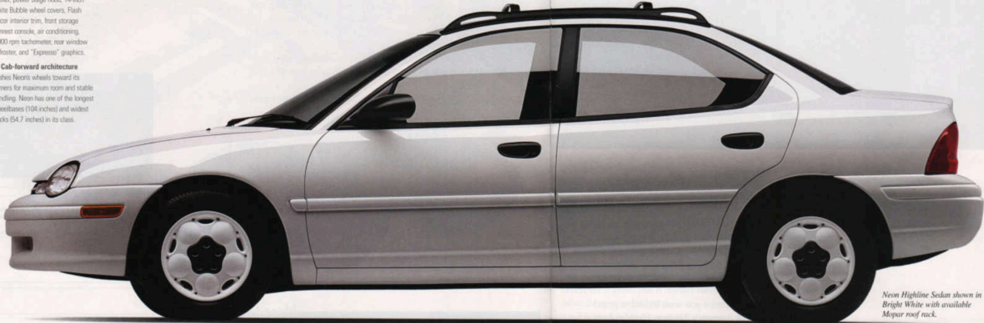
Neon Highline Sedan shown in Bright White with available Mopar roof rack.

■ Neon's standard five-speed manual transaxle offers added performance and control with smooth, positive shifting and short throws. An automatic transaxle is also available.