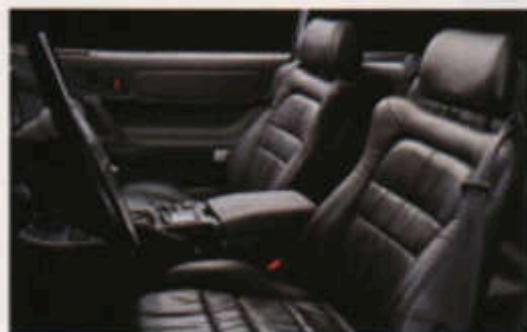
▲ Stealth's driver-tuned cockpit features full analog instrumentation, leather-wrapped steering wheel and short-throw shift lever on the center console.

If that's too much temptation, consider the 222-horsepower Stealth R/T or the 164-horsepower base Stealth.