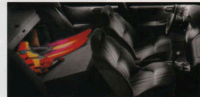
▲ The rear seatback folds down to increase the carrying capacity of a large 15.7-cubic-foot trunk. ES cloth interior is shown (center) in Silver Fern.

Test-drive the hot-handling sport sedan that feeds your desire to push it to the limit without overlooking your need for safety, comfort and reliability.