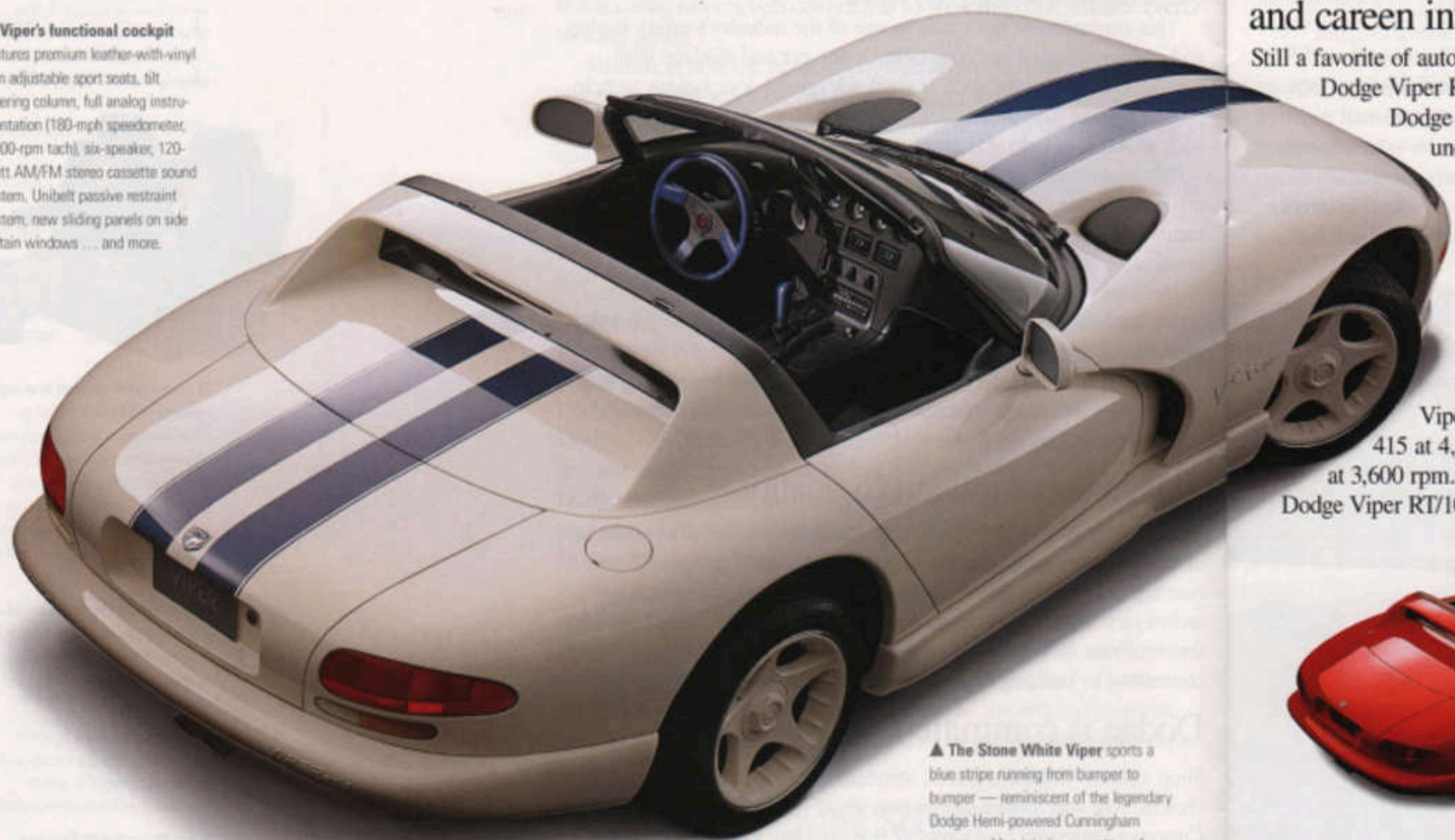
▲ The Stone White Viper sports a blue stripe running from bumper to bumper — reminiscent of the legendary Dodge Hemi-powered Cunningham racers — blue interior accents, and white five-spoke wheels.

features premium leather-with-vinyl trim adjustable sport seats, tilt steering column, full analog instrumentation (180-mph speedometer, 7,000-rpm tach), six-speaker, 120-watt AM/FM stereo cassette sound system, Unibelt passive restraint system, new sliding panels on side curtain windows ... and more.