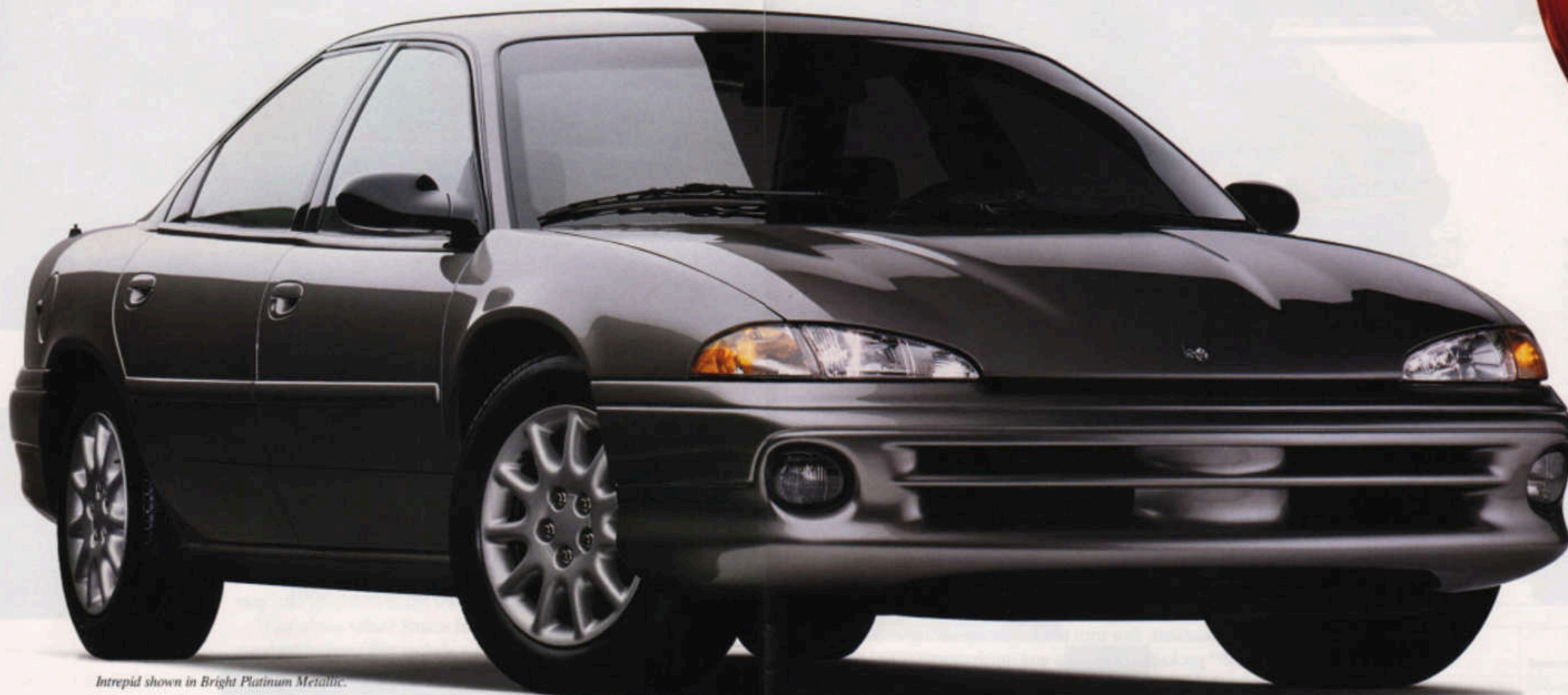
Intrepid shown in Bright Platinum Metallic.

■ An electronically controlled automatic overdrive transaxle is standard with both Intrepid engines to optimize shift points for all four forward gears.