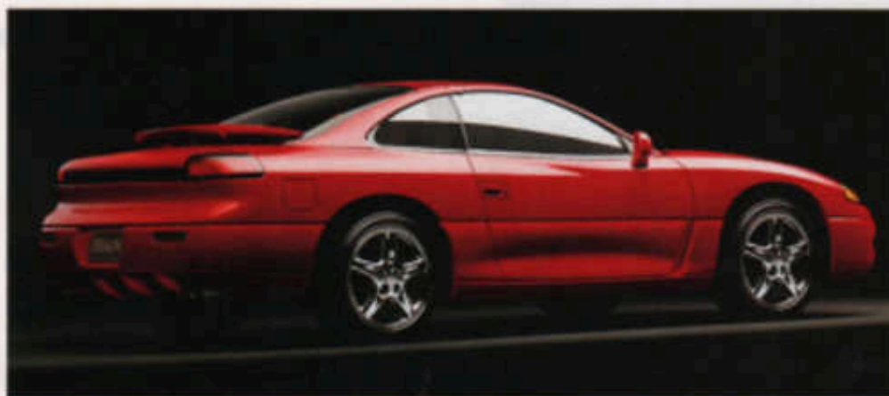
▲ Stealth R/T Turbo shown in Firestorm Red with available chrome-plated 18-inch x 8.5-inch wheels.