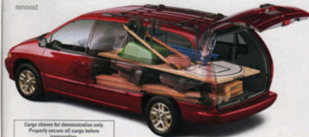
Cargo shown for demonstration only. Properly secure all cargo before transporting.

▼ We added more horses and quieted them down. In addition to kicking out more horsepower, the engines offered on the 1996 Dodge Caravan are among the quietest of any minivan.