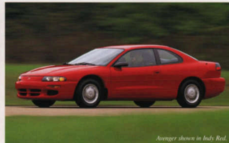
Avenger shown in Indy Red.

■ A four-wheel antilock braking system is standard on Avenger ES and available on Avenger for improved steering control during emergency braking conditions.