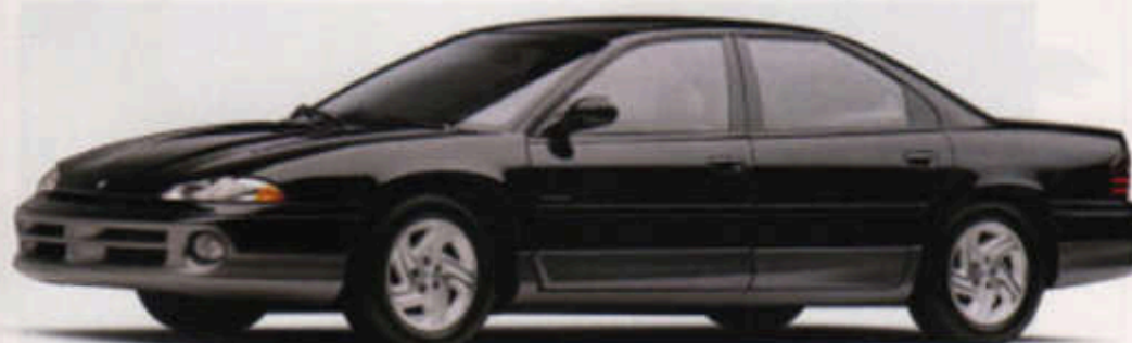
Intrepid ES shown in Black.