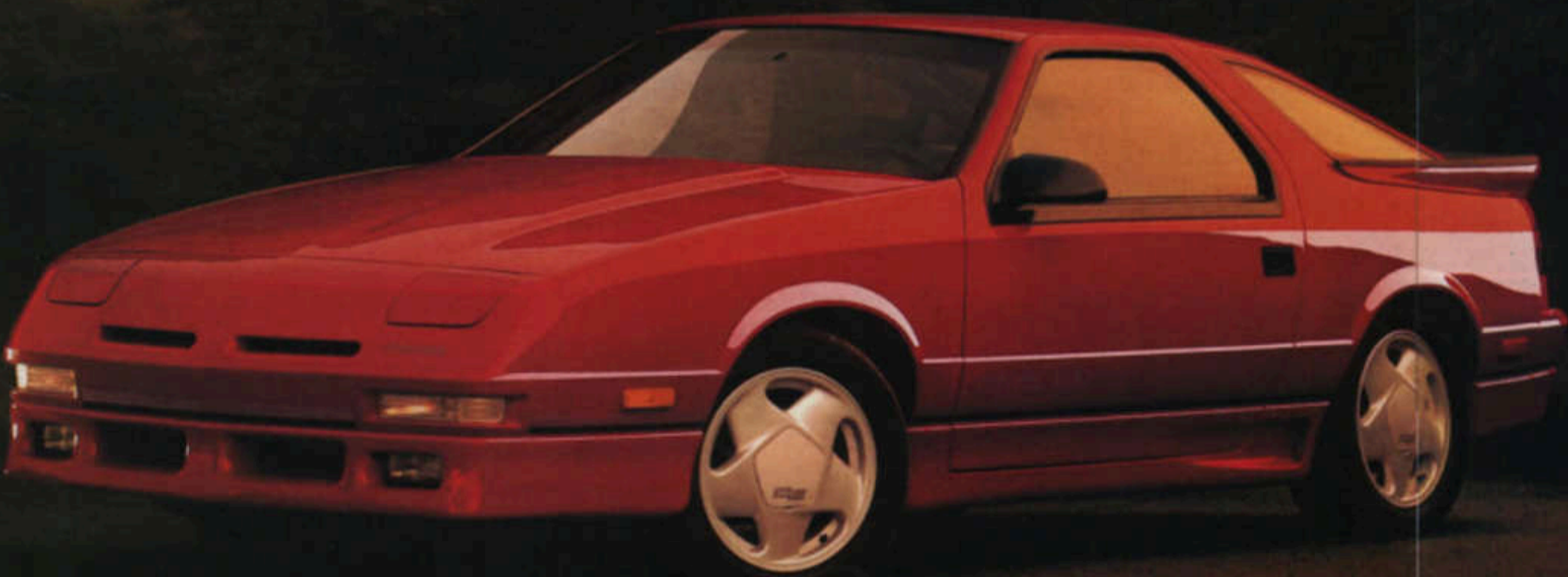
Daytona Shelby is shown above in Flash Red Clear Coat

All Daytona models offer new racing-inspired cockpits for 1990. Redesigned instrument panels. Contoured reclining performance buckets. Sport steering wheel. New overhead† and floor consoles. First-class accommodations all the way. (Shelby interior shown in optional black leather).