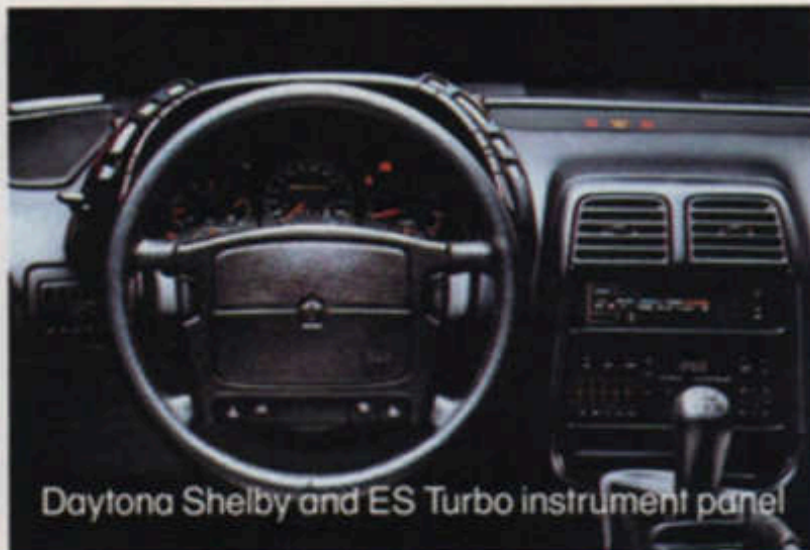
Daytona Shelby and ES Turbo instrument panel