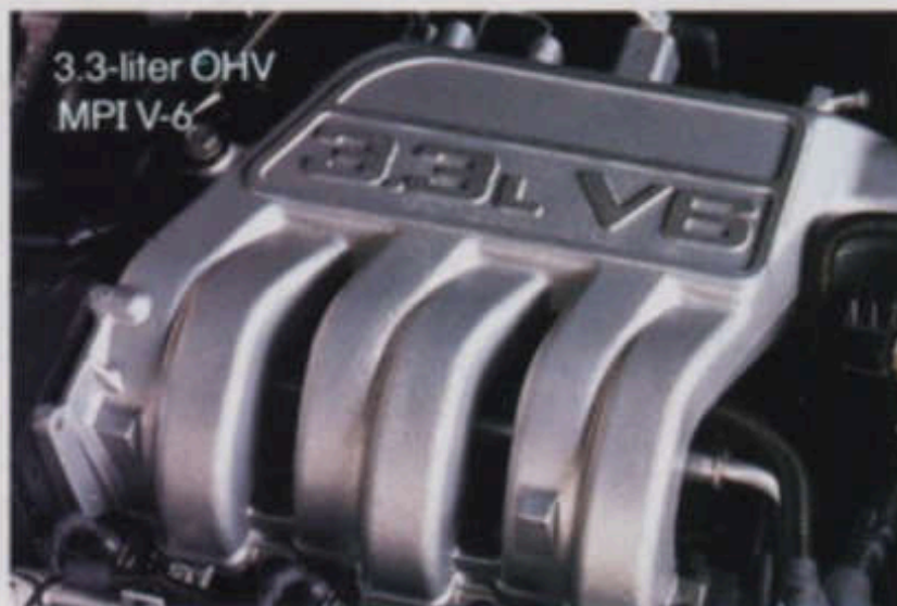
3.3-liter OHV MPI V-6

The Allstate Safety Leadership Award was presented to Chrysler Corporation in recognition of its being the first American carmaker to provide driver-side air bags as standard equipment on all domestic built 1990 Dodge passenger cars.