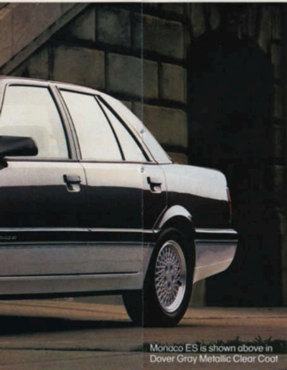
Monaco ES is shown above in Dover Gray Metallic Clear Coat