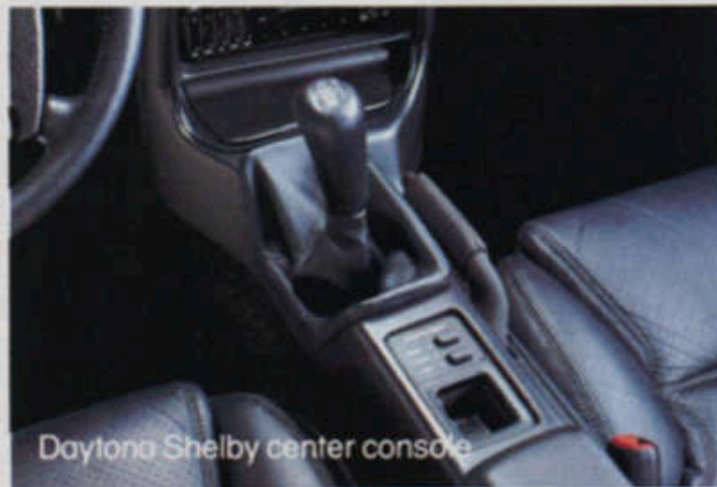
Daytona Shelby center console