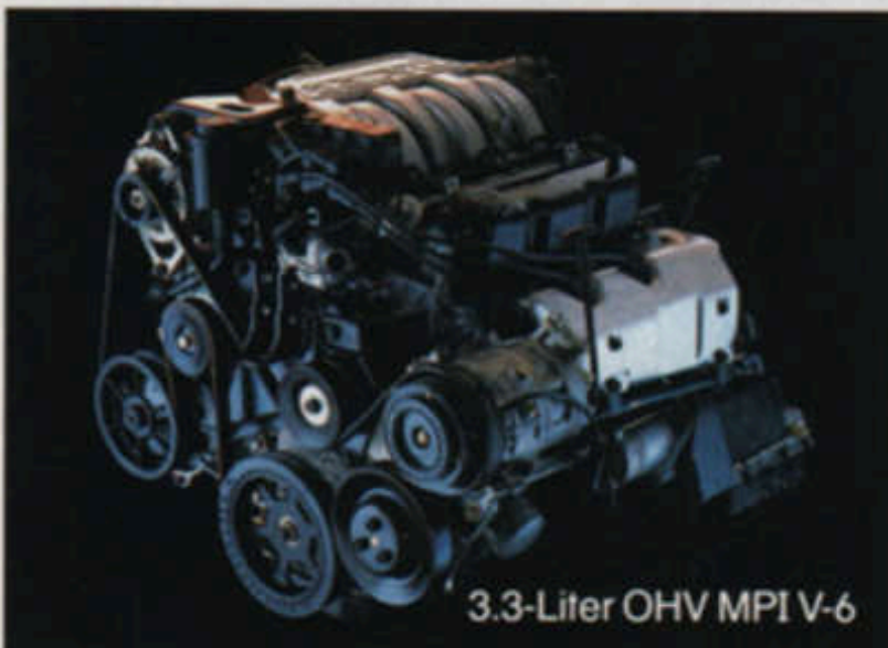
3.3-Liter OHV MPI V-6