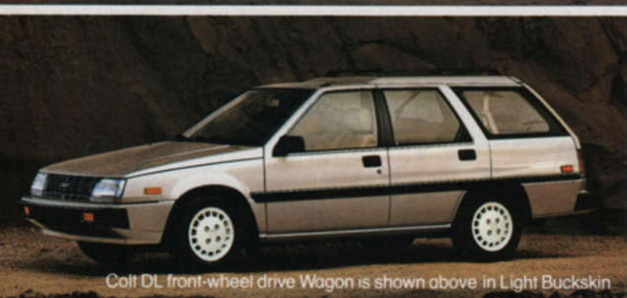
Colt DL front-wheel drive Wagon is shown above in Light Buckskin