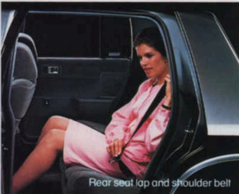
Rear seat lap and shoulder belt