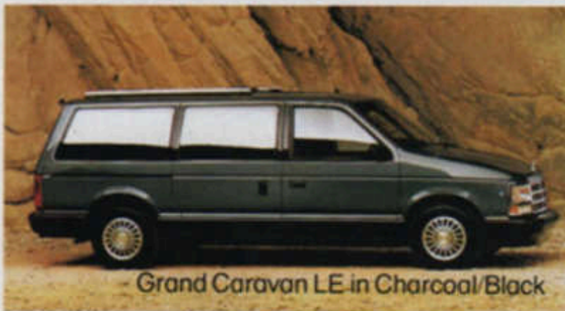
Grand Caravan LE in Charcoal/Black

All Daytona models offer new power windows, cruise control, ABS, redesigned instrument panel with color-coded tachometer, and new bucket seats. Sport steering wheel. New overhead console. New door. The value proposition is all the way. Daily motor show options. Best. Deal.