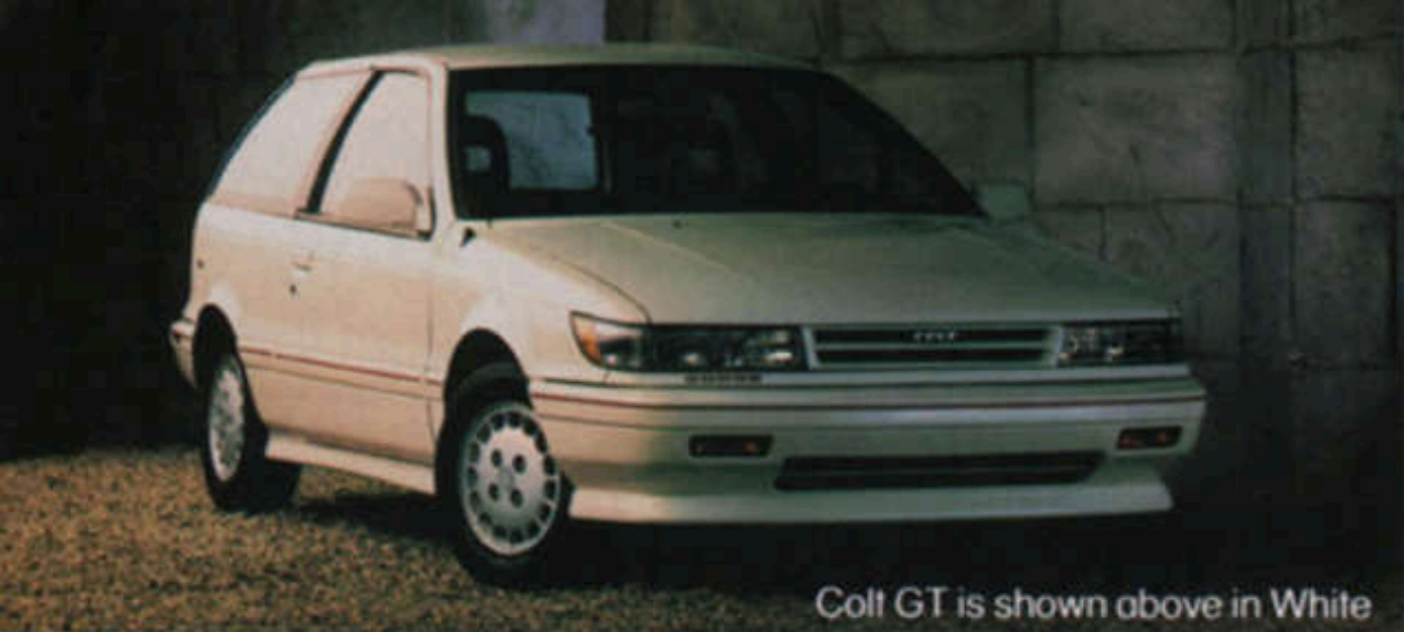
Colt GT is shown above in White