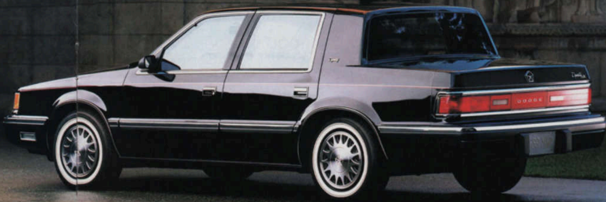
Dynasty LE is shown above in Black Clear Coat