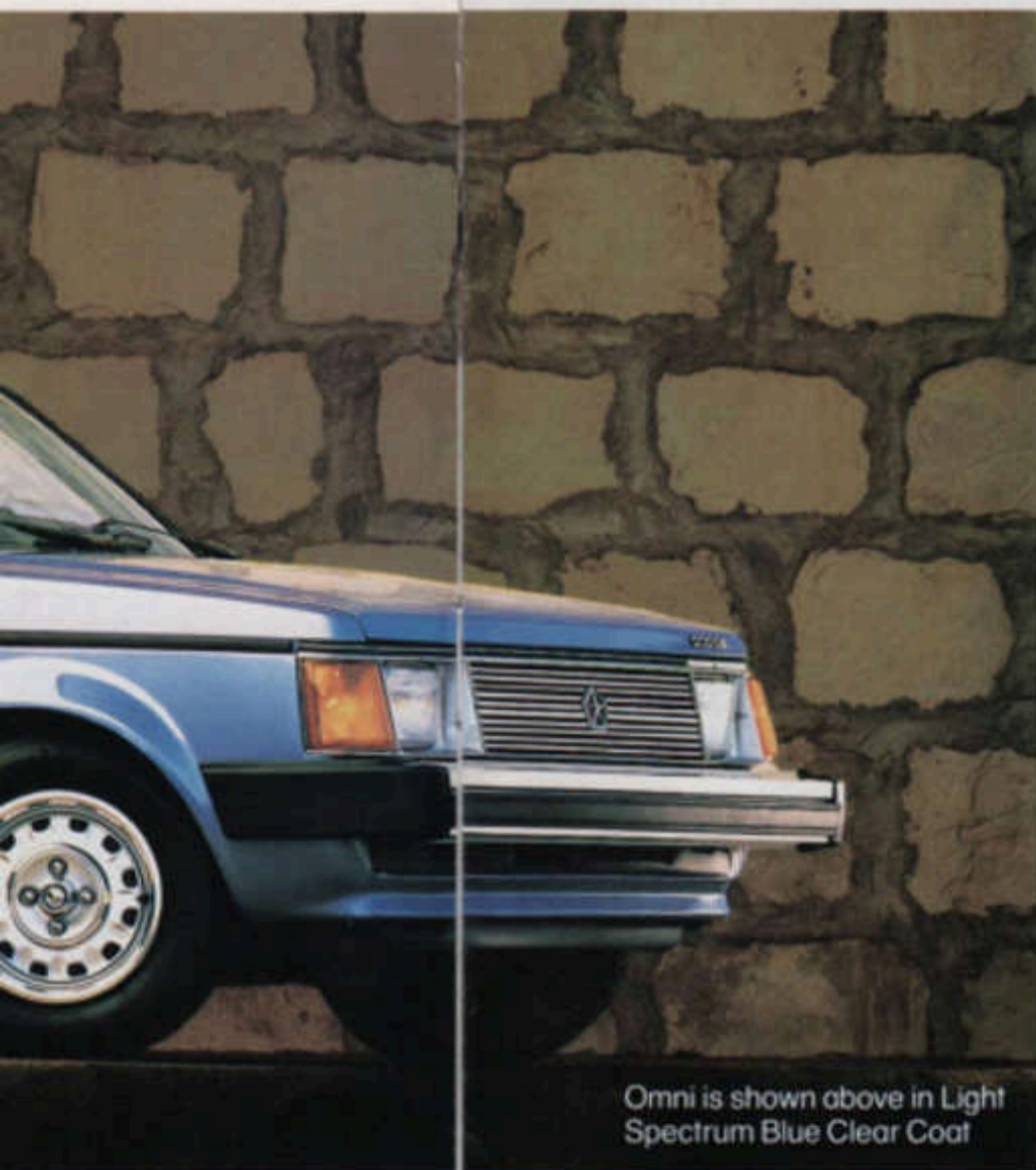
Omni is shown above in Light Spectrum Blue Clear Coat