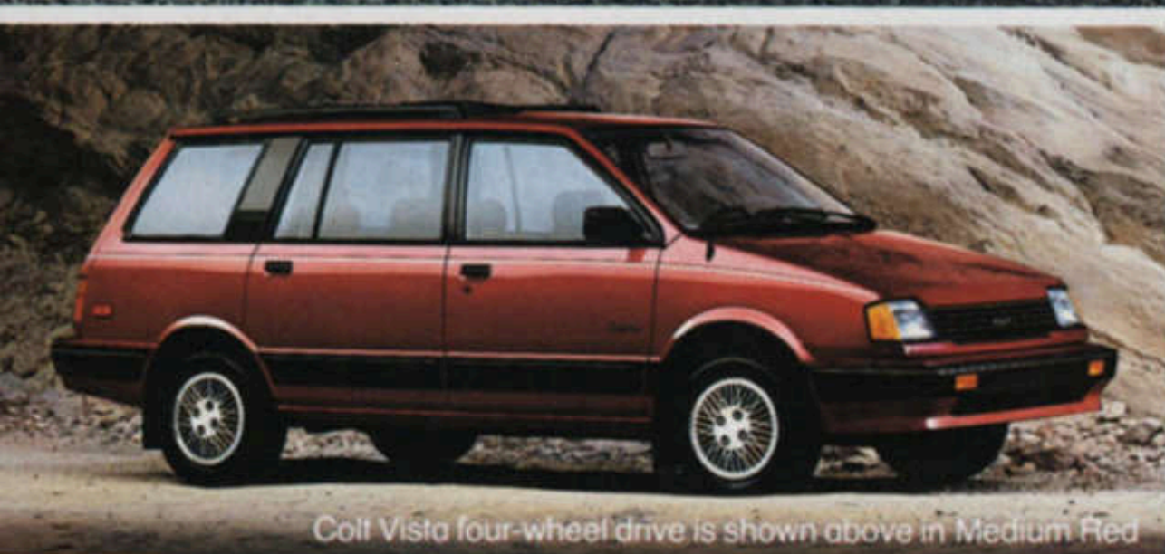
Colt Vista four-wheel drive is shown above in Medium Red