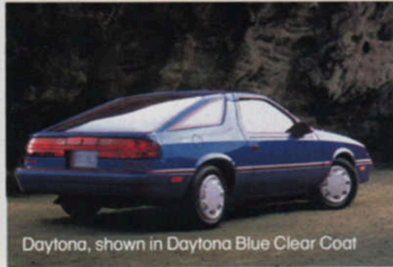
Daytona, shown in Daytona Blue Clear Coat

Daytona ES Turbo: 110 hp, 140 mph, 17.5 sec 0-60, 24.5 mpg city/34 mpg highway. ES Turbo: 110 hp, 140 mph, 17.5 sec 0-60, 24.5 mpg city/34 mpg highway. ES Turbo: 110 hp, 140 mph, 17.5 sec 0-60, 24.5 mpg city/34 mpg highway. ES Turbo: 110 hp, 140 mph, 17.5 sec 0-60, 24.5 mpg city/34 mpg highway.