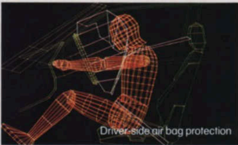
Driver-side air bag protection