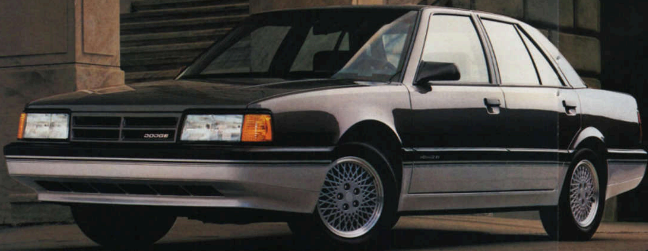
Monaco ES is shown above in Dover Gray Metallic Clear Coat