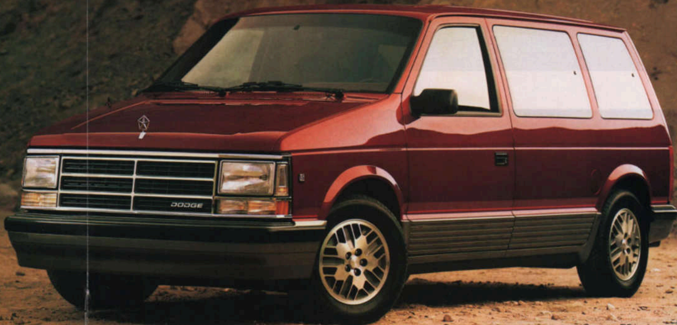
Caravan ES is shown above in Claret Red Pearl Coat