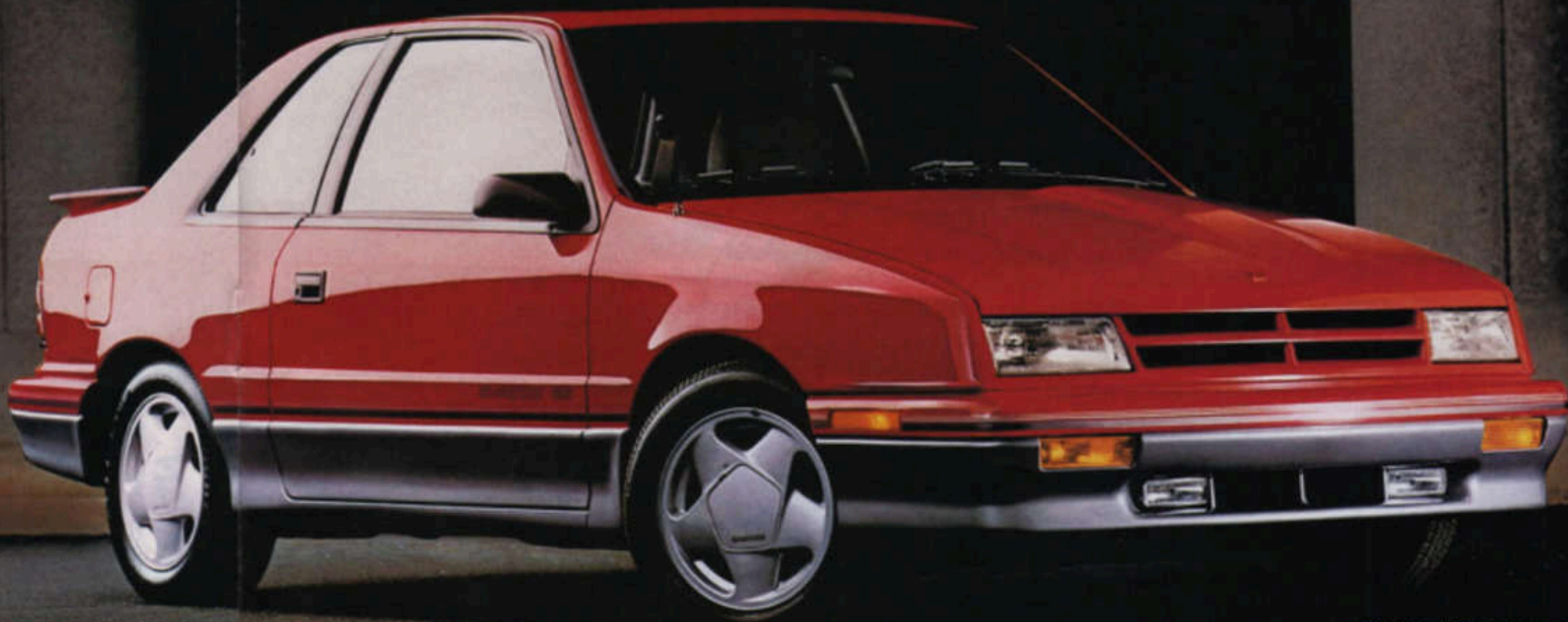
Shadow ES is shown above in Exotic Red Clear Coat

Enter the luxurious world of Monaco ES. Reclining front buckets. Extra-wide limousine-style doors. Leather-wrapped steering wheel. Optional leather seats and power seat controls. And thoughtful touches like an available vehicle maintenance monitor.