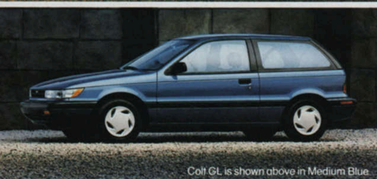
Colt GL is shown above in Medium Blue