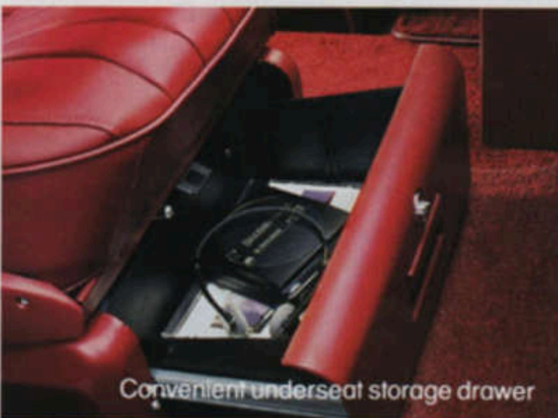
Convenient underseat storage drawer