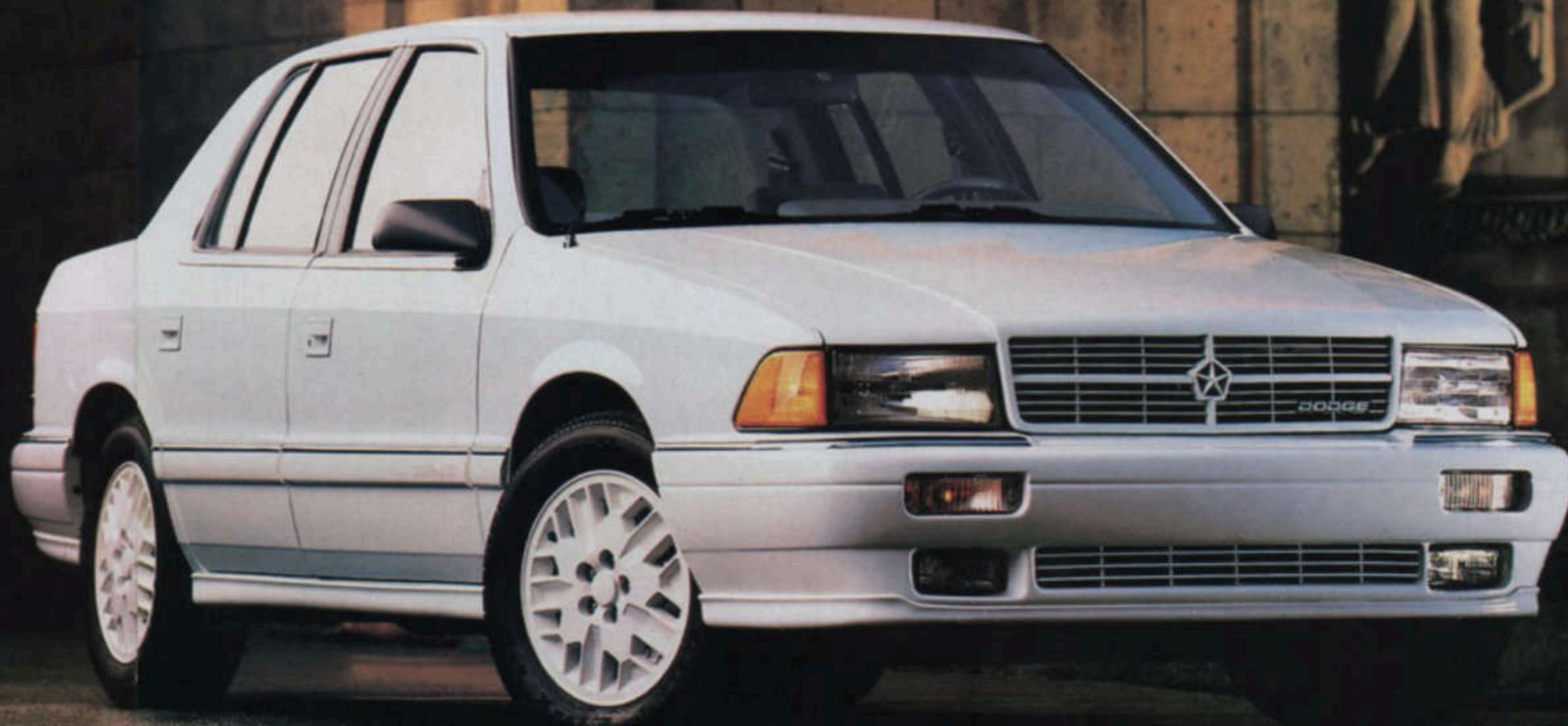
Spirit ES is shown above in Bright White Clear Coat