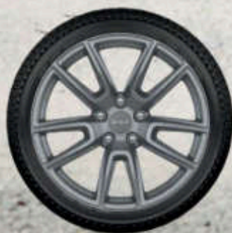
20x10-inch Black Noise Standard on SRT [WPF]