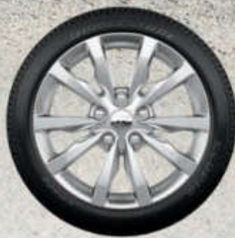
20-inch Platinum Chrome Standard on Citadel [WHC]