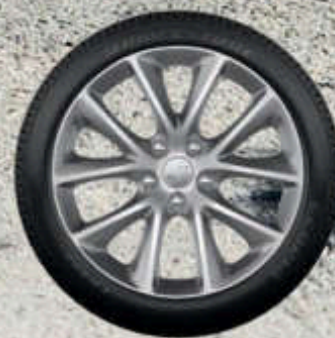
20-inch Satin Carbon Included with Anodized Platinum Appearance Package on Citadel and SXT [WHD]