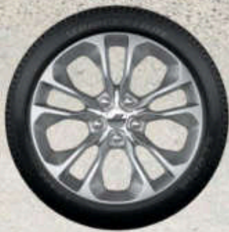
20-inch Satin Carbon Standard on GT and R/T [WBK]