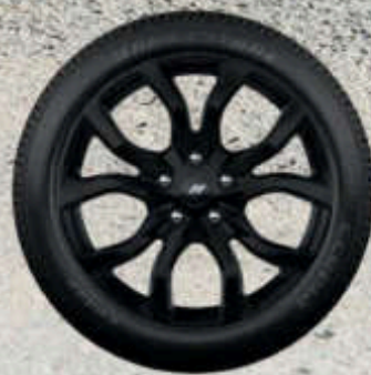
20-inch Gloss Black Aluminum Included with Blacktop Package on SXT, GT and R/T [WHB]