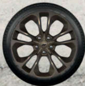
20-inch Brass Monkey [Burnished Bronze] Included with Brass Monkey Appearance Group on GT and R/T [WDE]