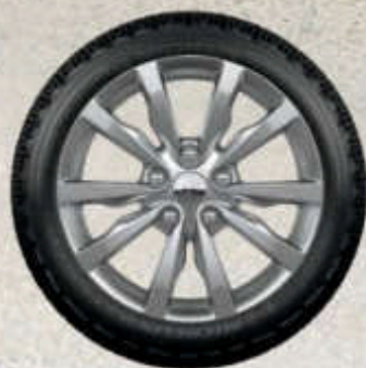
18-inch Technical Grey Standard on SXT [WPI]