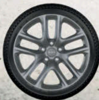
20x10-inch Matte Vapor Optional on SRT [WRS]