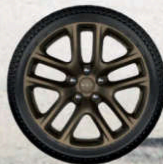
20x10-inch Brass Monkey [Burnished Bronze] Optional on SRT [WSE]