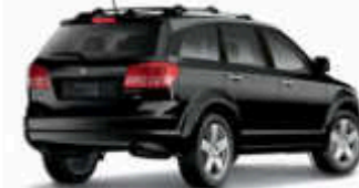
BRILLIANT BLACK CRYSTAL PEARL