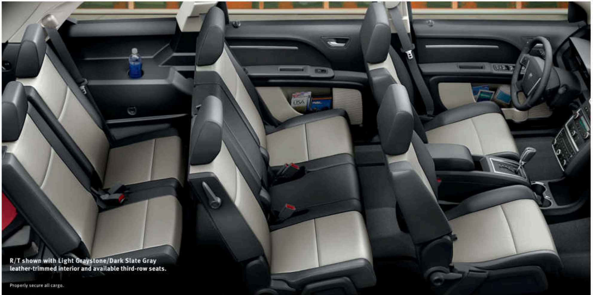
R/T shown with Light Grayscale/Dark Slate Gray leather-trimmed interior and available third-row seats.