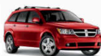
INFERNO RED CRYSTAL PEARL