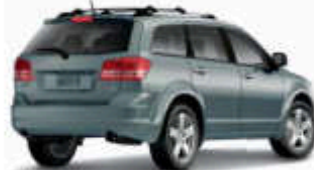
SILVER STEEL METALLIC