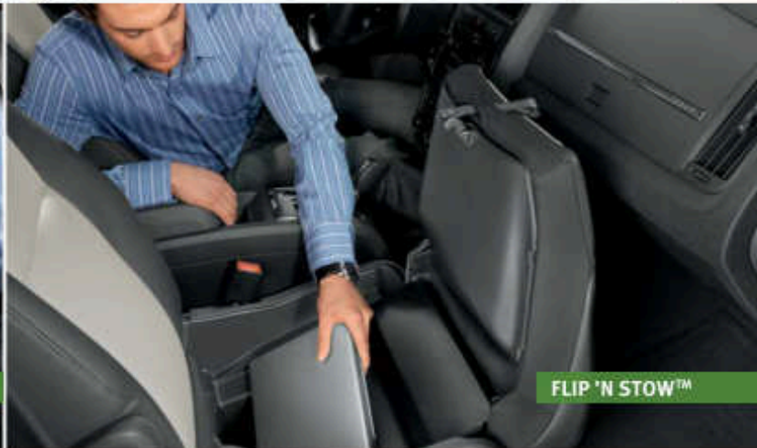
FLIP 'N STOW™