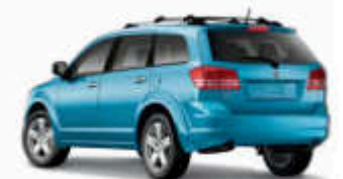
SURF BLUE PEARL (1)