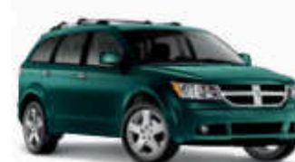
MELBOURNE GREEN PEARL