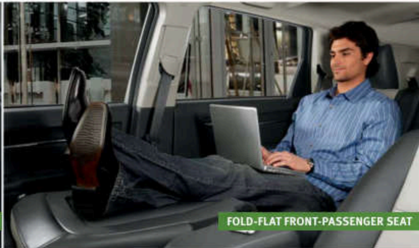
FOLD-FLAT FRONT-PASSENGER SEAT