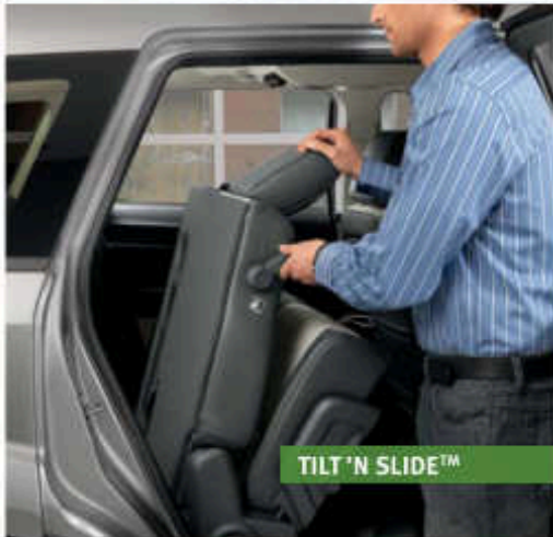
TILT 'N SLIDE™