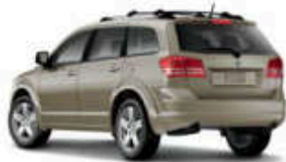
LIGHT SANDSTONE METALLIC