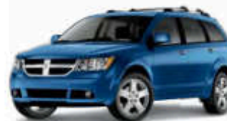
DEEP WATER BLUE PEARL