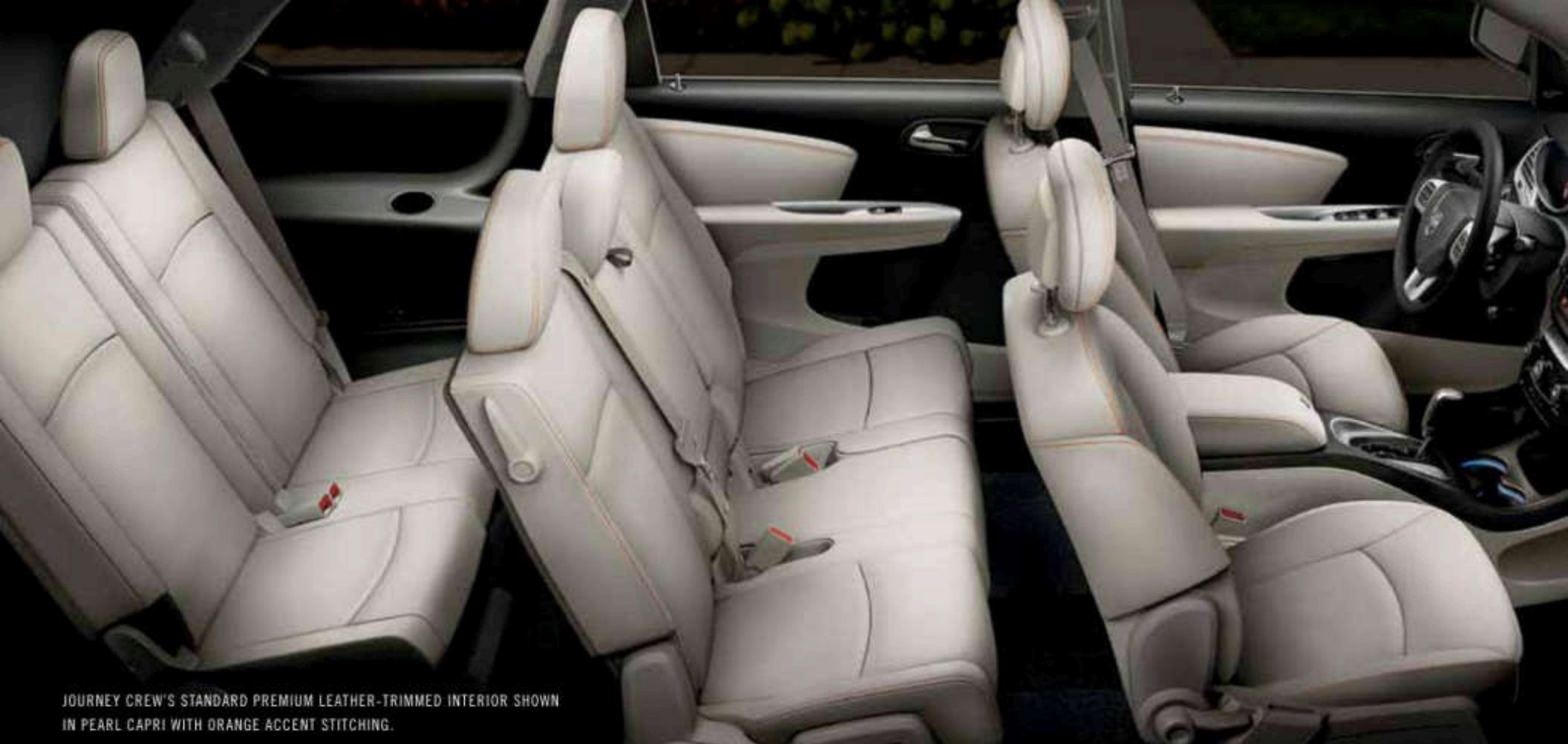
JOURNEY CREW'S STANDARD PREMIUM LEATHER-TRIMMED INTERIOR SHOWN IN PEARL CAPRI WITH ORANGE ACCENT STITCHING.

IT'S GOT GAME AND IT'S GAME FOR ANYTHING. The things you do and the places you go today won't be the same tomorrow. To accommodate, Journey's interior easily transforms from people-mover to cargo-hauler. With flexible five- or seven-passenger seating, second-row reclining 60/40 split-folding seatbacks and inventive storage everywhere, Journey is at the ready. Because getting there should be half the fun, this interior indulges with stadium seating, Dual-Zone Temperature Control and soft-touch surfaces. Seats feature either premium cloth or available leather trim with striking accent stitching. Upscale Satin Silver accents lend a premium touch. Third-row access is easy, thanks to 90-degree rear-door openings and available Tilt 'n Slide™ second-row seats. PARTY IN THE BACK. Traveling without entertainment isn't an option. The center floor console features 12-volt power outlets, remote USB port, auxiliary audio input and out-of-view storage. The available 115-volt/150-watt two-prong outlet powers portable game devices or audio hookups. Second- and third-row passengers will enjoy the available Rear DVD Entertainment System that features a nine-inch screen, premium speakers, two sets of wireless headphones and a remote control.