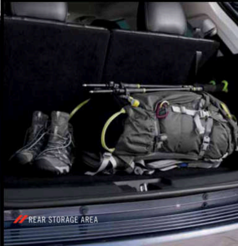
// REAR STORAGE AREA