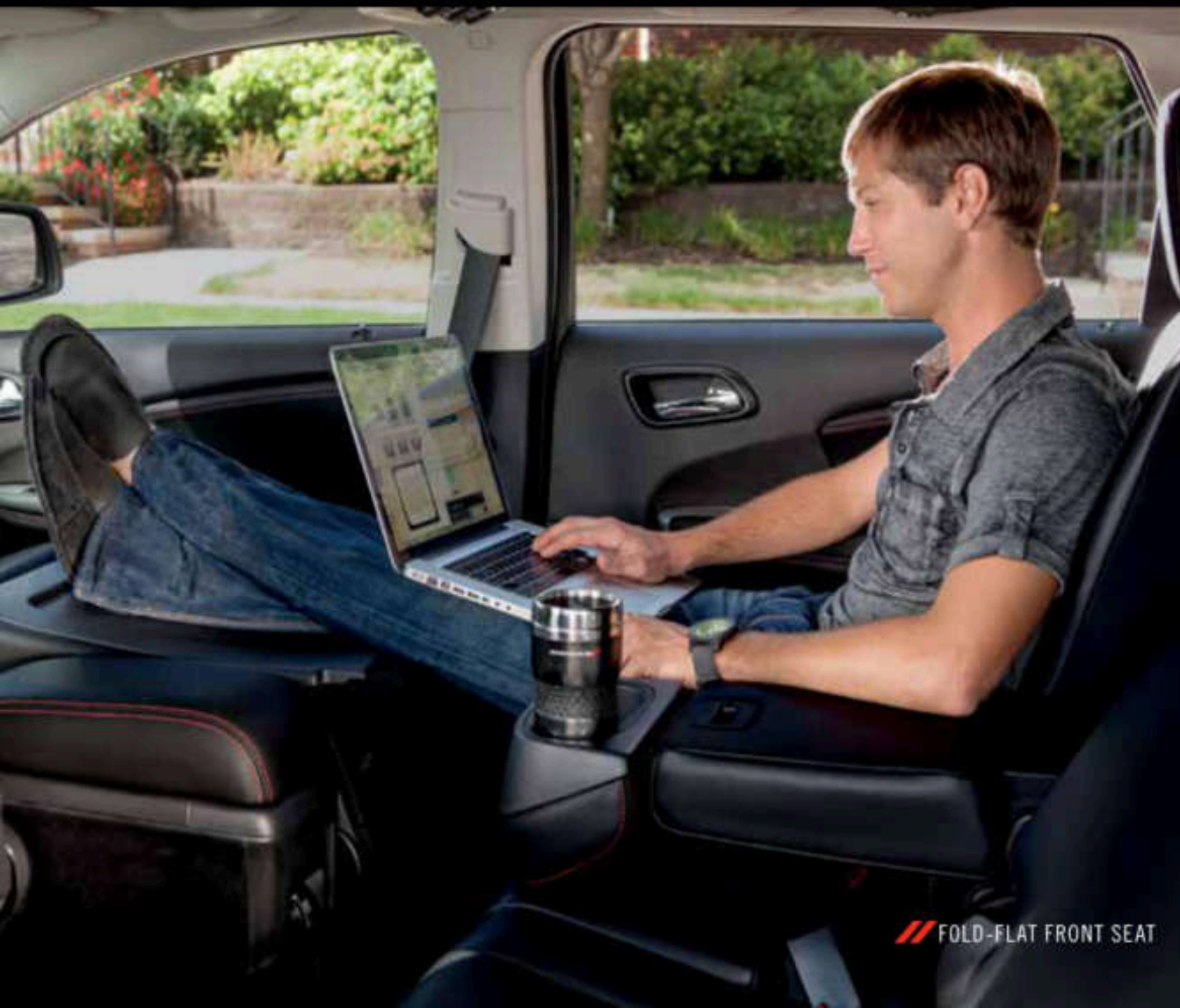
// FOLD-FLAT FRONT SEAT