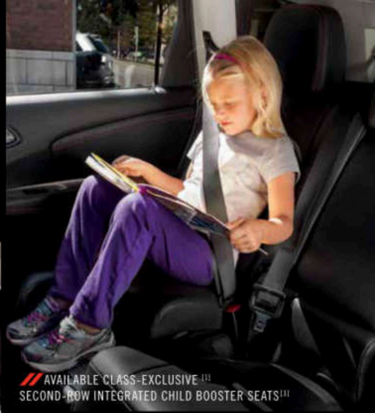
// AVAILABLE CLASS-EXCLUSIVE (3) SECOND-ROW INTEGRATED CHILD BOOSTER SEATS (4)