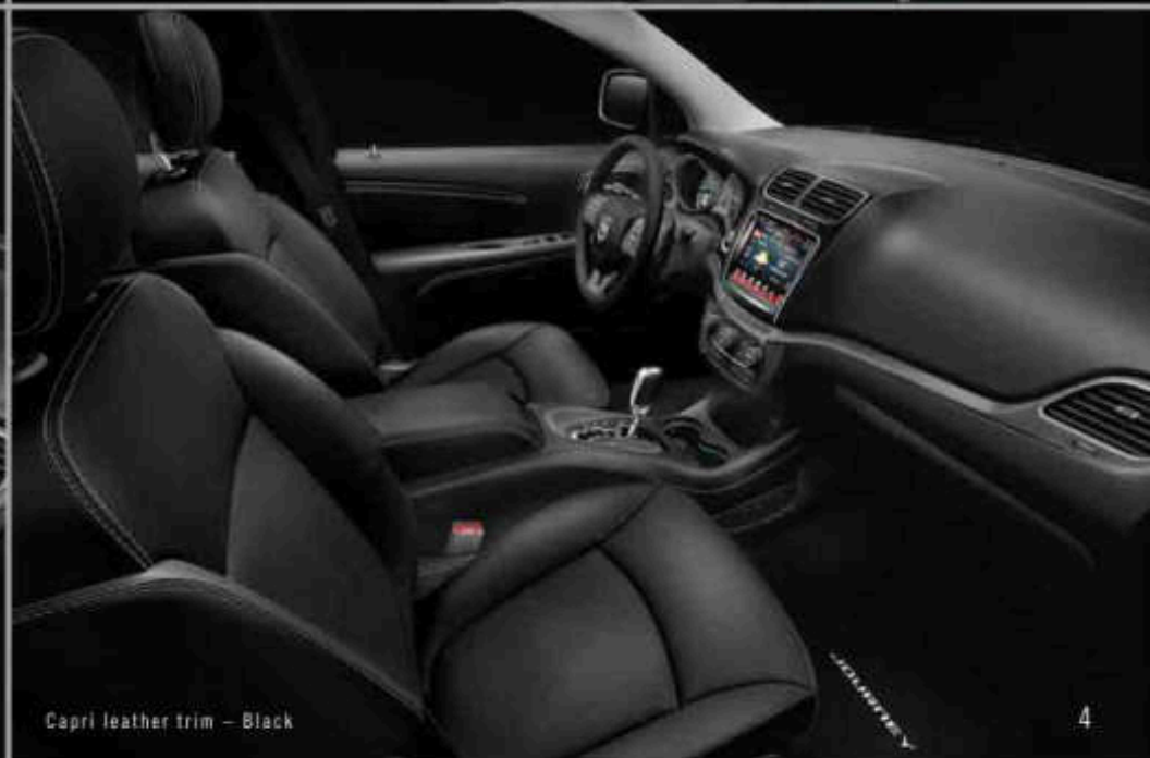
Capri leather trim – Black