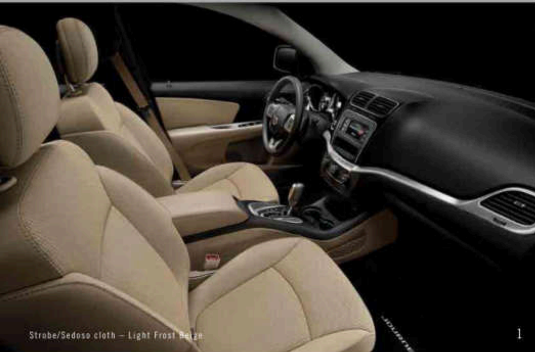
Strobe/Sedoso cloth – Light Frost Beige