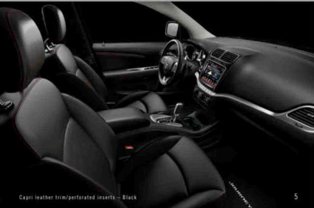
Capri leather trim/perforated inserts — Black