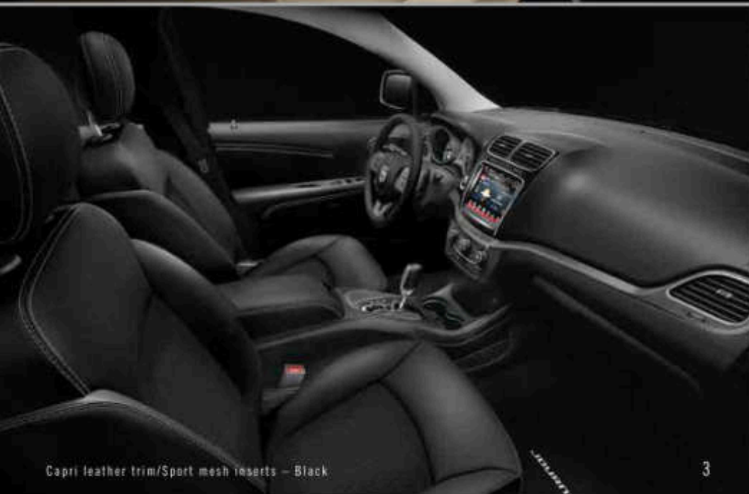
Capri leather trim/Sport mesh inserts – Black