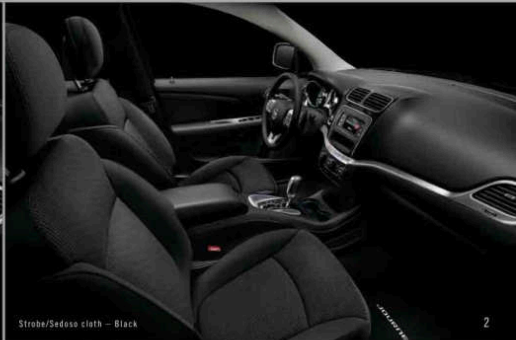
Strobe/Sedoso cloth – Black