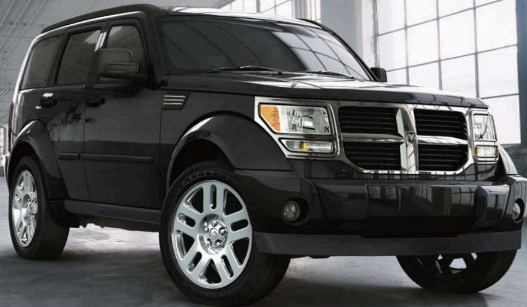
Nitro SLT shown in Brilliant Black Crystal Pearl with striking chrome grille and available 20-inch chrome-clad cast aluminum wheels.

Designed to deliver a big dose of boldness in the world of look-alike SUVs, Dodge Nitro wears its signature Dodge crosshair grille like a badge of honor. Large headlamps attach to the grille for a custom fit and finish appearance. Chiseled lines, tough assertive wheels-to-the-corner stance, striking side vent detailing, chrome accents and body-color fender flares let others know it's time to change lanes. Get the full story at www.dodge.com/nitro