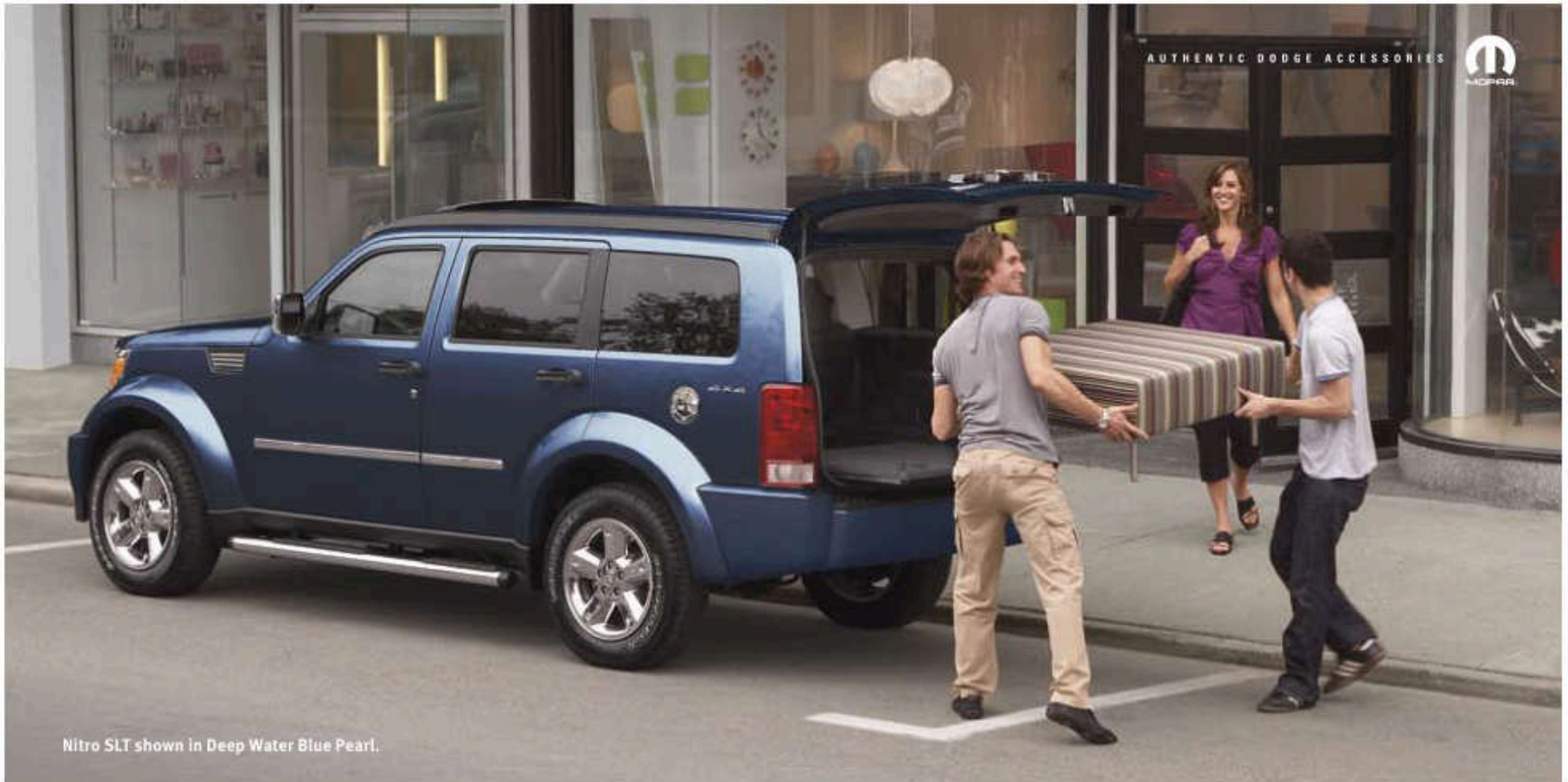
Nitro SLT shown in Deep Water Blue Pearl.

AUTHENTIC DODGE ACCESSORIES. When you enhance your Nitro with Authentic Dodge Accessories by Mopar, you gain far more than substantial style, premium protection, powerful performance or extreme entertainment. You also benefit from the authentic difference found only in an original equipment accessory. It's a difference you'll recognize in the higher standards and tighter tolerances required of original equipment accessories. And one you'll appreciate in our stricter testing measures, from impact performance tests to harsh on- and off-road durability testing. Choose the full line of accessories that feature a fit, finish and functionality designed specifically for your Nitro.