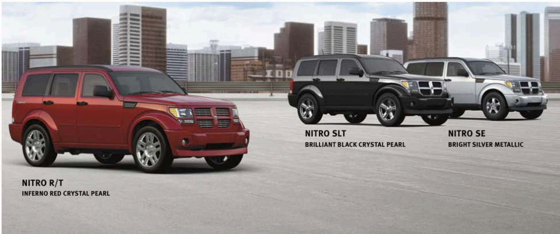
NITRO R/T INFERNO RED CRYSTAL PEARL