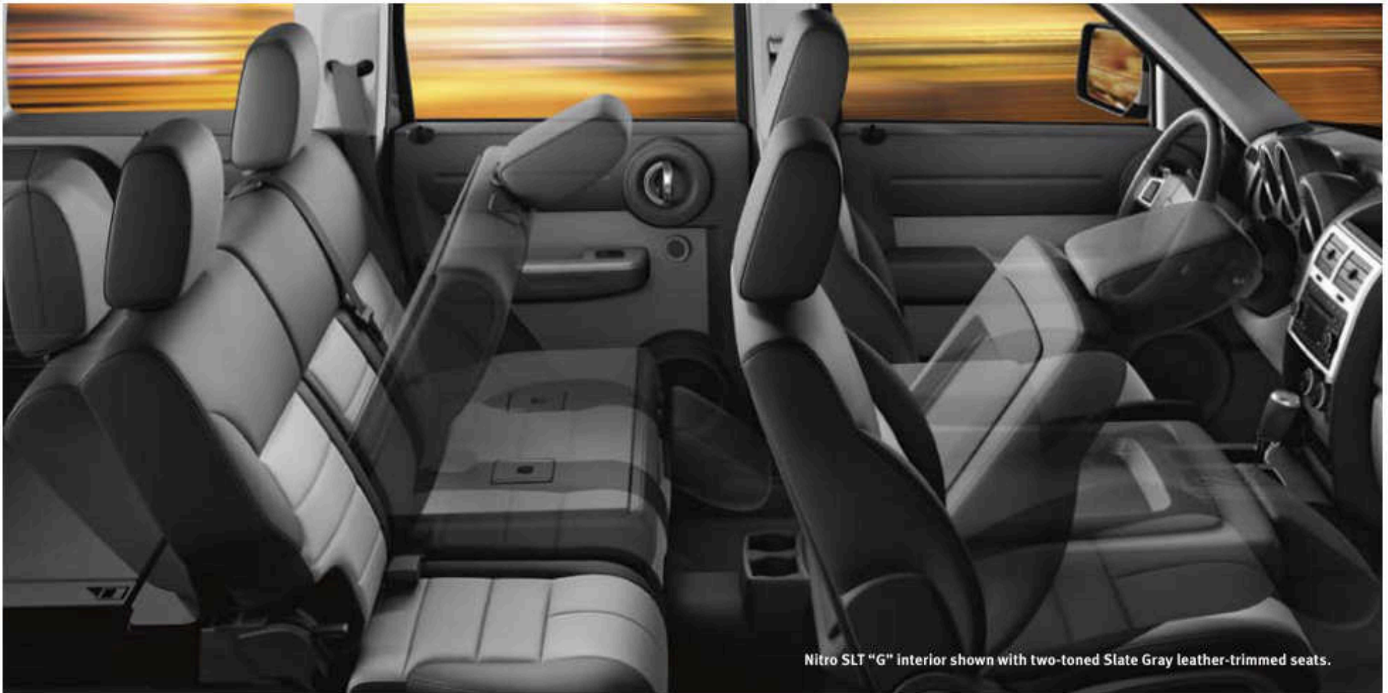
Nitro SLT "G" interior shown with two-toned Slate Gray leather-trimmed seats.

SEATING OPTIONS. FIVE-PASSENGER SEATING. It starts with spacious seating for five adults and an available power six-way driver's seat. And because Nitro's attitude runs deeper than sheet metal and bulked-up tires, there's an interior that's anything but average. Choose between a mix of two-toned or monochromatic configurations and heated leather-trimmed seating choices. Two-toned color configurations reach from seats to the door trim to the instrument panel. Monochromatic packages on R/T models up the ante with Satin Silver accents.