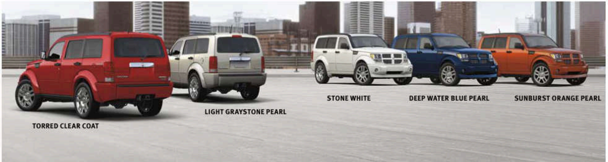
TORRED CLEAR COAT