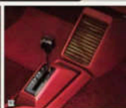
*Dealer installed option. Available approx. May '78.