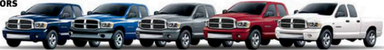
Patriot Blue Pearl