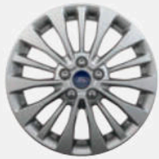
17" Bright Silver-Painted Aluminum Standard: SE