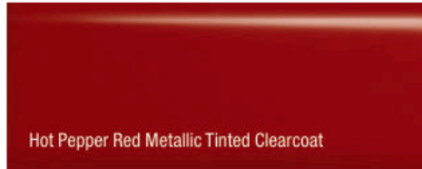
Hot Pepper Red Metallic Tinted Clearcoat