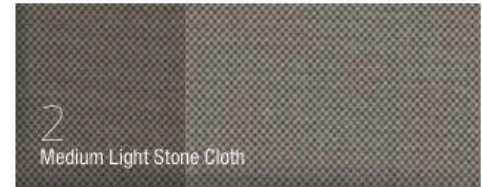
2 Medium Light Stone Cloth