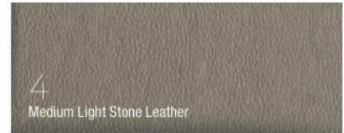
4 Medium Light Stone Leather