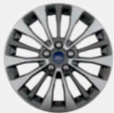
17" Machined Aluminum with Magnetic-Painted Pockets Standard: Titanium