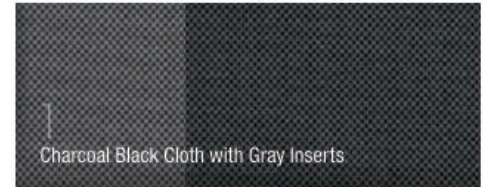
1 Charcoal Black Cloth with Gray Inserts