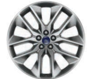
20" Polished Aluminum with Dark Stainless-Painted Pockets Available