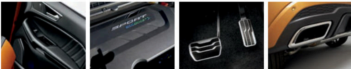
Electric Spice. Available equipment.