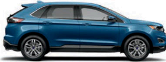
Too Good to Be Blue*