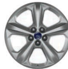
18" Sparkle Silver-Painted Aluminum Standard: SE

3.5L Ti-VCT V6 engine 18" polished aluminum wheels (requires 201A) 2nd-row outboard inflatable safety belts All-wheel drive (AWD) Black roof-rack side rails (n/a with Vista Roof®) Cargo Accessories Package includes interior cargo cover, cargo area protector and rear bumper protector Class II Trailer Tow Package includes trailer sway control Cold Weather Package includes heated steering wheel, and front and rear all-weather floor mats (requires 201A) Dual Headrest DVD by INVISION™ 2 Front and rear all-weather floor mats Locking wheel lug nuts P235/60R18 all-season snow chain-compatible tires Panoramic Vista Roof (requires 201A) Technology Package includes voice-activated Navigation System with pinch-to-zoom capability, and integrated SiriusXM Traffic and Travel Link® with 5-year trial subscription, BLIS® (Blind Spot Information System) with cross-traffic alert, Remote Start System, auto-dimming driver's sideview mirror, and 110-volt power outlet (requires 201A) Utility Package includes hands-free foot-activated liftgate, perimeter alarm, and universal garage door opener (requires 201A)