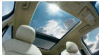
SEL, Magnetic. Available equipment.