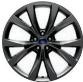
21" Premium Tarnished Dark-Painted Aluminum Available