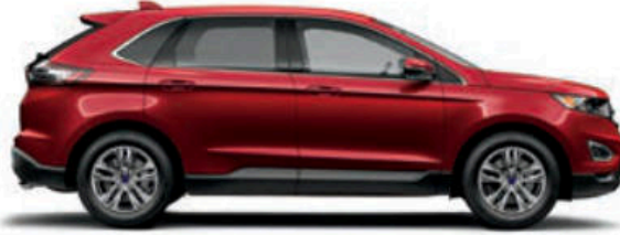
Ruby Red Metallic Tinted Clearcoat