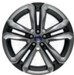
20" Polished Aluminum with Low-Gloss Magnetic-Painted Pockets Standard