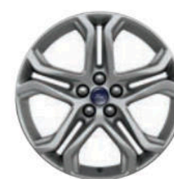
19" Premium Luster Nickel- Painted Aluminum Standard