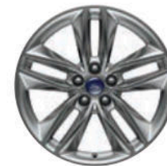
18" Sparkle Silver-Painted Split-Spoke Aluminum Standard: SEL