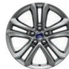
18" Polished Aluminum Available (requires snow chain-compatible tires)