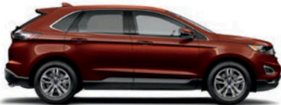
Bronze Fire Metallic Tinted Clearcoat