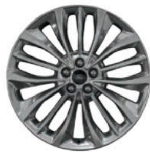
20" Polished Aluminum Included with Titanium Elite Package