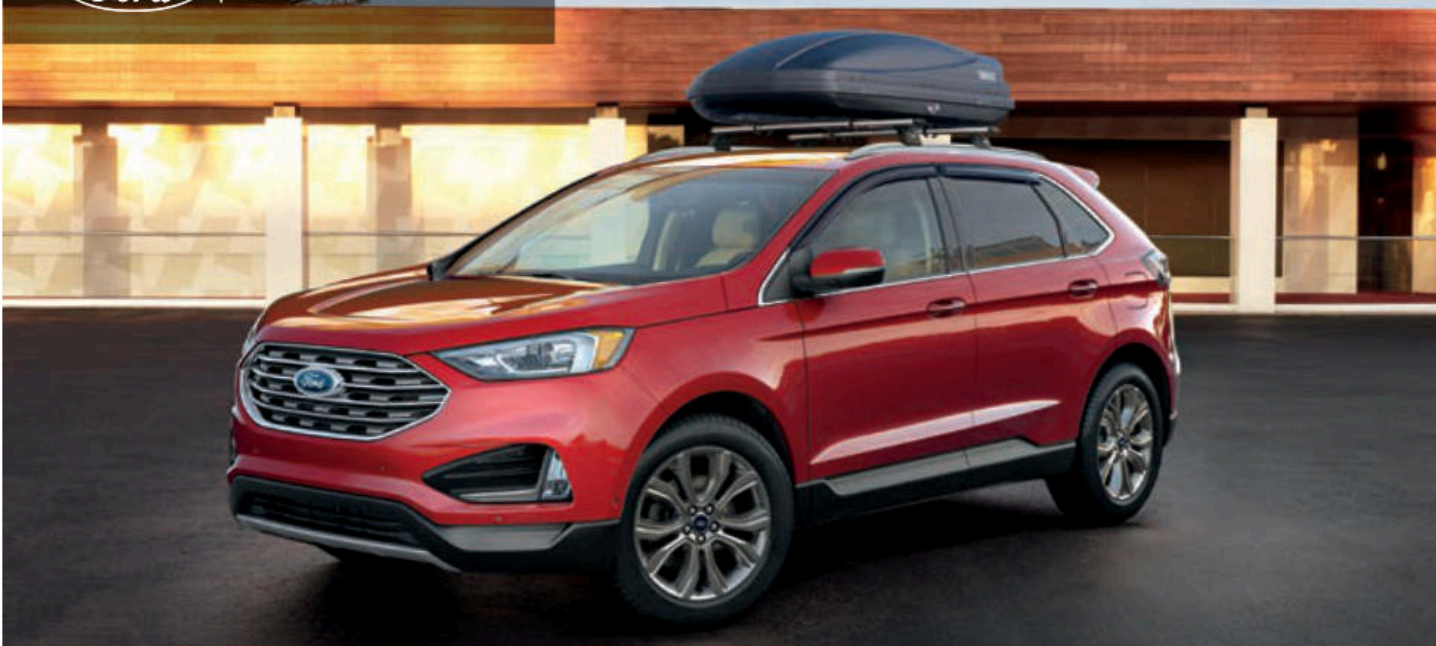
Titanium in Rapid Red Metallic Tinted Clearcoat 1 accessorized with smoked side window deflectors, 2 front and rear molded splash guards, roof-mounted crossbars, 3 cargo box, 2,3 and wheel lock kit