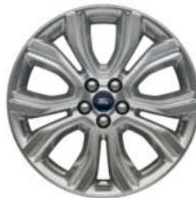
19" Luster Nickel-Painted Aluminum Standard on Titanium