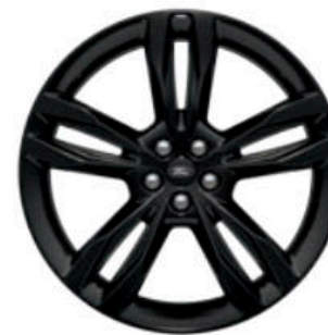
21" Premium Gloss Black-Painted Aluminum Optional; Included with ST Performance Brake Package