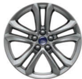
18" Split-Spoke Sparkle Silver-Painted Aluminum Standard on SEL Optional on SE