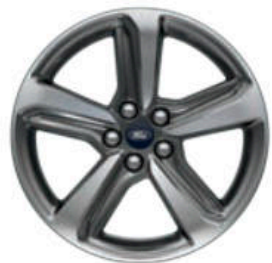
18" Bright-Machined Aluminum with Premium Dark Stainless-Painted Pockets Optional on SEL