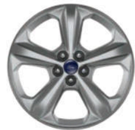
18" Sparkle Silver-Painted Aluminum Standard on SE