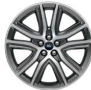
20" Bright-Machined Aluminum with Premium Dark Stainless-Painted Pockets Optional on Titanium