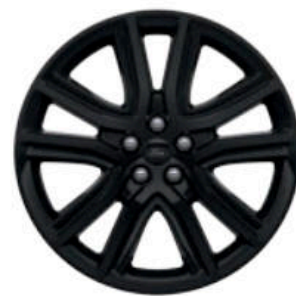
20" Premium Gloss Black-Painted Aluminum Standard on ST-Line