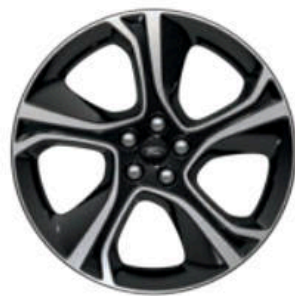
20" Bright-Machined Aluminum with High-Gloss Black-Painted Pockets Standard on ST