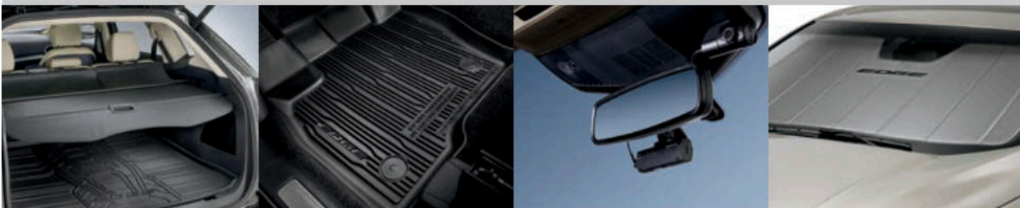
Cargo area protector and cargo cover