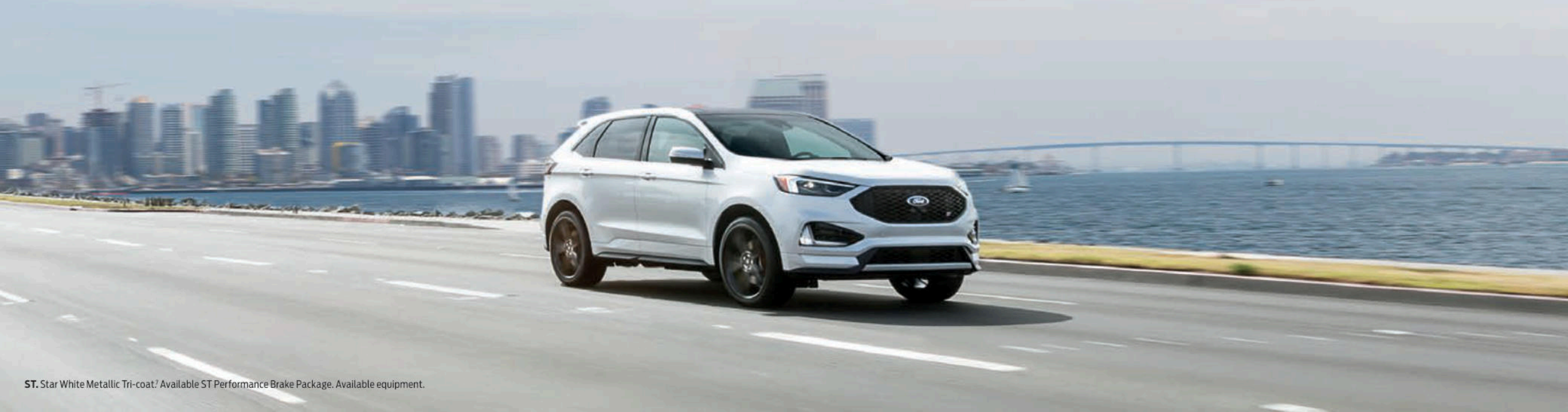
ST. Star White Metallic Tri-coat. 7 Available ST Performance Brake Package. Available equipment.

1. Navigation services requires SYNC® 4 and FordPass™ Connect, complimentary Connected Service and the FordPass App (see FordPass Terms for details). Eligible vehicles receive a complimentary 3-year trial of navigation services that begins on the new vehicle warranty start date. Customers must unlock the navigation service trial by activating the eligible vehicle with a FordPass member account. If not subscribed by the end of the complimentary period, the connected navigation service will terminate, and the system will revert to embedded offline navigation. Connected service and features depend on compatible AT&T network availability. Evolving technology/cellular networks/vehicle capability may limit functionality and prevent operation of connected features. FordPass App, compatible with select smartphone platforms, is available via download. Message and data rates may apply. 2. Ford Licensed Accessory. 3. Restrictions may apply. See dealer for details. 4. Do not place additional floor mats or any other covering on top of the original floor mats. 5. Consult owner's manual for details on roof-rack load limits. 6. Ford does not recommend using summer tires when temperatures drop to approximately 45°F (7°C) or below (depending on tire wear and environmental conditions), or in snow/ice conditions. If the vehicle must be driven in these conditions, Ford recommends using all-season or snow tires. 7. Additional charge.