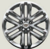
22" Polished Aluminum with King Ranch Center Caps Optional: King Ranch