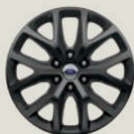
20" Magnetic-Painted Aluminum Included: Limited Appearance Package