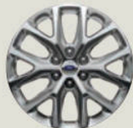
20" Polished Aluminum Standard: Limited