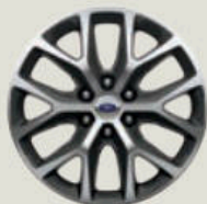
20" Bright-Machined Aluminum with Magnetic-Painted Pockets Available: XLT