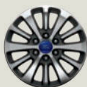
18" Bright-Machined Aluminum with Magnetic-Painted Pockets Standard: XLT