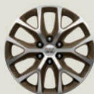
20" Bright-Machined Aluminum with Caribou-Painted Pockets and King Ranch Center Caps Standard: King Ranch