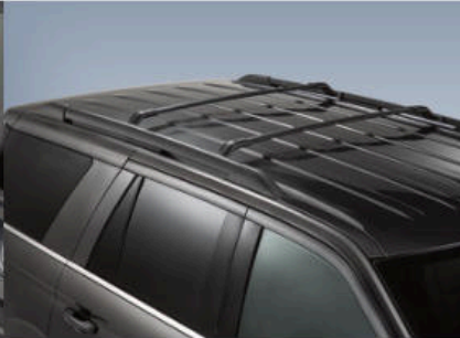
Roof crossbars 2