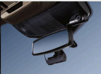
Dash cam systems 1

SHOP THE COMPLETE COLLECTION | accessories.ford.com