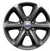
18" MAGNETIC- PAINTED CAST-ALUMINUM

Cargo Package: advanced cargo manager and roof-rail crossbars Heavy-Duty Trailer Tow Package: heavy-duty radiator, Pro Trailer Backup Assist, 3.73 electronic limited-slip rear differential (eLSD), integrated trailer brake controller, and 2-speed automatic 4WD (4x4 only) with