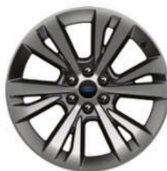
22" 6-SPOKE PAINTED MACHINED-FACE ALUMINUM WITH DARK TARNISH-PAINTED POCKETS Included with 302A