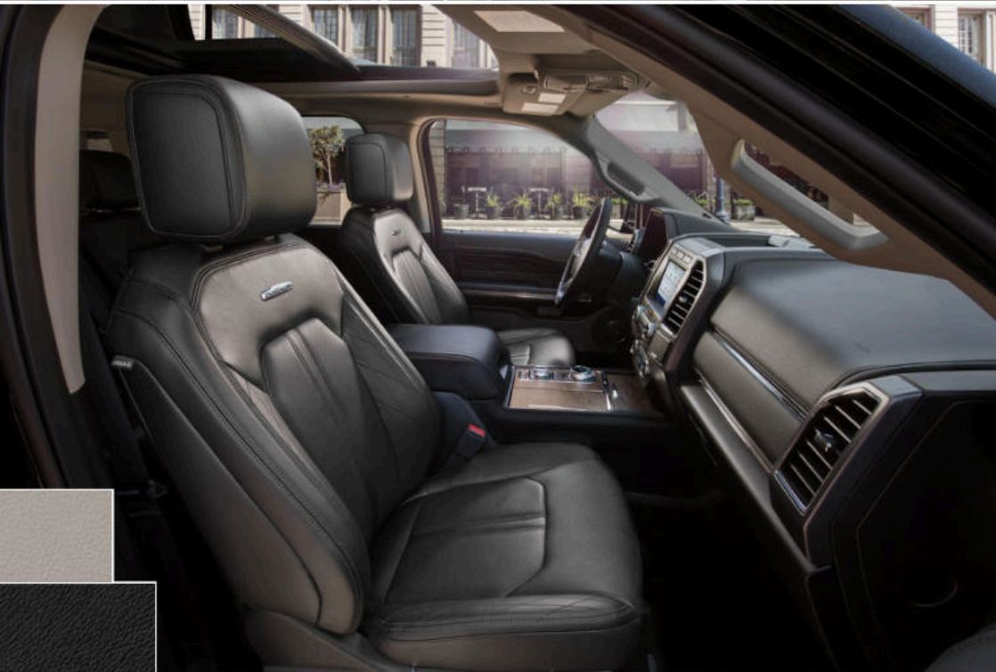
LEATHER-TRIMMED SEATING SURFACES: Medium Soft Ceramic, Ebony

ENHANCED 3.5L ECOBOOST V6 WITH AUTO START-STOP TECHNOLOGY 10-SPEED AUTOMATIC TRANSMISSION