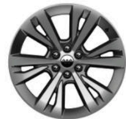
22" 6-SPOKE PAINTED MACHINED-FACE ALUMINUM WITH DARK TARNISH- PAINTED POCKETS AND KING RANCH CENTER CAP

Cargo Package: advanced cargo manager, and roof-rail crossbars Heavy-Duty Trailer Tow Package: heavy-duty radiator, Pro Trailer Backup Assist,™ 3.73 electronic limited-slip rear differential (eLSD), integrated trailer brake controller, and 2-speed automatic 4WD (4x4 only) with Neutral towing capability 4-wheel drive (4WD) (includes 1-speed transfer case, Terrain Management System,™ Hill Descent Control and front tow hooks) Dual-Headrest Rear Seat Entertainment System 3 Engine block heater Floor liners for 1st and 2nd rows Inflatable 2nd-row safety belts in outboard seating