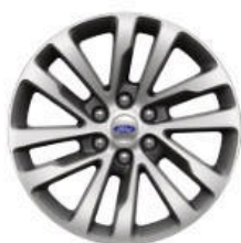
20" PREMIUM DARK TARNISH-PAINTED ALUMINUM Standard

Voice-Activated Touchscreen Navigation System with pinch-to-zoom capability (includes SiriusXM Traffic