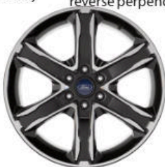
22" PREMIUM BLACK-PAINTED ALUMINUM Included with Stealth Edition (303A), Special Edition and Texas Edition Packages