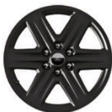
20" 6-SPOKE GLOSS BLACK-PAINTED ALUMINUM Optional 3 Not available with 302A, or Stealth Edition (303A), FX4 Off-Road, Special Edition or Texas Edition Packages