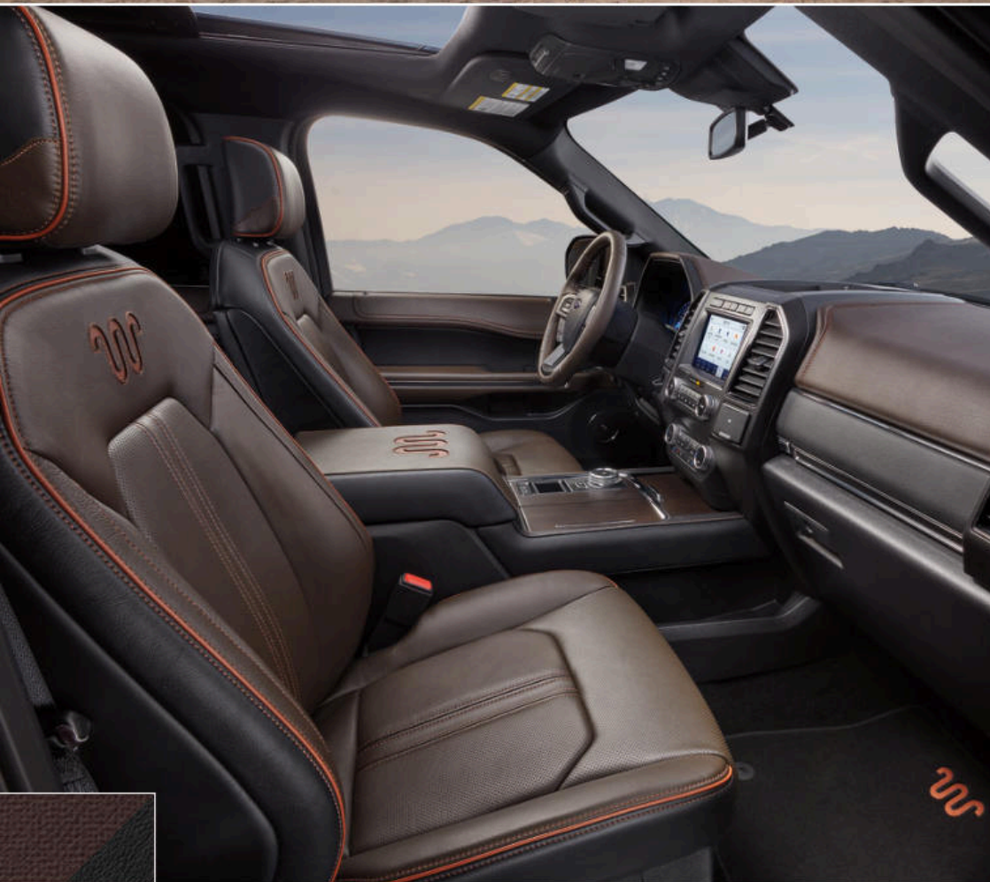
DEL RIO LEATHER-TRIMMED SEATING SURFACES: Mesa/Ebony

Available equipment shown. 1 Additional charge. 2 Metallic. 3 Ford Licensed Accessory.