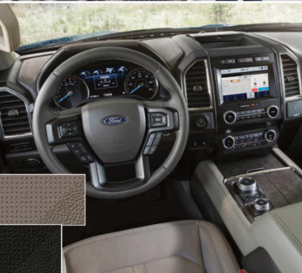
LEATHER-TRIMMED SEATING SURFACES: Medium Stone, Ebony