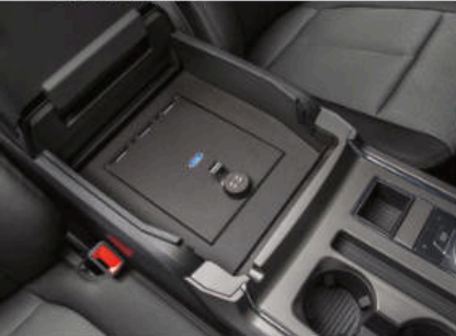
In-vehicle safe 1

Expedition MAX Platinum in Rapid Red Metallic Tinted Clearcoat accessorized with hood deflector, side window deflectors, 1 splash guards, 1 roof crossbars, and