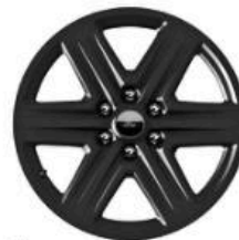
20" 6-SPOKE GLOSS BLACK- PAINTED ALUMINUM Included

2nd-row 40/20/40 split-fold seats with CenterSlide ® and manual recline (201A or 202A with Black Accent Package) 4-wheel drive (4WD) (includes 1-speed transfer case, Terrain Management System, 3 Hill Descent Control and front tow hooks) Floor liners for 1st and 2nd rows Power, panoramic Vista Roof ® with power sunshade (requires 201A or 202A) Reversible cargo mat Voice-activated Navigation System with pinch-to-zoom capability (includes SiriusXM ® Traffic and Travel