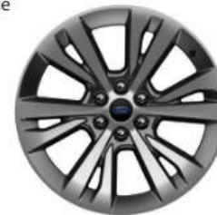
22" 6-SPOKE PAINTED MACHINED-FACE ALUMINUM WITH DARK TARNISH- PAINTED POCKETS Standard

Heavy-Duty Trailer Tow Package: heavy-duty radiator, Pro Trailer Backup Assist,™ 3.73 electronic limited-slip rear differential (eLSD), integrated trailer brake controller, and 2-speed automatic 4WD (4x4 only) with Neutral towing capability 2nd-row power-folding tip-and-slide captain's chairs 4-wheel drive (4WD) (includes 1-speed transfer case, Terrain Management System,™ Hill Descent Control and front tow hooks) Dual-Headrest Rear Seat Entertainment System 4 Engine block heater Floor liners for 1st and 2nd rows Reversible