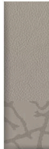
Light Stone Leather - Available