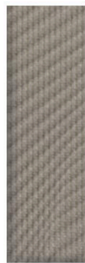
Medium Light Stone Cloth - Standard