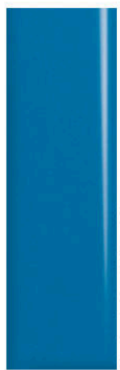
Blue Candy Metallic Tinted Clearcoat