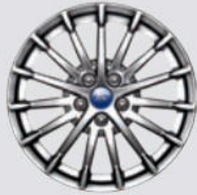
17" 15-Spoke Sparkle Silver-Painted Aluminum